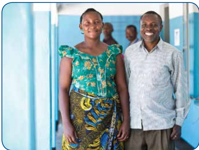
A couple attending a reproductive health visit at a CHAMPION-supported health facility.

CATs conducted awareness-raising and outreach events, such as dramas, health fairs, and community dialogues, with the support of CHAMPION staff and local partner organizations. Individual champions were also identified by their communities as role models of gender-equitable behavior to lead advocacy efforts within their communities.