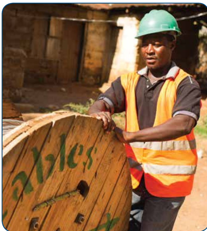
Symbion Power employee at work after participating in an HIV education session led by a fellow worker trained by CHAMPION as a workplace-base peer health educator

"Since 2009, CHAMPION provided important technical and financial support to the Tripartite Plus Forum for HIV and the Work of Work, enabling several member companies to develop effective workplace HIV and AIDS policies and interventions. CHAMPION also built the capacity of ATE trainers to facilitate workplace-based education dialogues on HIV and gender equity. Now we can conduct these dialogues ourselves."