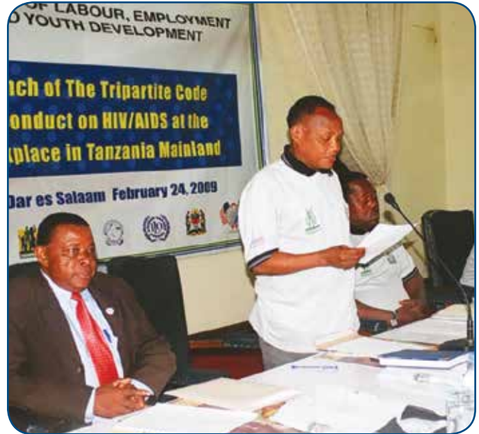
Tripartite Forum member provides remarks during the Ministry of Labour, Employment, and Youth Development launch of the Tripartite Code of Conduct on HIV and AIDS at the Workplace in the Tanzania Mainland in 2009.

The ILO should continue to advocate for the importance of the workplace as a strategic venue for awareness-raising, prevention, care, and the protection of worker's rights. The efforts of individual forum partners contribute to a stronger, more cohesive national response to HIV and should be encouraged to share lessons learned with the TPF partners. The ILO Code of Practice on HIV/AIDS and the World of Work (ILO, 2003) and Recommendation concerning HIV/AIDS and the World of Work (No. 200) (ILO, 2010) are powerful and adaptable tools that partners should continue to use to initiate and extend action in the world of work. These documents paved the way for the development of an