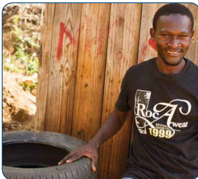
Mobile worker from the Morogoro Region after attending a workplace HIV education session.

To ensure the long-term viability of this important network, a more sustainable financing and management/coordination mechanism is needed that distributes responsibility for forum operations among all partners. To date, the ILO and CHAMPION provided in-kind support to ensure that the forum convened consistently. An additional challenge was linking local labor officers from the MoLE trained by CHAMPION to workplace programs when they were not already associated with specific worksites. Future projects should work with the MoLE to consider ways to link this cadre of trainees to sites they can directly support.