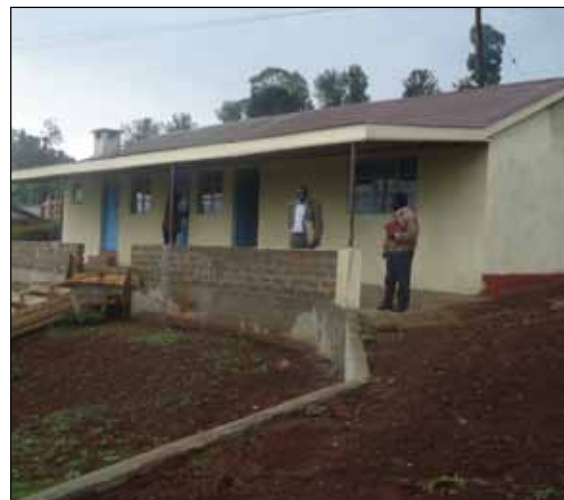
Masaba Hospital undergoing renovations to provide youth-friendly services.

APHIA II Nyanza is also working to improve reproductive health in the province, with a special focus on reaching young people with reproductive health services. Among the project's areas of focus for health facilities is the provision of comprehensive obstetric care (including handling emergency deliveries). The project supports whole-site orientations on specific topics, such as neonatal resuscitation and management of the third stage of labor. APHIA II Nyanza also supports quality monitoring of reproductive health services and training on such topics as emergency obstetric care, focused antenatal care, malaria in pregnancy, customer care, youth-friendly reproductive health services, and postabortion care.