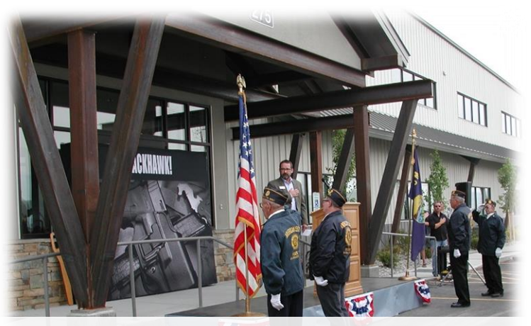
Manhattan facility ATK BLACKHAWK! ceremony 2012

MMEC and Prospera remain committed to strengthening cluster development and were able to leverage the ACE grant, as a cost savings to the participating companies. The effort built a core group to attract a machine expert, whose clients include IBM and Honda, and leveraged the power of complementary trainings. The ACE grant covered approximately half of the training costs.