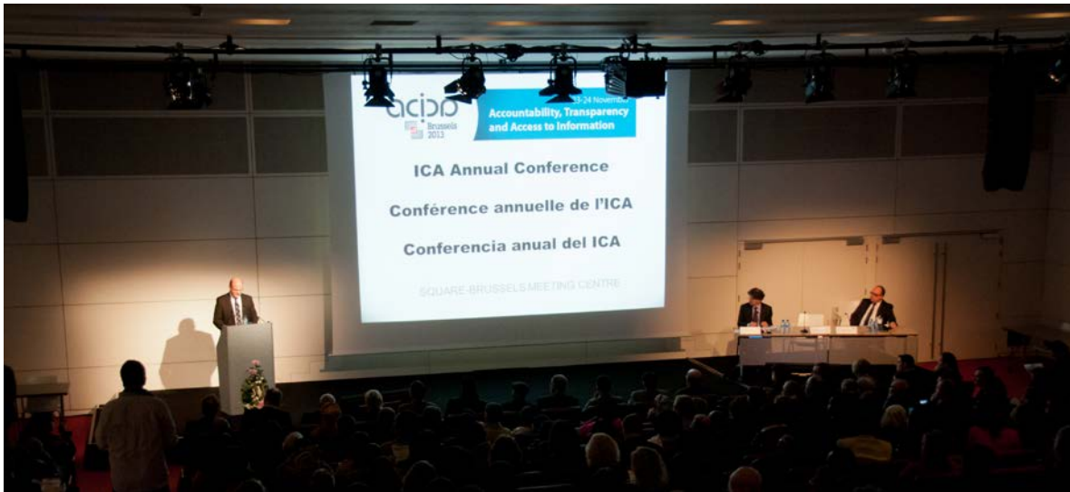
ICA Annual Conference on "Responsibility, Transparency and Access to Information", Brussels, 2013