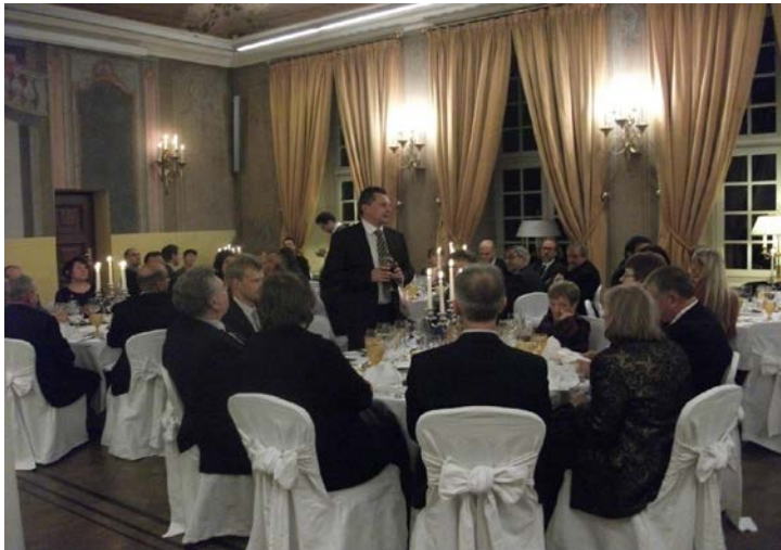
The social event for EBNA participants, organised by the Office of the Chief Archivist of Lithuania, Oct. 2013

embraced preservation of historical archives, new European Union Regulation on personal data protection and archives, some aspects of the practical document management in the European Commission, and the implementation of continuous projects in the field of the EU archives.