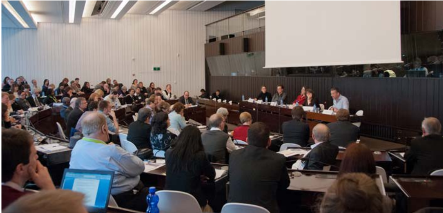
One of the sessions of the Annual Conference, 24 November, Square Congress Centre in Brussels

The acts of the conference won't be published as such, but COMMA, the ICA magazine, will bring a digest of some of the contributions.