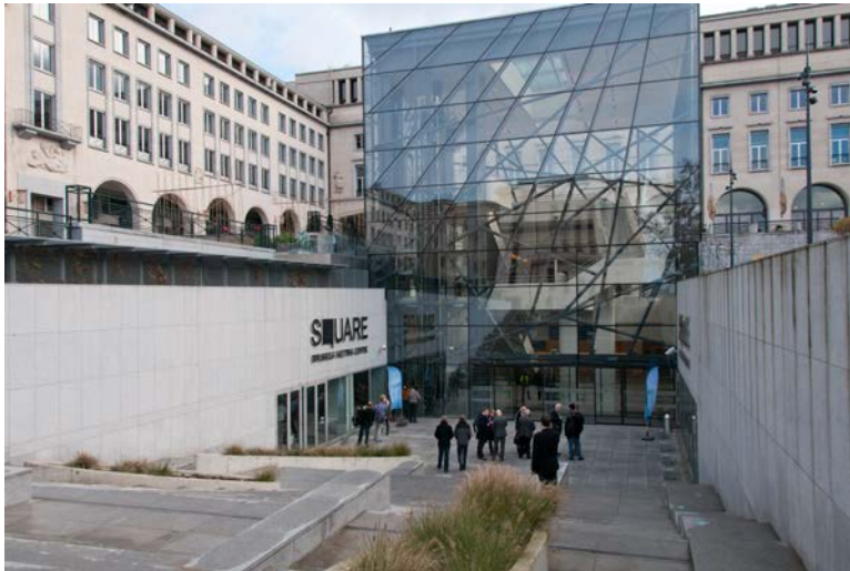
The Brussels “Square” congress centre, ICA Annual Conference, 23-24 November 2013

After the plenary, three parallel sessions were organised, each with heterogeneous and very interesting presentations and debates. Summaries of the sessions and participant’s testimonies can be found on the ICA-website .