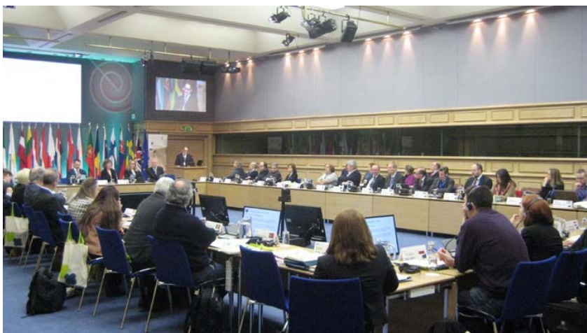
The EBNA session in Dublin