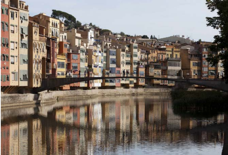
The motif of Girona

Girona was founded by the Romans 21 centuries ago and has an impressive old town with Romanesque, Gothic and Baroque churches and a beautiful Cathedral. The city also has a very well preserved Jewish Quarter and a big part of its roman and medieval walls and streets remain intact.