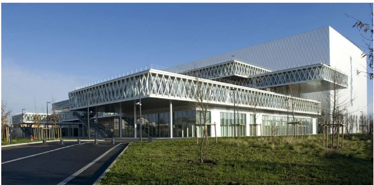
“Photo of the year” the National Archives at Pierrefitte-sur-Seine