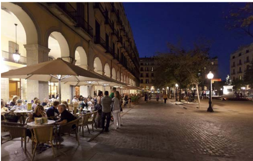
Girona by night, photo: © Jordi S. Carrera

It's very well connected by plane (Girona low cost airport and Barcelona airport) and by high speed train.