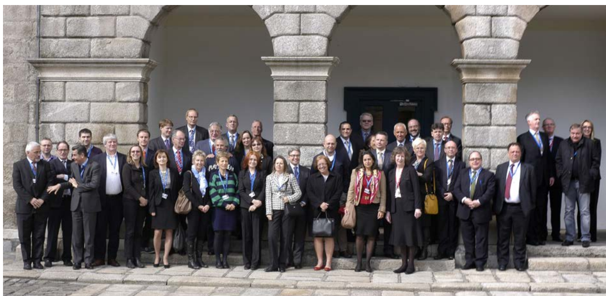
Participants of the EBNA/EAG meeting in Dublin, April 2, 2013