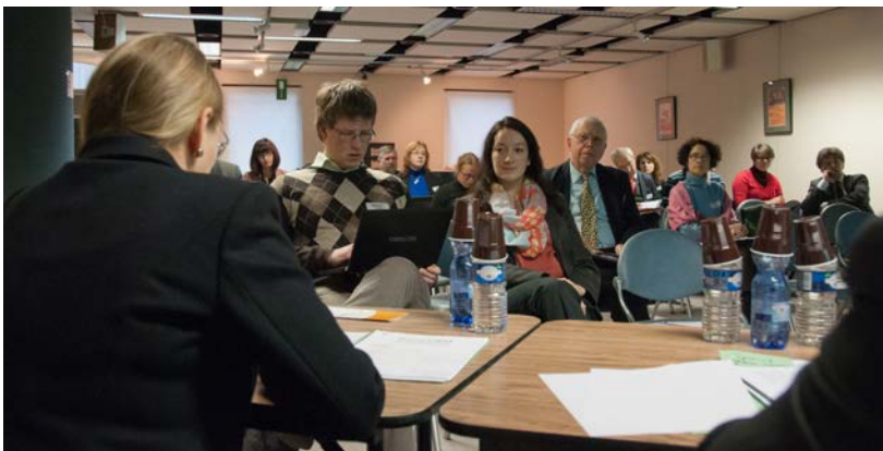
Meeting of the APEX-EURBICA in Brussels