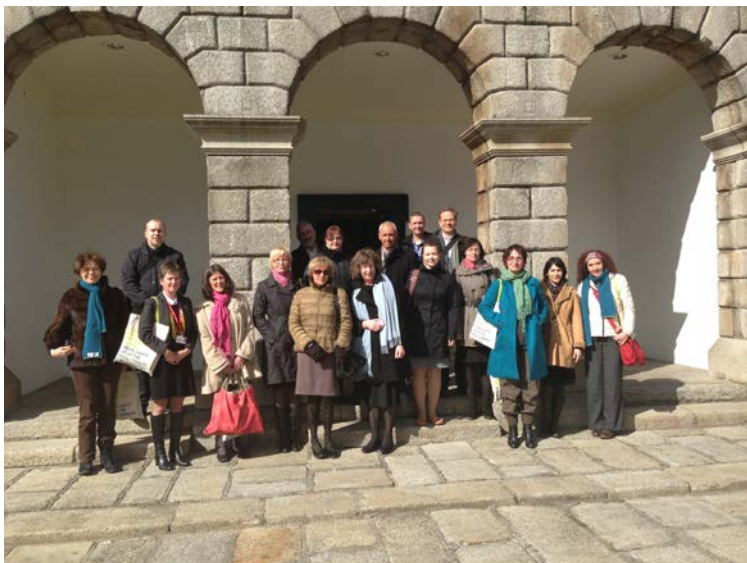
Participants of the meeting of Heads of Conservation in Dublin, April 4, 2013 (photo: the National archives of Ireland).

The presentations, reports and discussion centred on dust and mould, and research and solutions to this problem. Visits to the National Archives and the Conservation Department of Trinity College Library were included in the day.