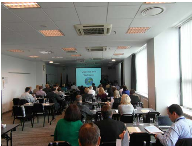
DLM Forum meeting, Vilnius, October 10 – 11, 2013

On October 10 – 11, 2013, the Meeting and Conference of the DLM (Document Life Cycle Management) Forum Members took place in the Conference Centre of the Radisson Blue Hotel Lietuva in Vilnius. The events are usually held every semester in the country presiding to the Council of the European Union. The presentations delivered on the first day of the Meeting addressed the problems arising in the information society and the ways to solve them, the development of the projects under implementation (E-ark and EU Wiki) and the new initiatives.