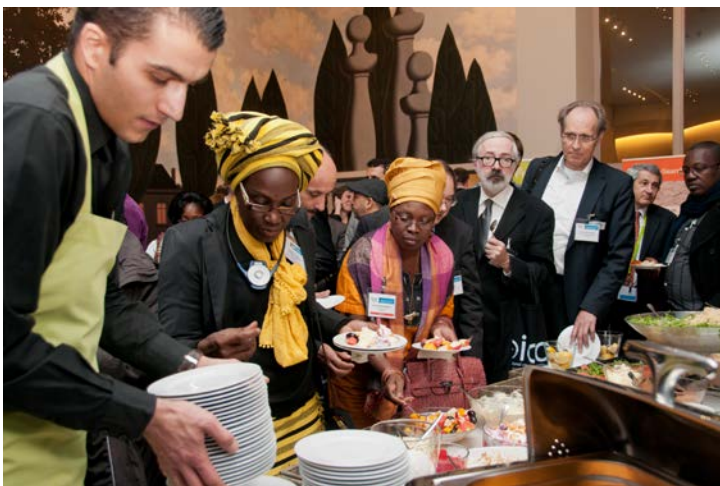
Participants of the conference during the lunch time, Brussels, November 2013

The Forum of National Archivists (FAN) took place on Friday 22 November at the nearby Royal Library. The summary of the meeting is available on the ICA website . The General Assembly of ICA was held at the end of the afternoon on Saturday 23 November in The Square.