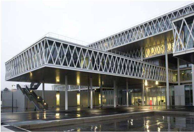
Part of the building, the National Archives at Pierrefitte-sur-Seine

contract in May 2005. On 11 February 2013, the building, which had already been open to the public since 21 January, was inaugurated by President François Hollande.