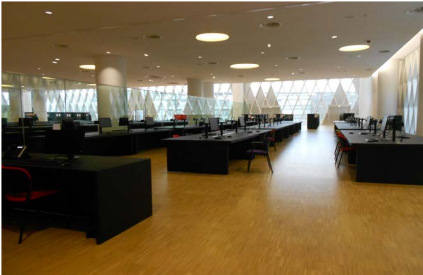
The reading room in the new premises in Paris

The administrative and reception building (exposition spaces, educational areas, auditorium, meeting and working rooms) is composed of 10 “satellites”, mostly covered with windows, superposed and linked via glass and aluminium footbridges.