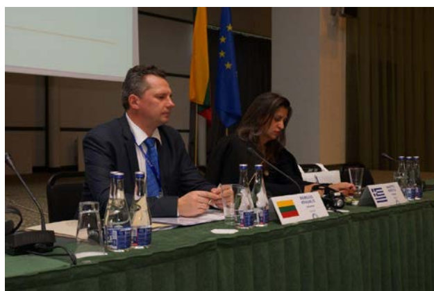
The 28th conference of the European Board of National Archivists (EBNA) in Vilnius