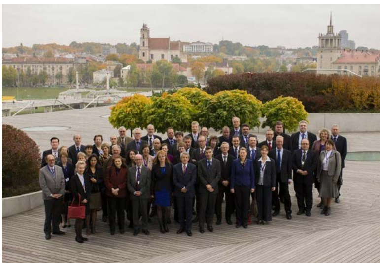
Participants of the EBNA/EAG meeting in Vilnius, October 2013