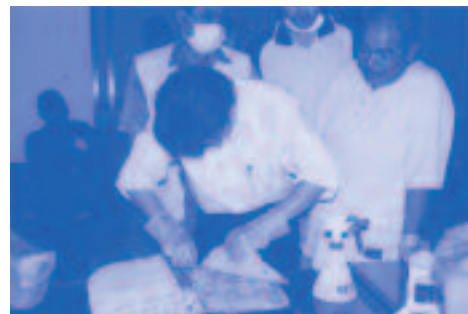
Restoration of Archives