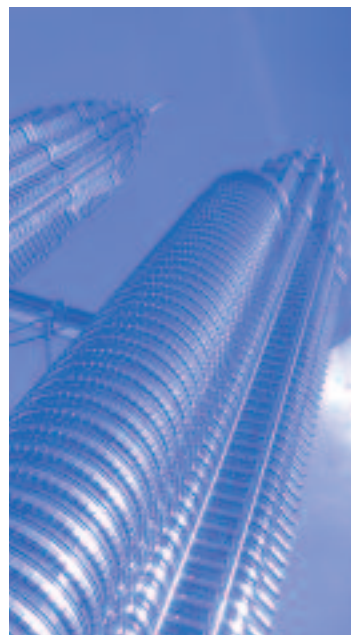
Petronas Towers-Kuala Lumpur

Make a note in your diaries now and look out for further announcements.