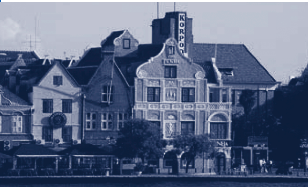
View of Curaçao

A multicultural and multiethnic society, the Netherlands Antilles, which will host the forthcoming CITRA, are especially well positioned to tackle the theme proposed in 2006 Sharing Memory Through Globalization. Indeed the diversity of the Caribbean cultural and archival traditions, and their natural openness to the outside world facilitates the exchange and sharing of experiences.