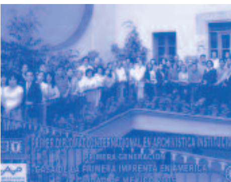
First Archival Workshop of the Federal District, Mexico