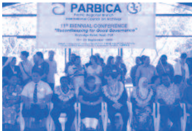
PARBICA Conference 2005

Further information : contacts@eurbica.org