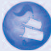
Logo CITRA 2006