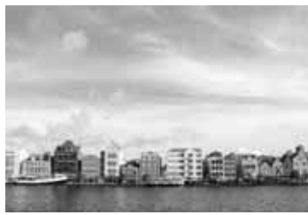
The facade of Willemstad, Curaçao, venue of the CITRA 2006

symposium was a great success and involved participants from government agencies, local archives, academic circles, and the media. We believe this success resulted in part from our experience at an international level, with the ICA in Vienna. The newly amended ICA Constitution and the four approved priority areas for ICA 2004-2008, will further affect the activities of EASTICA. In response to one of the four new priority areas, "Education and Training", the EASTICA Executive Board Meeting held at Busan (Korea) in November 2004 decided to hold the third Postgraduate Certificate in Archival Studies Program in Macao in 2005. This Archival Studies Program was launched in 2003 in Hong Kong, co-organized by EASTICA and Hong Kong University.