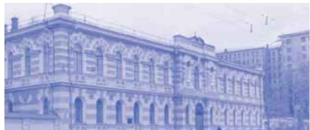
The building of the Russian State Archives of Ancient Acts (Records), housing the oldest documents of Russian history