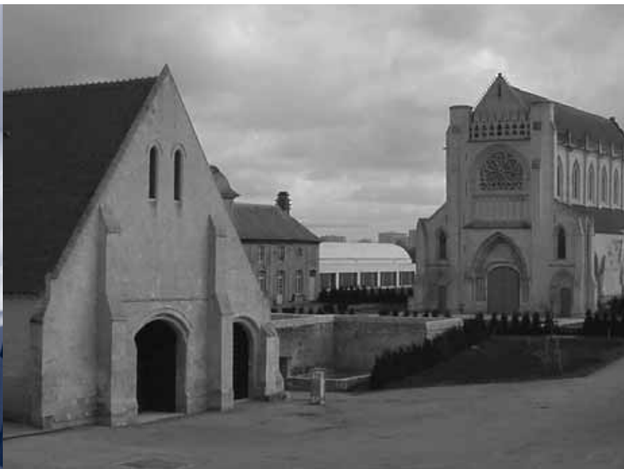
The Abbey of Ardenne, site of the Institute of Contemporary Publishing Archives (IMEC)