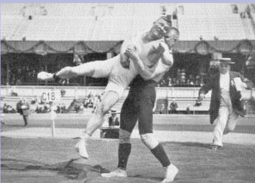
Olympic Games, Stockholm, 1912