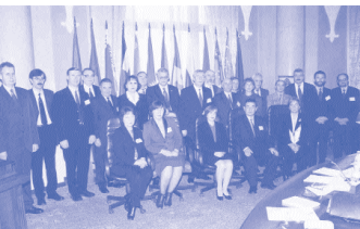
The participants at EURASICA's General Conference in Minsk.

The state archives of seven countries in the Eurasia Regional Branch of ICA (EURASICA) recognized a transition from a basic 'survival' strategy to increasing progress at EURASICA's 4th General Conference, in Minsk, Byelorussia, on 10 November 2003.