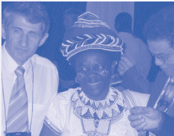
CITRA 2003 participants

The Vienna Congress will be the venue for a landmark series of meetings bringing together professional leaders from ICA's African member countries to draft ICA's agenda of goals and actions for archives in Africa. Drawing on the momentum of the meetings of government leaders and archives directors held during the 2003 CITRA in Cape Town, this African agenda will create a framework for archivists from all parts of the continent to define their priorities on the basis of their own contexts, needs and potential.