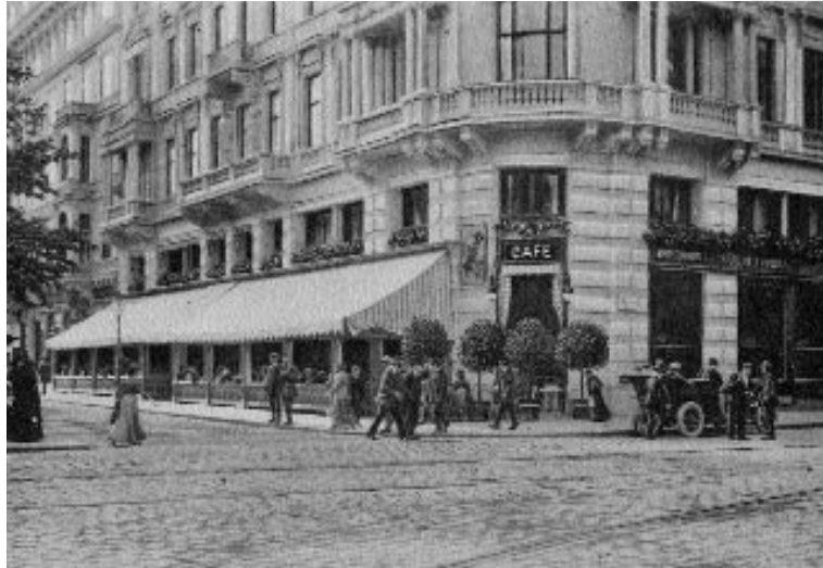
Café in Vienna's Ringstrasse

A unique feature of the 15th International Congress on Archives will be an 'Archives Salon' in the exhibition hall. Hosted by the Editorial Board of Comma , ICA's journal, the Salon will feature comfortable chairs and coffee and will offer a place within the Congress for reflection and discussion between readers and authors of journal articles and other recent ICA publications. It will be like a literary café following in the footsteps of Vienna's famed coffee houses, where legendary authors such as Franz Kafka, Arthur Schnitzler, and Hugo von Hofmannsthal wrote, read, and discussed literary and political ideas.