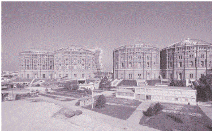
The Gasometer: Residence of Vienna's Municipal and Provincial Archives

In a few months time, over 2000 archival colleagues from around the world will gather in Vienna, Austria, for the the 15th International Congress on Archives in Vienna, Austria, 23-29 August 2004. The Congress features educational sessions, workshops, section and committee meetings, an international exposition of professional products and archival services, tours and special events – including a Viennese wine festival and a ball.