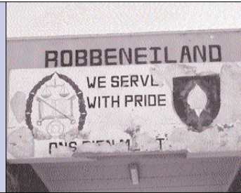
Entrance to Robben Island Prison