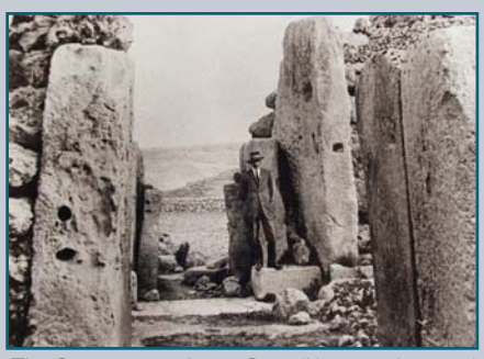
The Ggantija temples in Gozo

Malta is also rich in archival holdings.