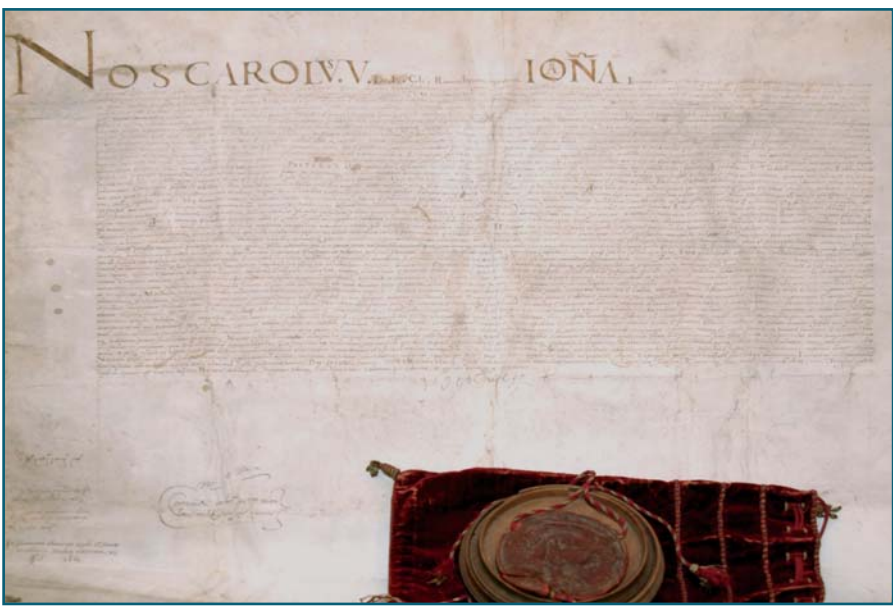
The Donation of Malta to the Knights by Charles V (Courtesy of the National Library, Valletta)

Archives provide the bedrock for our understanding of the past. They show us and future generations. how we came to be what we are as a nation, a community or an individual. They are a hidden national asset and constitute the very essence of our heritage. Malta is rich in archival holdings with Maltese notaries practising their profession and thus creating archival records way back into the 15th century. Archives in Malta are administered under different authorities and governing bodies, depending on whether they are public, ecclesiastical, or private.