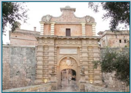
The entrance to the old city of Mdina (JOSEPH AMC

The main holdings date back several centuries. The National Archives hold records going back to (1530*), the Notarial Archives (1465), the National Library (1107), the Public Registry (1863), the Law Courts (1900), Church Archives (c. 15th Century), and Private Archives (1296). In order to bring together archival cultural heritage into a sort of one-stop shop for the general public, the idea of creating a virtual archives started gaining ground. The ultimate aim is to provide the Maltese/European public with easier access to the richness of Maltese archives. To this end the National Archives of Malta is establishing an on-line national register of archives. It is also participating in the APEnet project which aims at developing the European Archives Gateway.