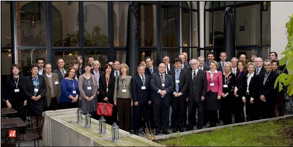
EBNA Brussels, the final photo of all participants.

The EAG (European Archives Group , established in 2005) discussed the following themes: