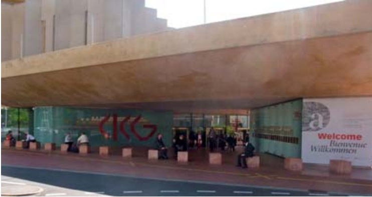
The conference premises in the Geneva congress center

The 8th European Conference on Digital Archiving was held in Geneva from 28-30 April 2010. By emphasizing digital elements and archiving as a function instead of the archive as an institution, it has taken a new approach. Almost 700 people not only from Europe but also from other parts of the world have partaken in the conference.