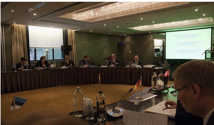
EAG meeting, 19.11.2010

a) Preservation and disaster prevention, b) Reinforcement of European interdisciplinary cooperation on electronic documents and archives: the DLM Forum and the development of MoReq2010, c) Establishment of an internet portal for documents and archives in Europe: APEnet, d) EURONOMOS: European archival legislation online, e) Future challenges – first results of the EAG survey and next steps: The re-use of public sector information; The relationship between onsite and online access to archives; Digital record keeping and the changing role of archives.