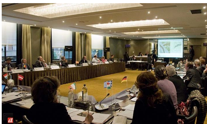
EBNA meeting session

Under the Belgian Presidency of the EU three events were organized this autumn: EBNA meeting (18. - 19.11.2010), EAG meeting (19.11.2010) and the DLM Forum meeting (16.-17.11.2010). EBNA (European Board of National Archivists in the EU) was established in 2001 and since then it meets twice per year, each time organized by the EU Presiding country. The Belgian program of EBNA meeting included the following themes: a) Acquiring business archives and making them accessible for the public: good practices, b) Access to cartographic sources: digitization programs and international collaboration, c) World War I archives and historical research: hype or cornerstone? d) Archives and remembrance education, e) Appraisal and transfer of (de-)classified information. The presentations and photos are available on: http://extranet.arch.be/arch/ebna/ .