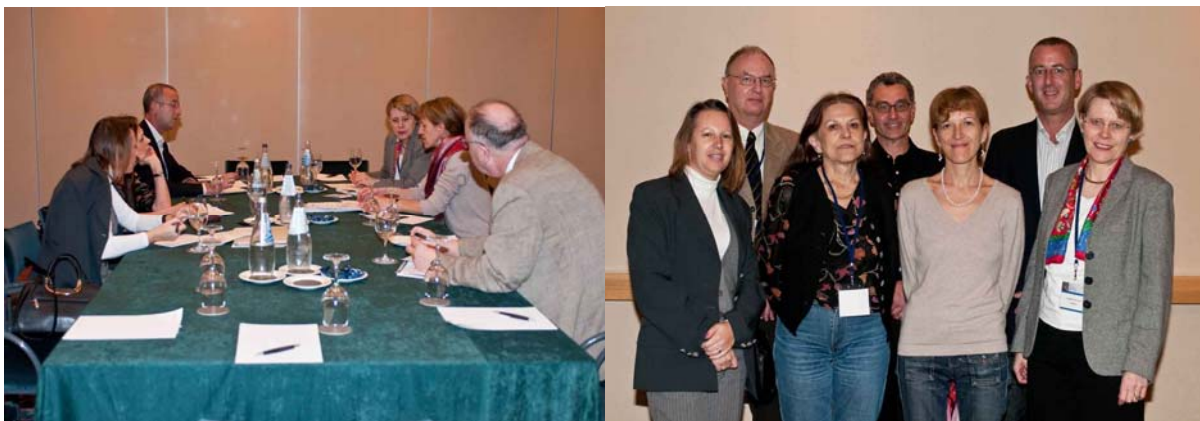
EURBICA Board during its meeting in Malta (November 16, 2009)

EURBICA Executive Board's two meetings in 2009 (in Malta) and 2010 (in Oslo) have resulted in several important decisions. A new statutes of EURBICA was prepared and it was disseminated to all members for discussion and for the possible proposals for its modification. Currently it is also available on ICA web page. In the frame of budget information it is important that EURBICA supported the 8 th European Conference on Digital Archiving in Geneva 2010 (ACE) with the whole regular funds for 2009 and 2010 – since EURBICA was also co-organizer with ICA/SPA.