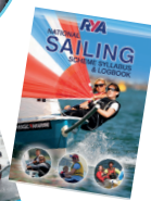
National Sailing Scheme Syllabus & logbook