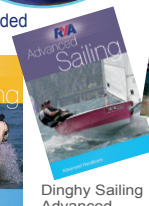
Dinghy Sailing Advanced Handbook