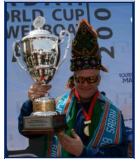
Colin Jelf Formula 2 World Champion & Formula 2 Continental Champion

Formula 2 Continental Cup (Middle East) Champion - Colin Jelf