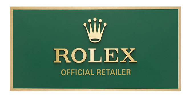
Find your retailer on rolex.com

Only official Rolex retailers, distinguishable by this official green plaque, are allowed to sell and maintain a Rolex. With the necessary skills, technical know-how and special equipment, they guarantee the authenticity of each and every part of your Rolex, not to mention its reliability over time, helping you make the choice that will last a lifetime.