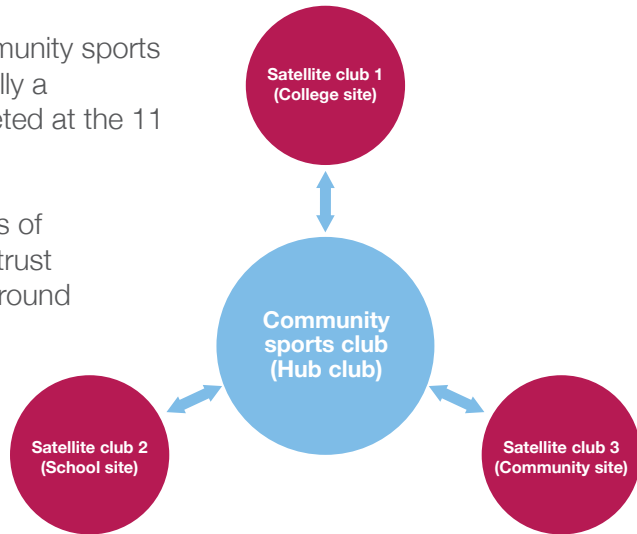
Figure 1: An example of a satellite club model

Satellite clubs are run by sports clubs who bring their expertise and enthusiasm to a place where young people already meet. Coaches and volunteers from or linked to the community hub club work in partnership with the satellite host venue to create a new satellite club.