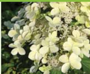
Hydrangea paniculata 'Savill Lace' flowering in the new Hydrangea garden