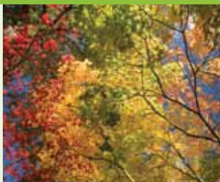
Autumn Wood comes alive with red, orange and golden maple leaves