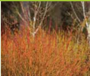
The Winter Garden continuing to delight