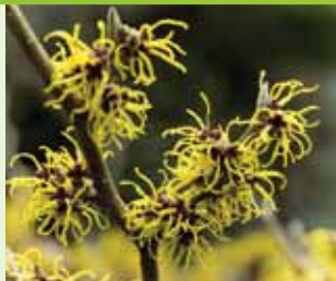
Witch Hazel in beautiful yellows, reds and oranges