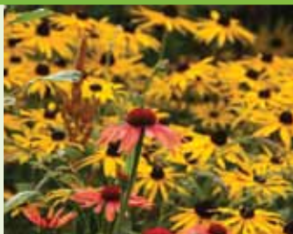
Swathes of vibrant colour along the 100m Herbaceous Borders