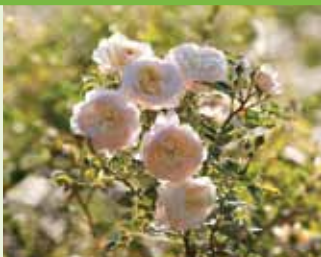
The Rose Garden captivates the senses with over 2500 roses