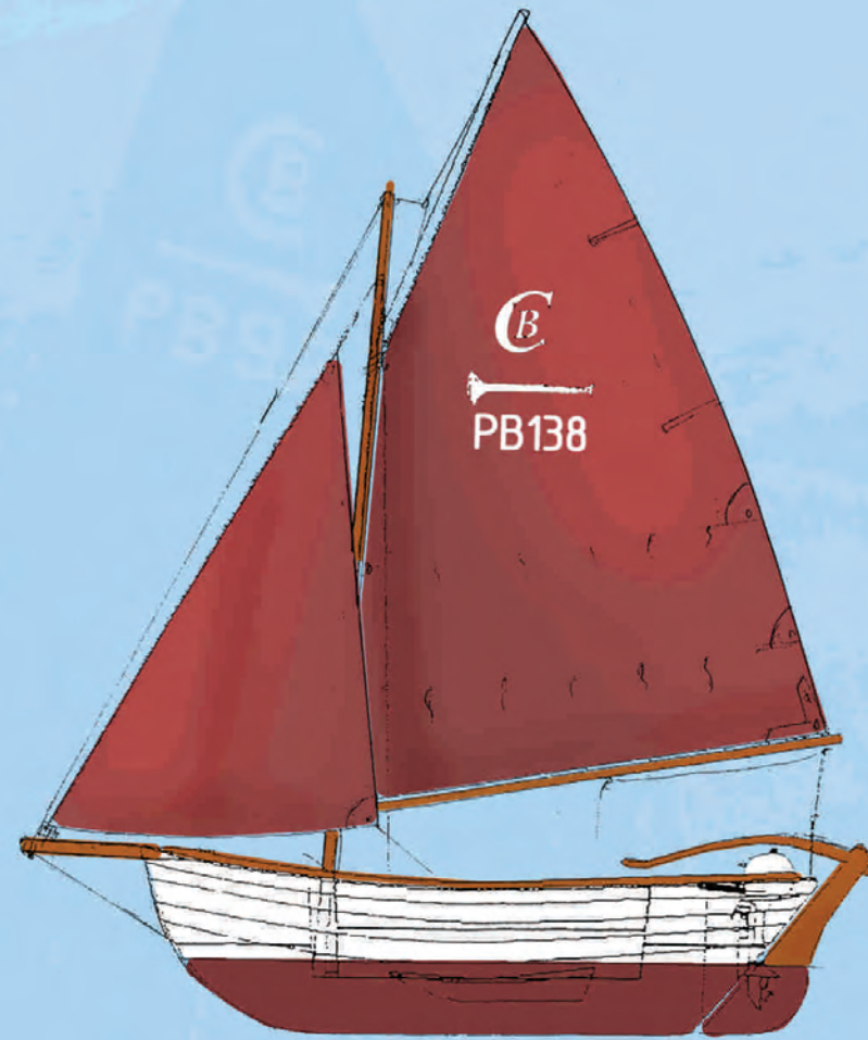
With Gaff Sloop Rig