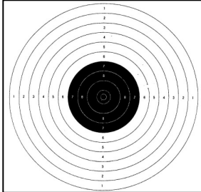
Figure 1 ISSF 10m air pistol target

5.33.4.1. ISSF 10m air pistol targets will be used. They should be of ISSF approved quality.