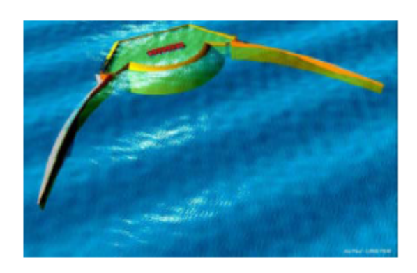
"Wave Dragon" – wave turbine installation- recommended colour above the water is yellow.