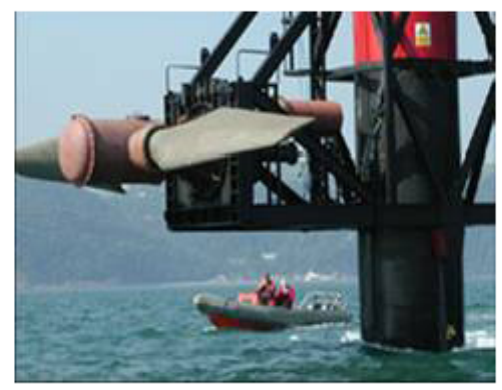
"Seaflow" project – tidal turbine installation. Coloured red and black as isolated danger.