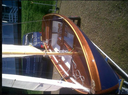
Boat Repairs boat and sail repairs