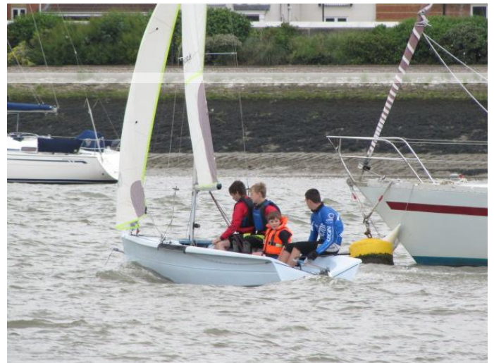
Dave Vettergreen's photographs from this year's open day