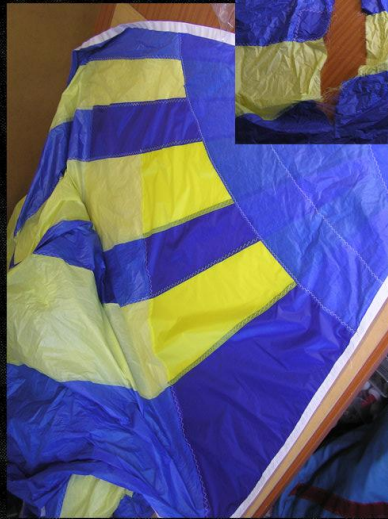
Sail / Sewing Repairs