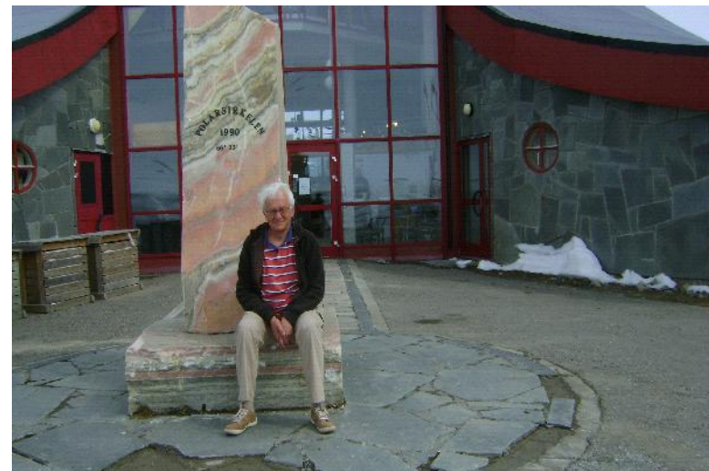
The camera does not lie? ( but in this age of Photoshop who knows? Ed)

We have had some challenging weather early in the summer which may explain the lower numbers sailing – I know that I have chickened out on a few high wind days. We had 19 boats sailing some time in the Spring series but a maximum of only 8 in any single race. I hope to see more of you medium handicappers sailing on a regular basis. Now I am back from my retirement treat to Norway I hope to be there.