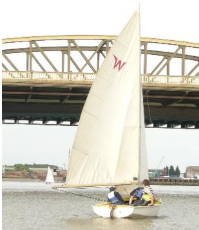
Rochester Bridge 2010

This year we have managed to squeeze into the club's very full programme two cruises both, due to tide, to Aylesford. Probably most of us are more familiar with down river rather than up river but the cruises offer an excellent opportunity to observe the history and landscape that have shaped the area. From the early stages you can see the hill defences for Chatham dockyard, observe the remains of the once busy wharfs between Chatham and Rochester, and watch the dance of castle and cathedral as the meandering river changes your viewpoint before passing safely under Rochester Bridge to enjoy the mix of the rural and industrial views that follow.