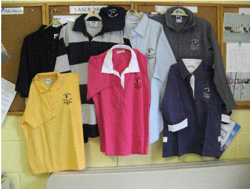
Selection of regalia taken from display cabinet next to fire escape.

A selection of club regalia can be seen in the saloon of the club house along with a current price list.