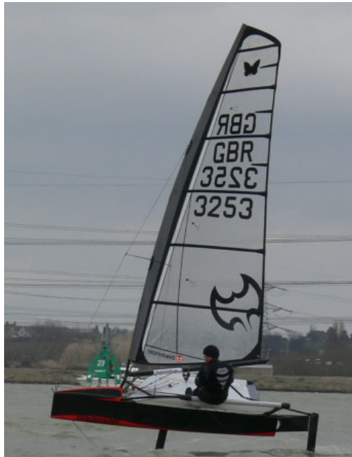
Now this WAS fast— 2010 Freezer