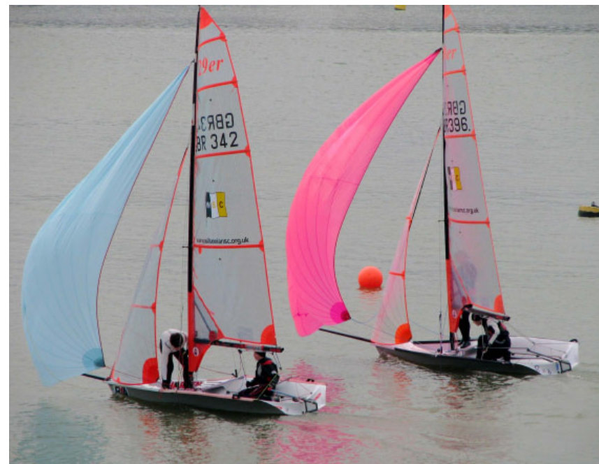
29er action — 2009 Warm up race