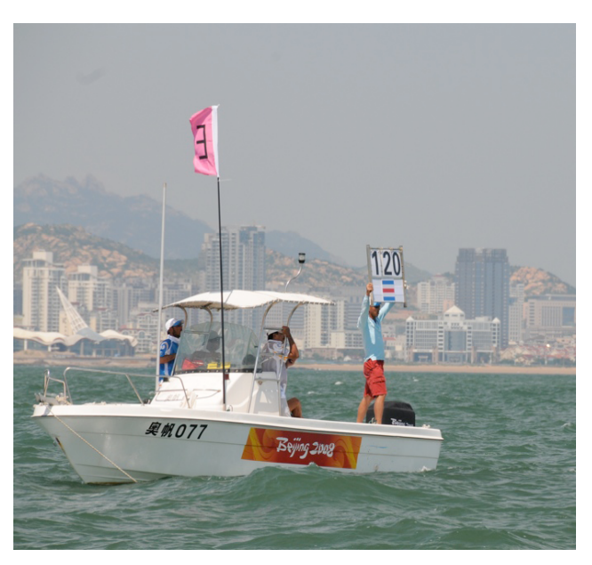
Mark Change Signal Boat

Again, your qualification remains intact so attendance is a very positive step to take and will ensure that our customers, the sailors, get real value for their entry fee.