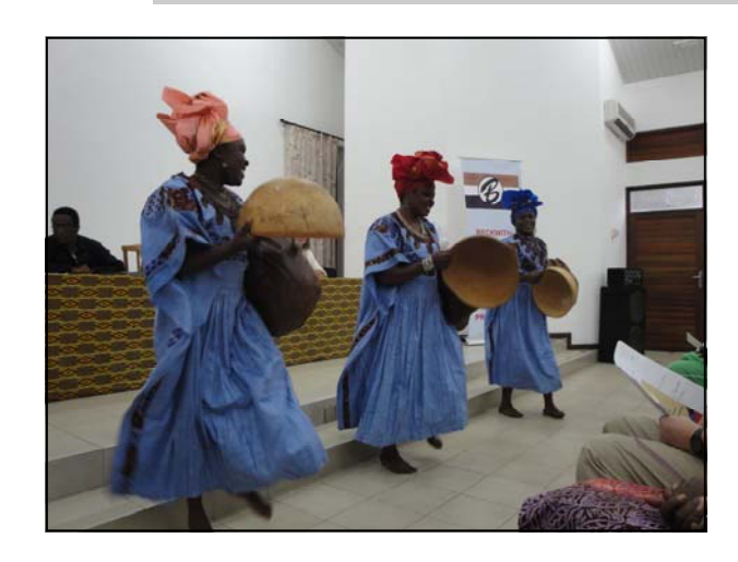
Dancers at the opening cerremony.