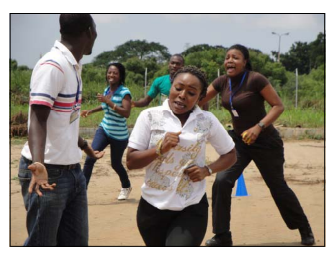
Young Leaders Training Event