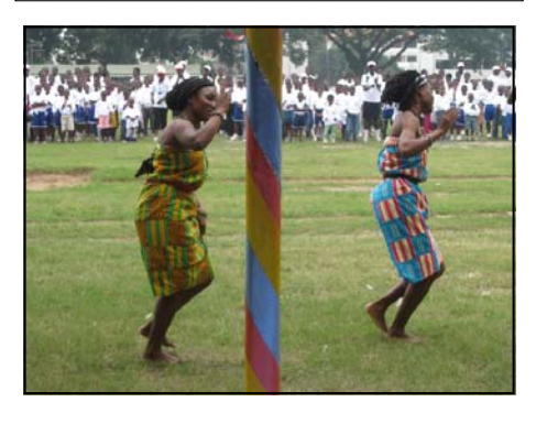
Dancers at the Opening Ceremony of the BILD Ghana Project in August 2010.