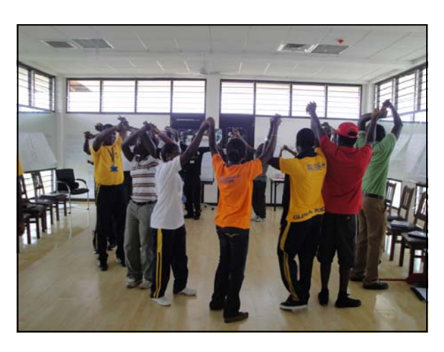
Young Leaders Training Event—group bonding.