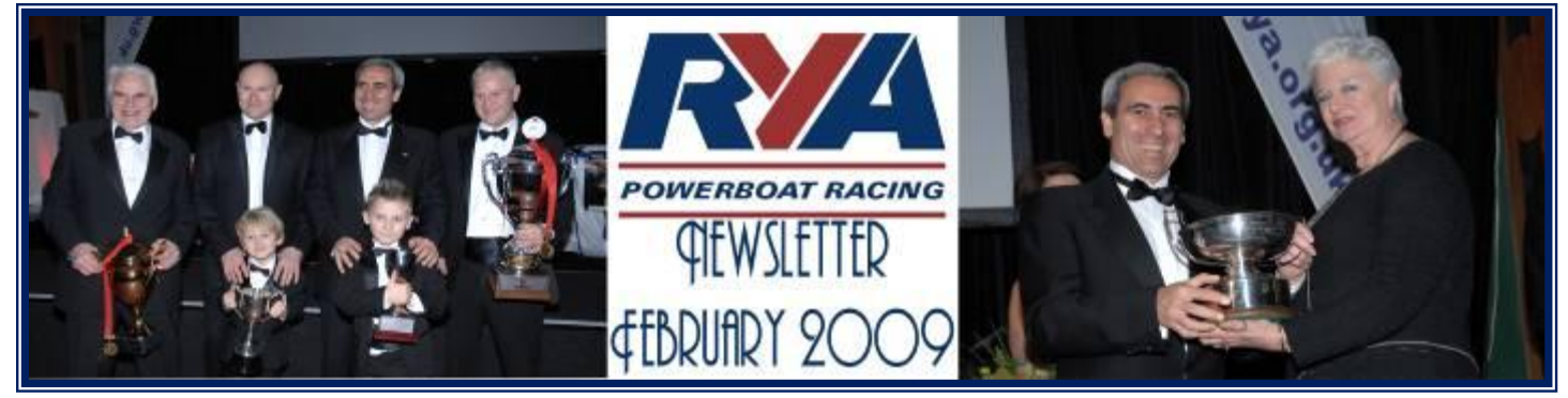
THIS NEWSLETTER IS DEDICATED TO ALL RACING OFFICIALS AND COMPETITORS – YOU MUST READ THIS CAREFULLY AS THERE ARE SOME IMPORTANT CHANGES

As we head toward the beginning of the 2009 season, The champions of UK powerboat racing headed to Bournemouth for the 2008 RYA Powerboat Racing Awards Ceremony.