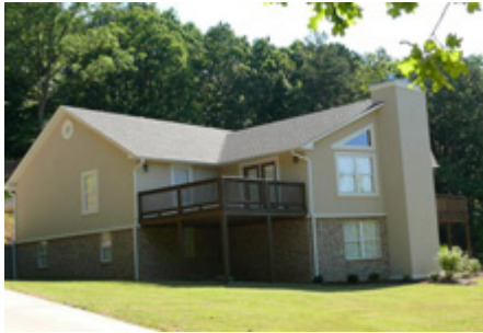
The Prophet's Chamber

With families in mind, we want to provide your family a place to get out of the "fishbowl" and reconnect with each other. We have a list of family movies that will encourage conversation with the kids. Come relax and refresh.