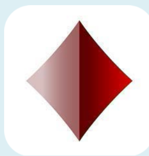
Brain Function Test