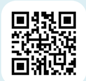
Wallet Card Key Tag