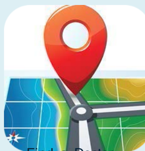
Find a Doctor