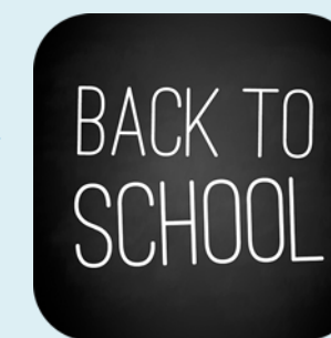
Back → To → School