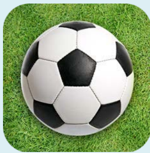
Back → To → Exercise