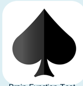
Brain Function Test