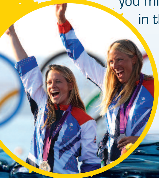
▲ Hannah Mills and Saskia Clark Olympic Silver Medal Winners 2012

Hannah Mills 470 Helmswoman 2012 Olympics