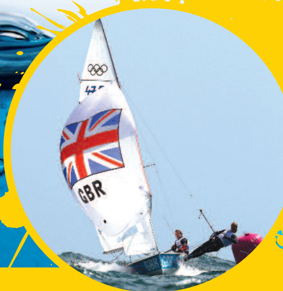
2012 Olympic 470 Silver medallists travelling flat out ▶