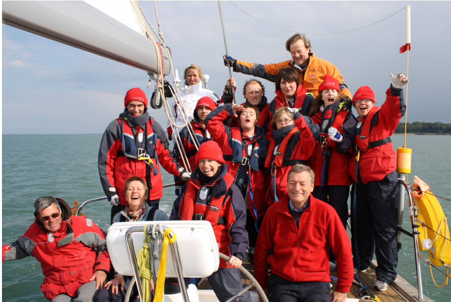
Welcome Hill Schools voyage

To date, Team Torbellino have raised over £10,000 which funds sailing adventures for young people. They have teamed up with Midlands based Welcome Hills School, and in May 2010 organised two voyages around the Solent. A total of 15 special needs students from the school were given the opportunity of a lifetime to experience offshore sailing.