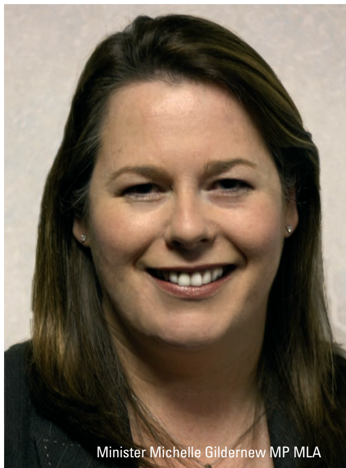
Minister Michelle Gildernew MP MLA

I am clear that we also need a strong science evidence base to support these developments, to inform our understanding of the state of our seas and to assess the impacts that the increasing demands on marine resources can have. This includes acquiring a greater understanding of the processes that underpin sustainability of ecosystems. In particular, the Marine Framework Strategy Directive requires that we manage the whole marine environment through adopting ecosystem based approaches. This increased emphasis on managing with regard to ecosystem structure and function also provides an opportunity to better understand and plan for impacts of climate change on marine ecosystems.