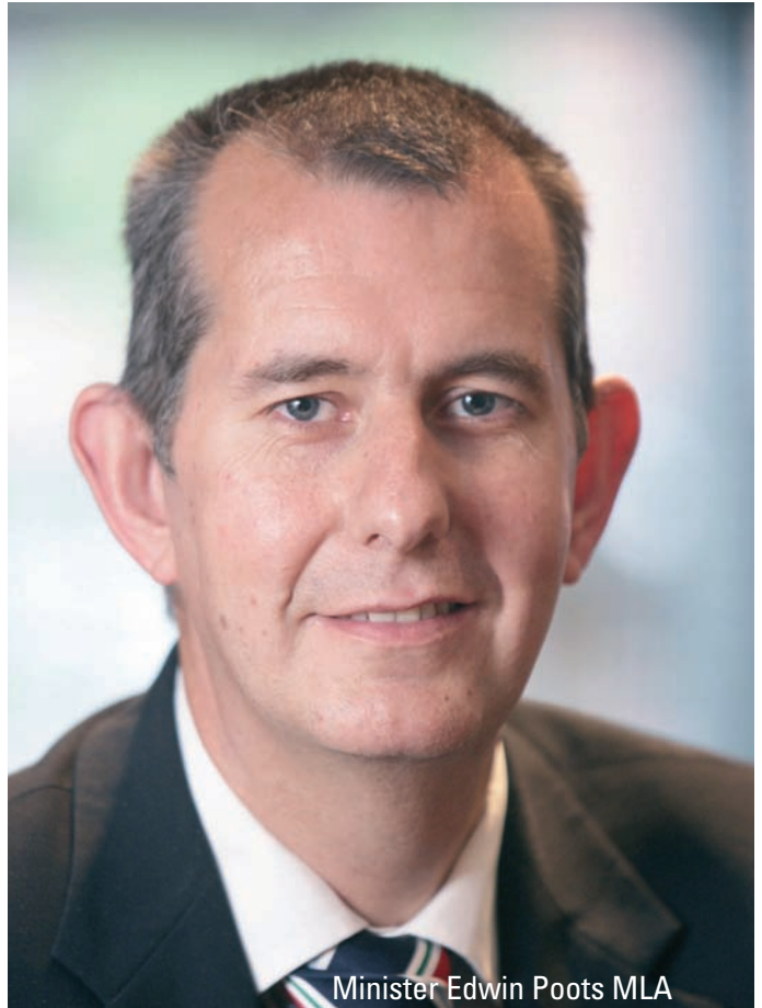
Minister Edwin Poots MLA

This is the first time a report of this nature has been produced in Northern Ireland and