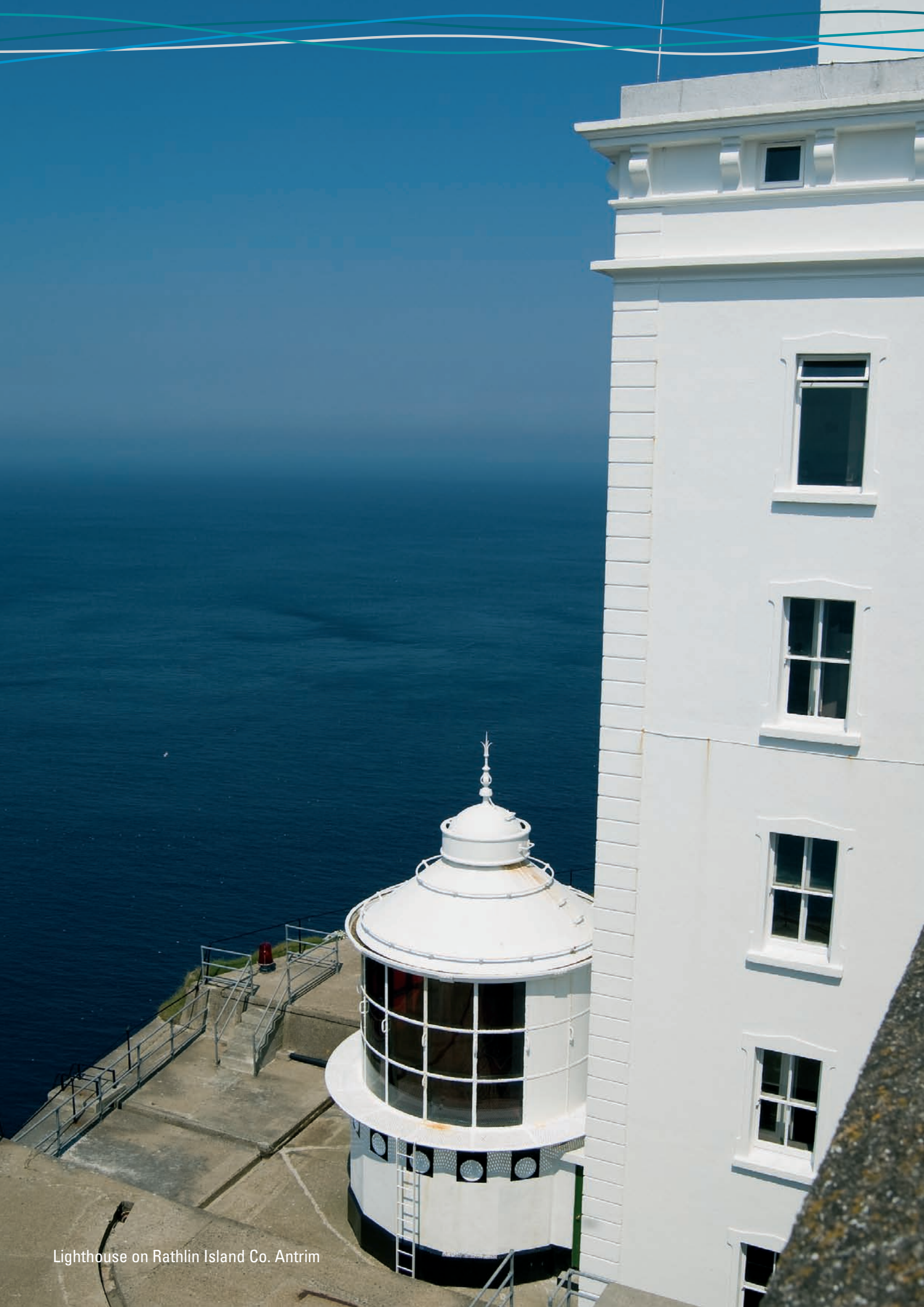
Lighthouse on Rathlin Island Co. Antrim