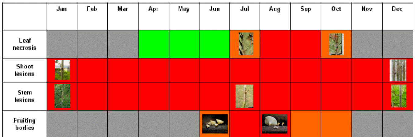
Figure 2. Schematic diagram of when symptoms are visible

Ash dieback is caused by the Ascomycete pathogen Chalara fraxinea (perfect stage Hymenoscyphus pseudoalbidus ); for convenience it is referred to as C. fraxinea here. The hypothetical life cycle (Gross et al. , 2012, Figure 1) is based on the most recent scientific understanding of the pathogen, but this is developing all the time. The schematic diagram (Figure 2) shows when the various stages of the life cycle are believed to occur; it must be emphasised that this is extrapolated from what is known about the behaviour of ash dieback in other countries (mainly the Nordic countries and Eastern Europe).