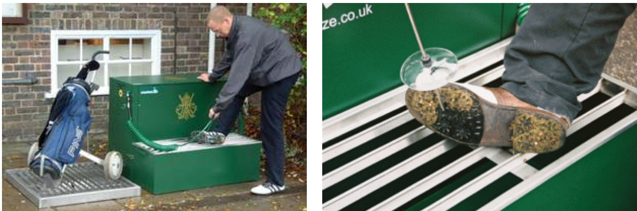
Figure 4. Typical air blower for cleaning shoes and equipment. Air jets transfer soil and plant material from shoes etc. into a collection bin for subsequent removal and disposal.

There are many models available and most are electrically powered. They are generally low maintenance but are probably only suited to staffed sites and should be positioned beside permanent buildings where public and staff could use the facility on footwear or bicycles etc.