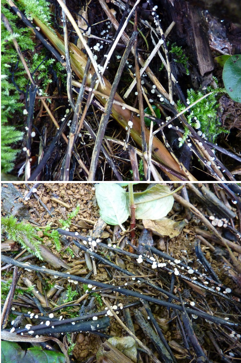
Figure 4. Apothecia of Hymenoscyphus pseudoalbidus ( Chalara fraxinea ) on infected ash petioles. Note the blackened appearance of the infected petioles, which contrasts with the pale colour of uninfected ones.

stalks) and, during the summer months, by the presence of apothecia (1.5 – 3 mm), as shown in Figure 4. In addition, while not proven, it is possible that C. fraxinea might be spread during the process of sample collection if healthy trees were sampled after infected ones.