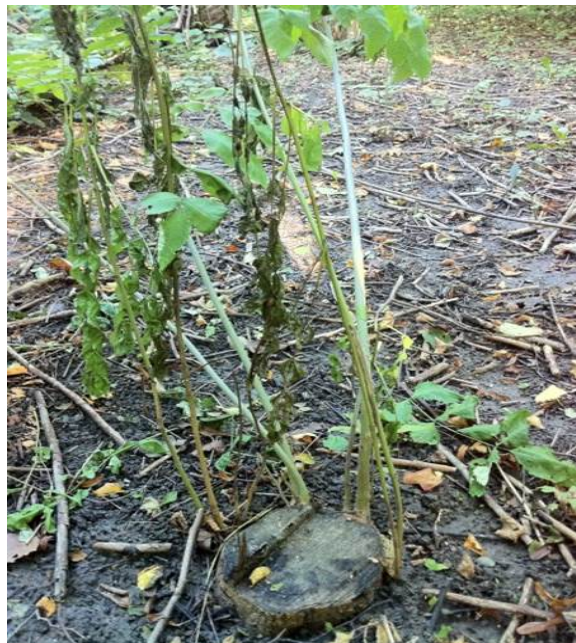
Figure 3. Shoots developing from a cut ash stump from a felled tree with ash dieback showing symptoms of infection by Chalara fraxinea (wilting).