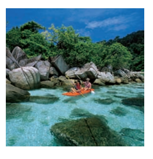
Breathtaking Locations Experienced Staff