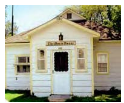
The Marie House

ADDRESS: 202 Broadway, Naponee, NE 68960