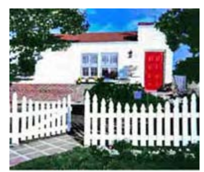
The Cottage on Coronado Island

Amenities include : Breakfast, afternoon hors d'oeuvres, hairdryer, bathrobes, iron & ironing board, CD/Tape player, piano, extensive library, DVD player, wide screen TV, internet access, and complimentary concierge services. Outside: Seating throughout the property, horse shoes, and a fire pit. For a fee we can provide an airport shuttle.