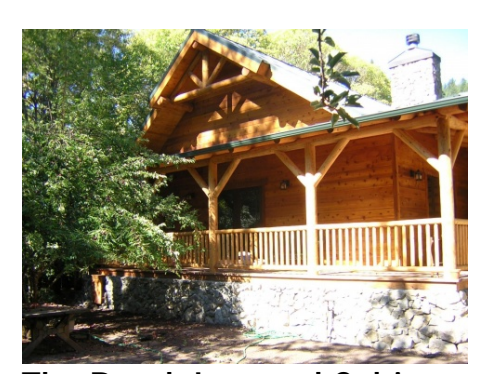
The Brook Lomond Cabin

An outreach of the Southern California District, Pinecrest is a year-round facility addressing the needs of our ministerial families. Pinecrest has three large two-story Alpine lodges. The lodges have individual rooms that contain one queen bed and three single beds in a bunk bed configuration.