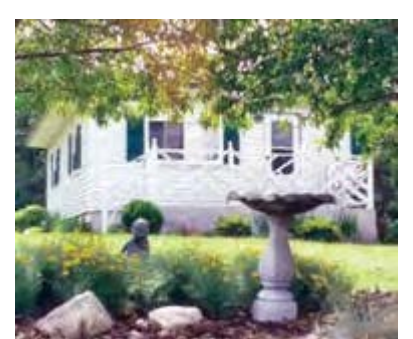
Bethany House Ministries (Meadows of Dan, Virginia)

CONTACT ADDRESS: P.O. Box 14853, Greensboro, NC 27415