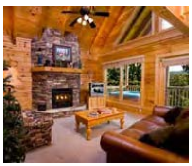
Cozy Bear Cabins

<u>www.tripadvisor.com/Hotel_Review-g55184-d2100740-Reviews-Chilhowee_Mountain_Retreat-Maryville_Tennessee.htmltripadvisor.com</u>; and Google Maps where you enter 865-983-8511.