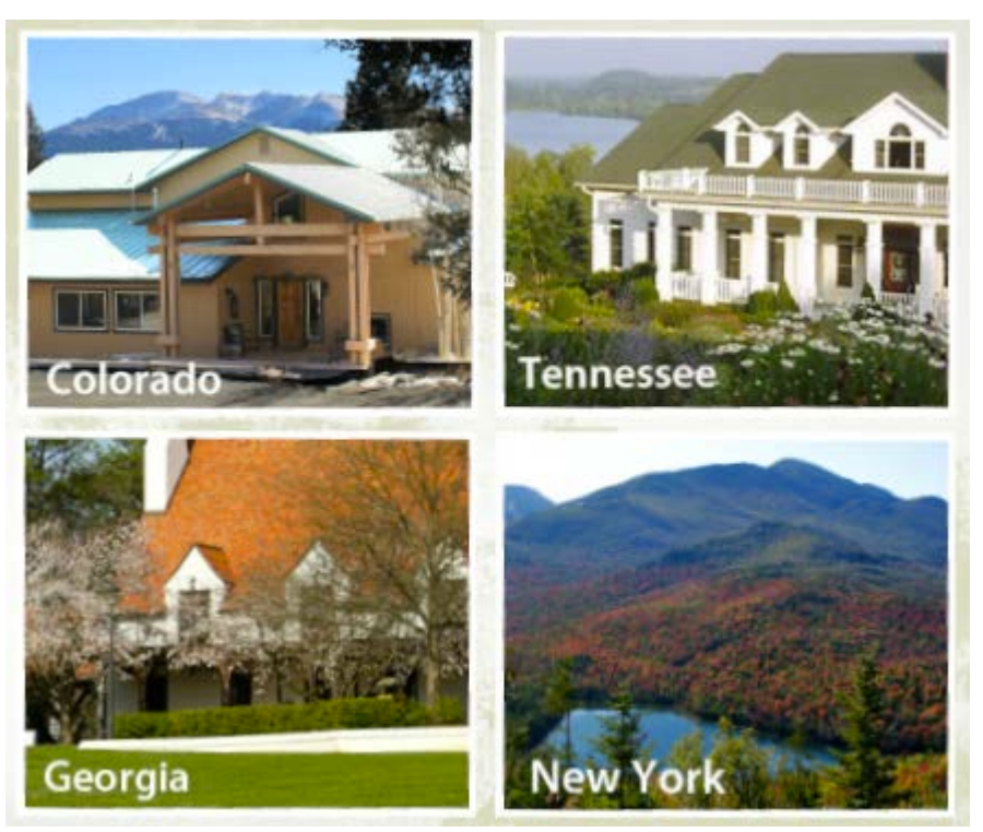
SonScape Retreats Retreats in Colorado and Tennessee Off-sites in Upstate New York and Georgia