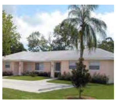
D&D Missionary Homes, Inc.

Beside Still Waters is a program that wishes to bless Gods servants from all areas of the globe, by providing a place of rest and refocus. This program is not provided to give a free vacation. It is intended for those who are in spiritual need of refreshment in the Lord and who are seeking God's direction. We define a servant as an experienced pastor, minister, missionary, bishop, priest or rabbi, etc. (Applicant must have three years or more of full-time service in good standing.) We are not open to church staff or support staff. The townhouses we provide are located on Anna Maria Island, Florida, approximately one block from the beach. Application is located on our blog along with current availability. The program costs range from $150 - $250. At this time, maximum stay is 10 days (January-August), or 14 days (September-December). Program not open to groups. Children are welcome. Maximum number of guests is 6 per unit. One unit per booking. We can no longer do two units for more than 6 guests. Please note: 501(c)3 IRS (aka: US Treasury) paperwork for your church is required. This is not your state tax exempt documentation. Please see website for more information on the program requirements.