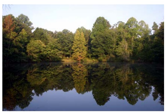
Healing Springs Retreat Center

ADDRESS: 83 College Heights Rd, PO Box 153, Franklin Springs, GA 30639