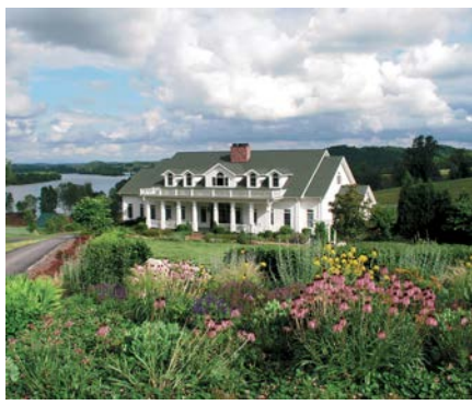
Whitestone Country Inn

Fairhaven Ministries is located in the beautiful Blue Ridge Mountains of Tennessee. Within easy driving distance are many activities—hiking, white-water rafting, horseback riding, swimming and boating, world famous Rhododendron gardens, antique shopping, and sightseeing. Please visit our website for more information.