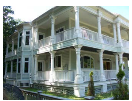
His High Places, Inc.