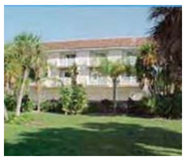
Beside Still Waters

ADDRESS: Taylor Family Foundation, Inc., 1111 9th Ave W, Suite E, Bradenton, FL 34205