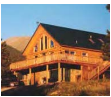
Shining Mountain Ranch

Private vacation homes on a ranch in Colorado are provided free of charge to full-time, evangelical Christian pastors and missionaries, and their families.