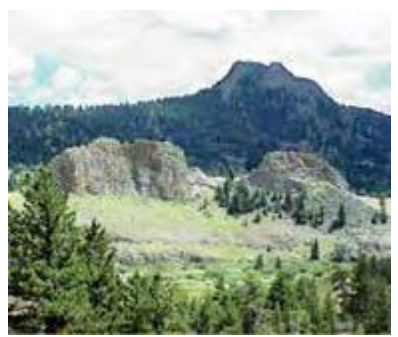
CrossRoads Counseling of the Rockies

ADDRESS: PO Box 4767, Buena Vista, CO 81211