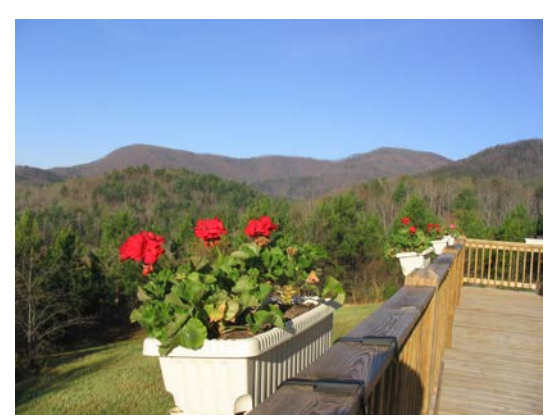
Shepherd's Refuge – Selah Ministries

Restoration Road is for those in Christian service who have need of renewal, strength, and encouragement. Nestled in the mountains of Georgia and surrounded by God's own creation, Restoration Road provides an atmosphere where you can experience afresh His wonderful presence. Take long walks in the woods, or sit on the porch and enjoy the country air and the music of the quiet nights. Visit the quaint towns and have fun in their shops. Above all, bask in God's love for you and be restored. Our three cottages are completely furnished and equipped with a full kitchen and laundry. Children love to roam our safe, 12-acre campus.