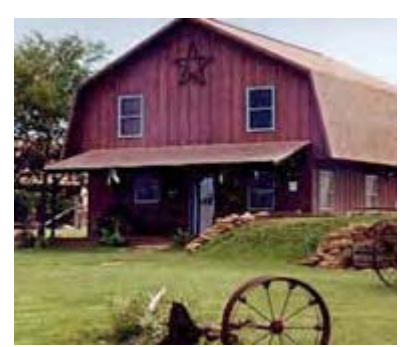
Buffalo Ridge Hospitality & Retreat Center

MAILING ADDRESS: PO Box 400, Ottawa, KS 66067