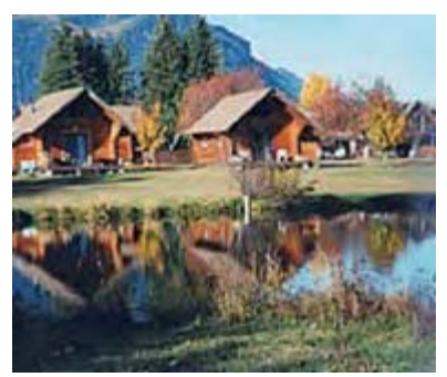
Diamond T Ranch