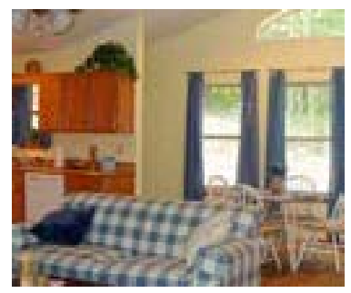
Brook at Bethpage

Anchor Retreat has fully-furnished two- and three-bedroom homes plus a one-bedroom apartment. Located on Table Rock Lake, 25 minutes from Branson, Missouri, and about 35 minutes from Eureka Springs, Arkansas and the great Passion Play. No pets please.