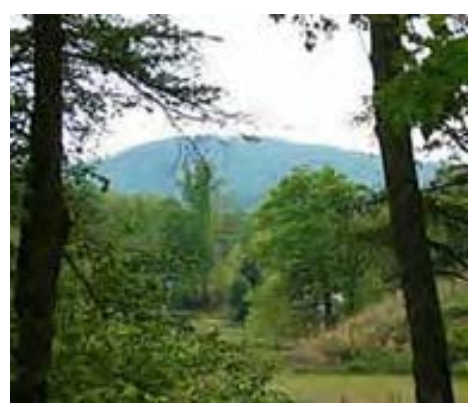
The Father's Heart Ministry

ADDRESS: 58 Misty Ln, Cleveland, GA 30528 (90 min north of Atlanta airport)