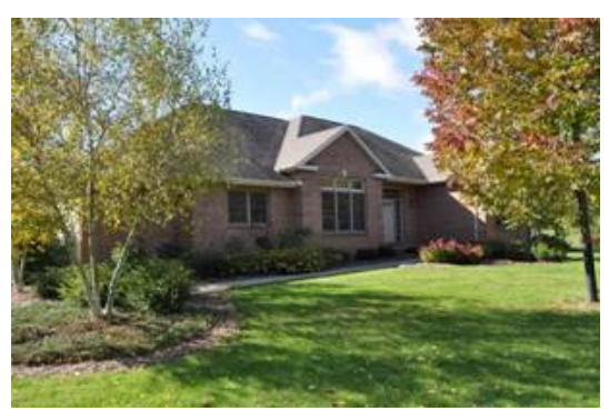
Deer Ridge Ministries

MAILING ADDRESS: 401 Meadows Street, Polo, IL 61064. Retreat Location: Freeport, IL