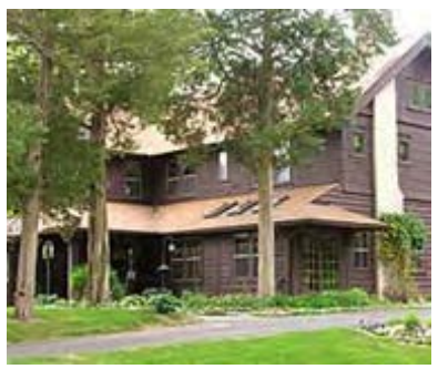
Pastors Retreat Network

ADDRESS: PO Box 180455, Delafield, WI 53018