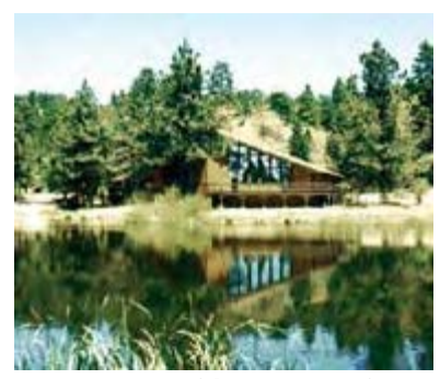
Pinecrest Christian Conference Center

Missionaries to Ministers is a ministry aimed at helping the minister and his or her family in the areas of pornography, sexual addiction, boundaries, and relational issues. We help to create a restoration process that is productive, lasting, and fruitful and speak from our own experiences and recovery. Individual and couple's counseling is provided in person, via phone, or virtual (iChat, Skype) sessions. M2M is available to educate pastors and churches on these very important and relevant issues.