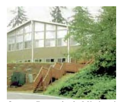
Camp Berachah Ministries

ADDRESS: 19830 SE 328th Place, Auburn, WA 98092