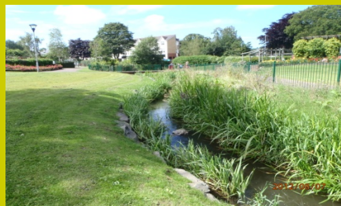
Improvements made further downstream of the culvert to deal with siltation problems