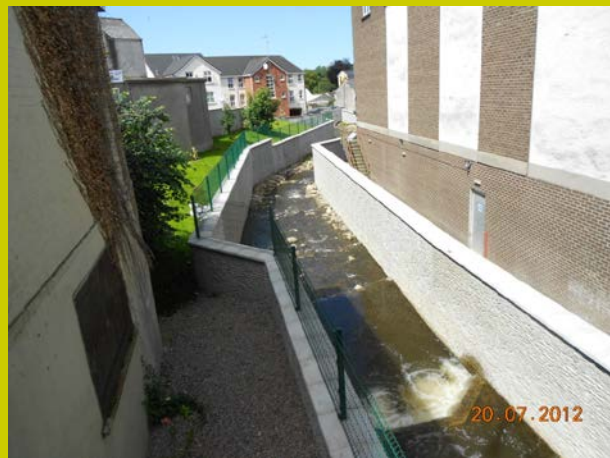
After scheme was completed

Further downstream there was a small artificial lake which was subject to siltation problems and required regular maintenance. The river was re-profiled and the lake removed. This should address the siltation issue and also improve fish passage.