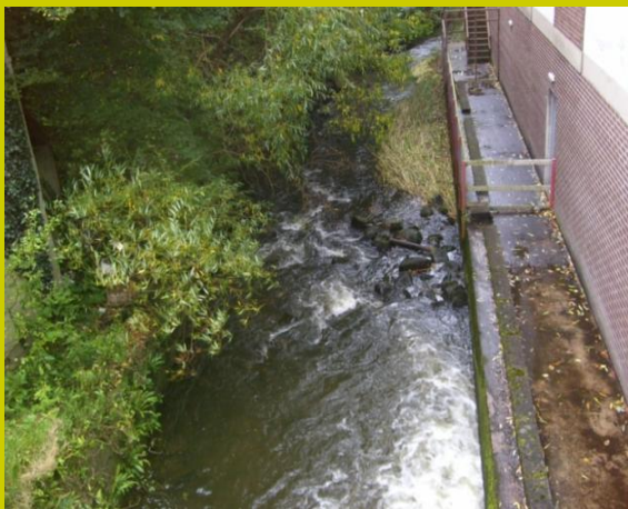
Before scheme commenced

The Lodge Burn was prone to flooding on the lower reaches in Coleraine. The photo below to the left is the view from the outlet of a large culvert before the scheme commenced. The water depth was low and there was a steep climb for fish up a concrete apron before they could approach the culvert. This was addressed by a series of small pools leading up to the culvert which was enhanced to improve the conditions for fish passage. Flood walls were built along the banks to reduce the level of flood risk to adjacent properties. The overall cost for the flood alleviation scheme including enhancements and fish passage work was just over £2 million. The fish passage work was approximately £80,000.