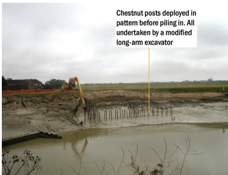
Monk Bretton site near bridge: Installation of posts for fascines