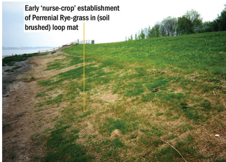
Gabion mattresses installed in SSSI bank: Early colonisation at high tidal levels