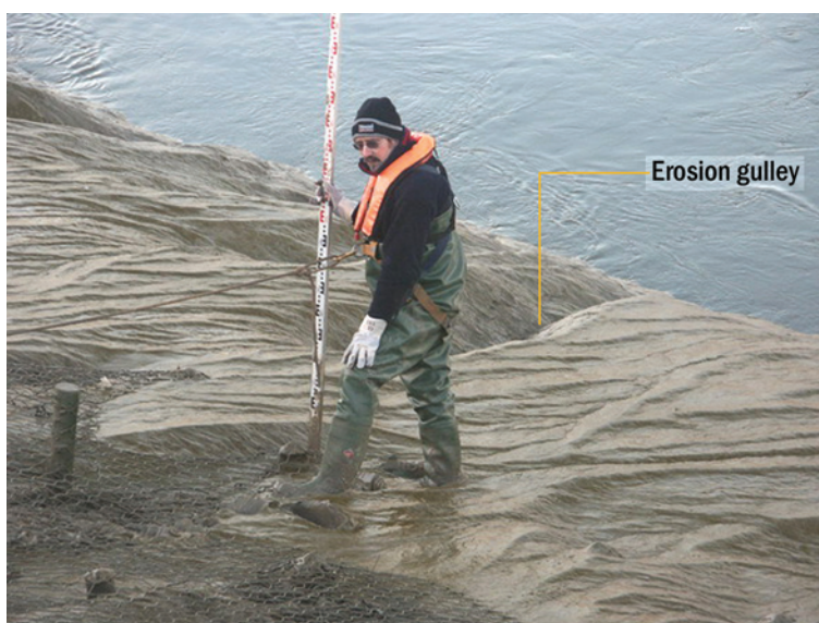
Monk Bretton site near bridge: Rocknet and fascine detail showing drainage pattern