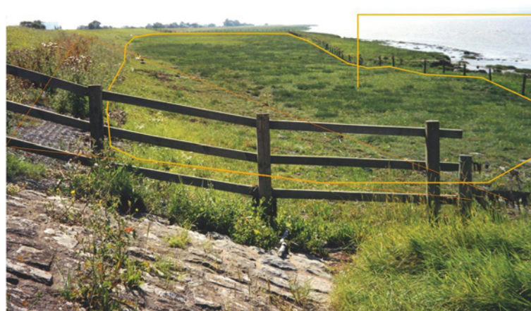
Gabion mattresses installed in SSSI bank with full successful colonisation by species characteristic of the SSSI