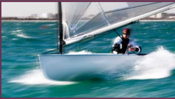
DINGHY ACADEMY INITIATIVE