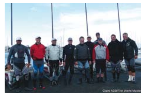
The top 10 getting ready for the medal race