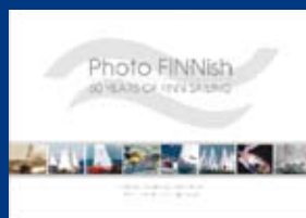
Photo FINNish - 60 Years of Finn Sailing Softback - £25 plus p&p worldwide Hardback - £65 plus p&p worldwide

IFA tie: £18 IFA pin: £6.50 IFA cufflinks: £12 all incl p&p worldwide