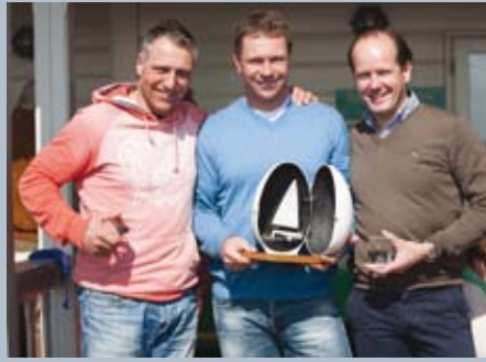
Top three at the Easter Regatta