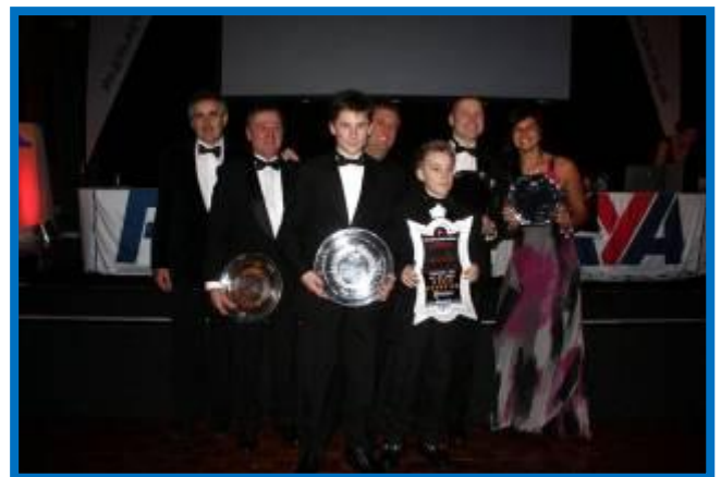
The Jetskiers show off all their silverware before hitting the dance floor