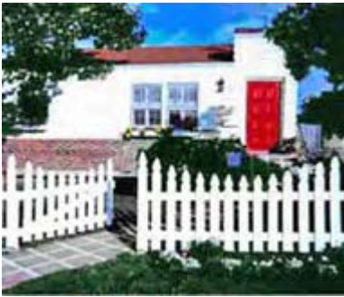
The Cottage on Coronado Island

Amenities include: Breakfast, afternoon hors d'oeuvres, hairdryer, bathrobes, iron & ironing board, CD/Tape player, piano, extensive library, DVD player, wide screen TV, internet access, and complimentary concierge services. Outside: Seating throughout the property, horse shoes, and a fire pit. For a fee we can provide an airport shuttle.