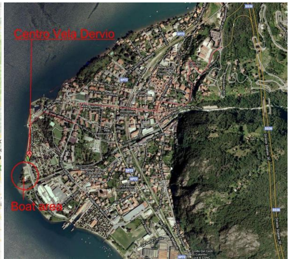
The city and the club.

From Milano, take the Superstrada (Motorway) Milano – Lecco SS36.