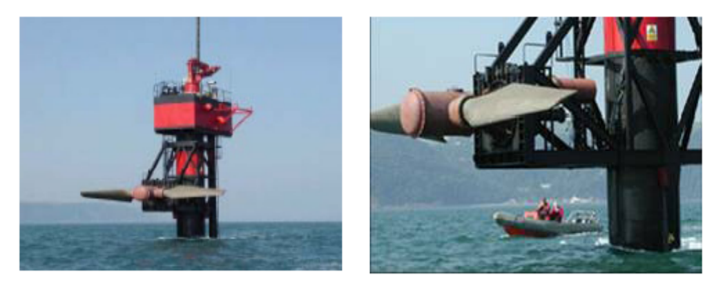
"Seaflow" project – tidal turbine installation. Coloured red and black as isolated danger.