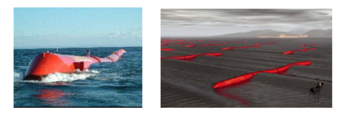
Pelamis Ocean Power Delivery (wave turbine installation) – Recommended colour above the waterline is yellow.