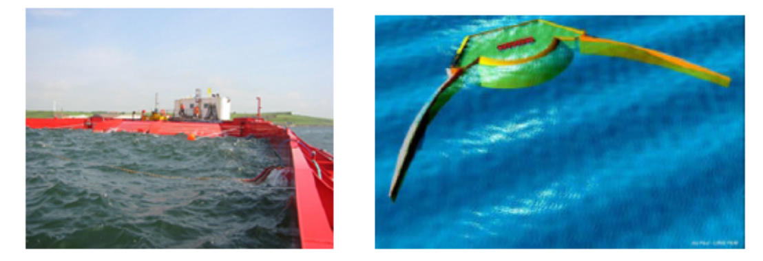
"Wave Dragon" – wave turbine installation- recommended colour above the water is yellow.