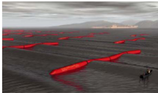
Pelamis Ocean Power Delivery (wave turbine installation) – Recommended colour above the waterline is yellow.