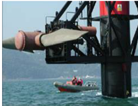
“Seaflow” project – tidal turbine installation. Coloured red and black as isolated danger.