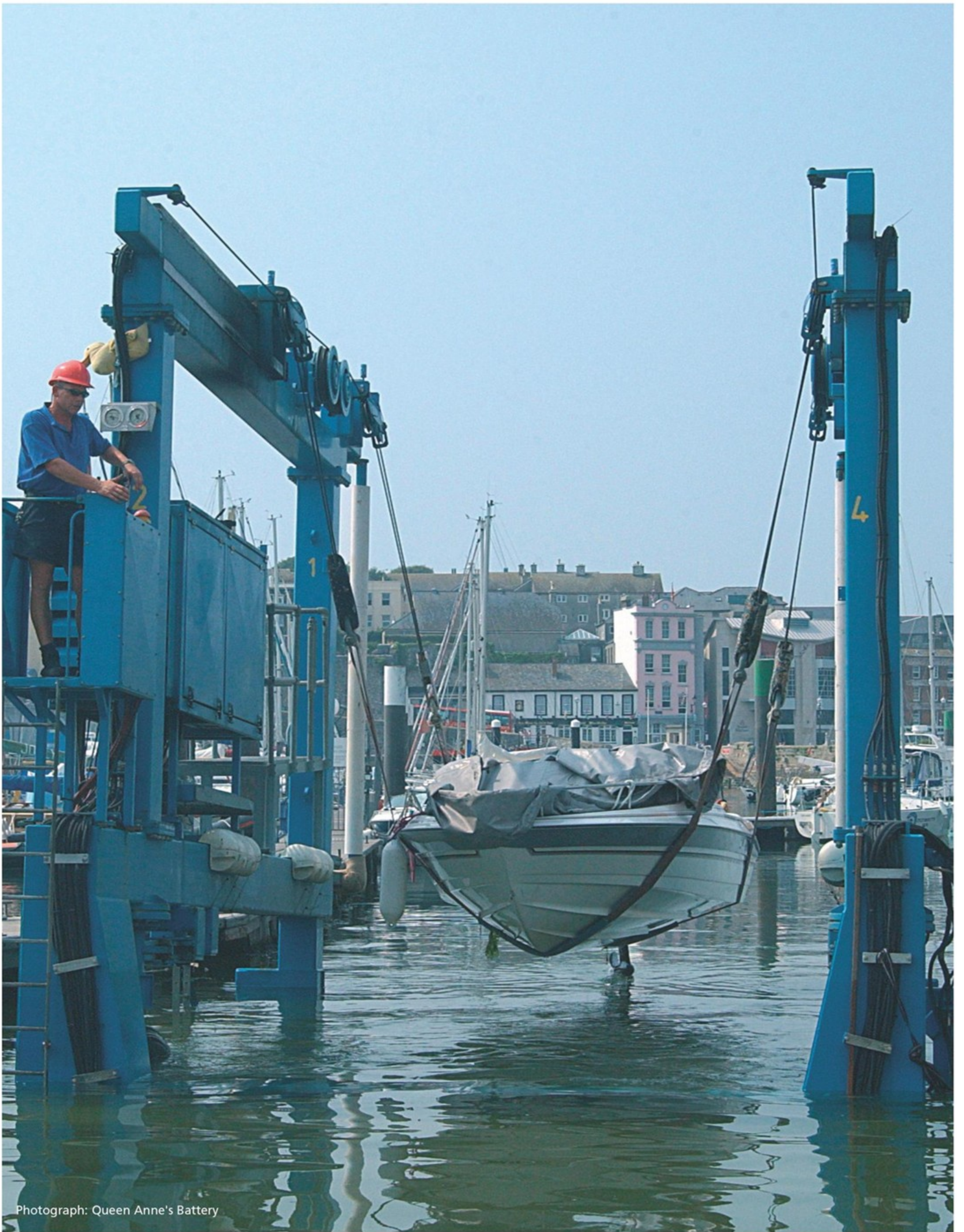
Photograph: Queen Anne's Battery