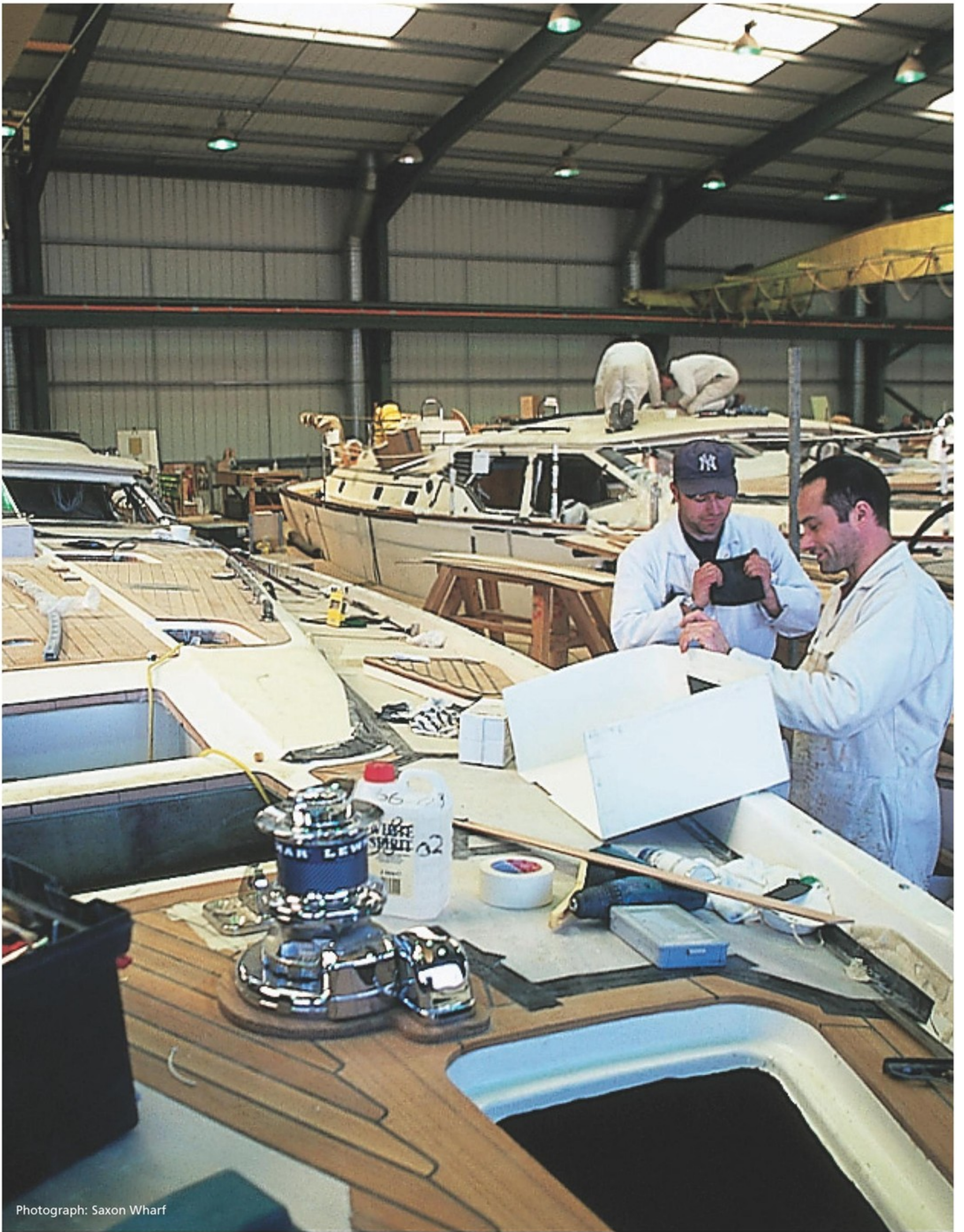
Photograph: Saxon Wharf