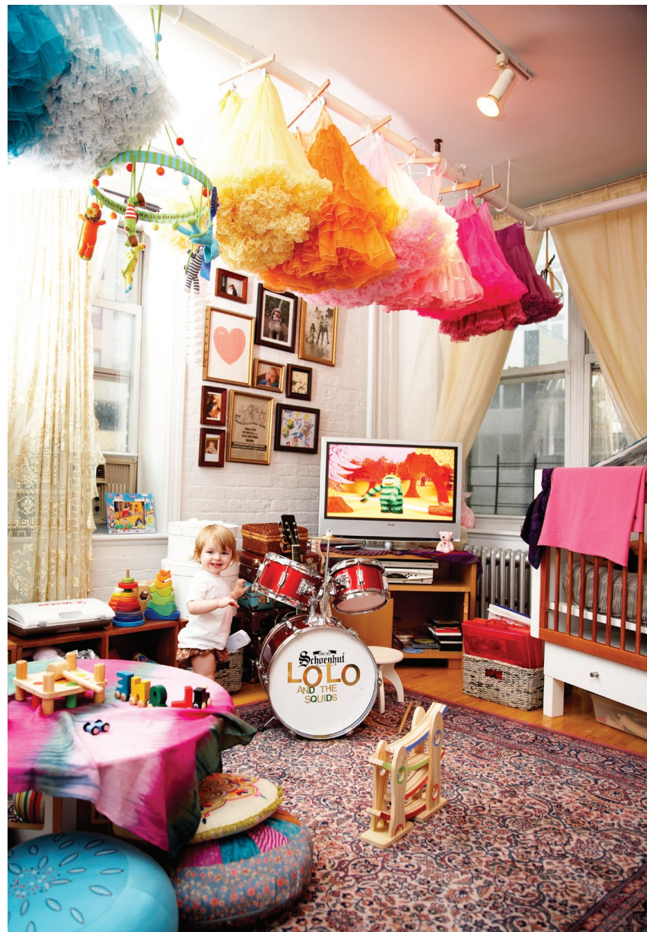
LOWE HUTSON'S COLORFUL BEDROOM.