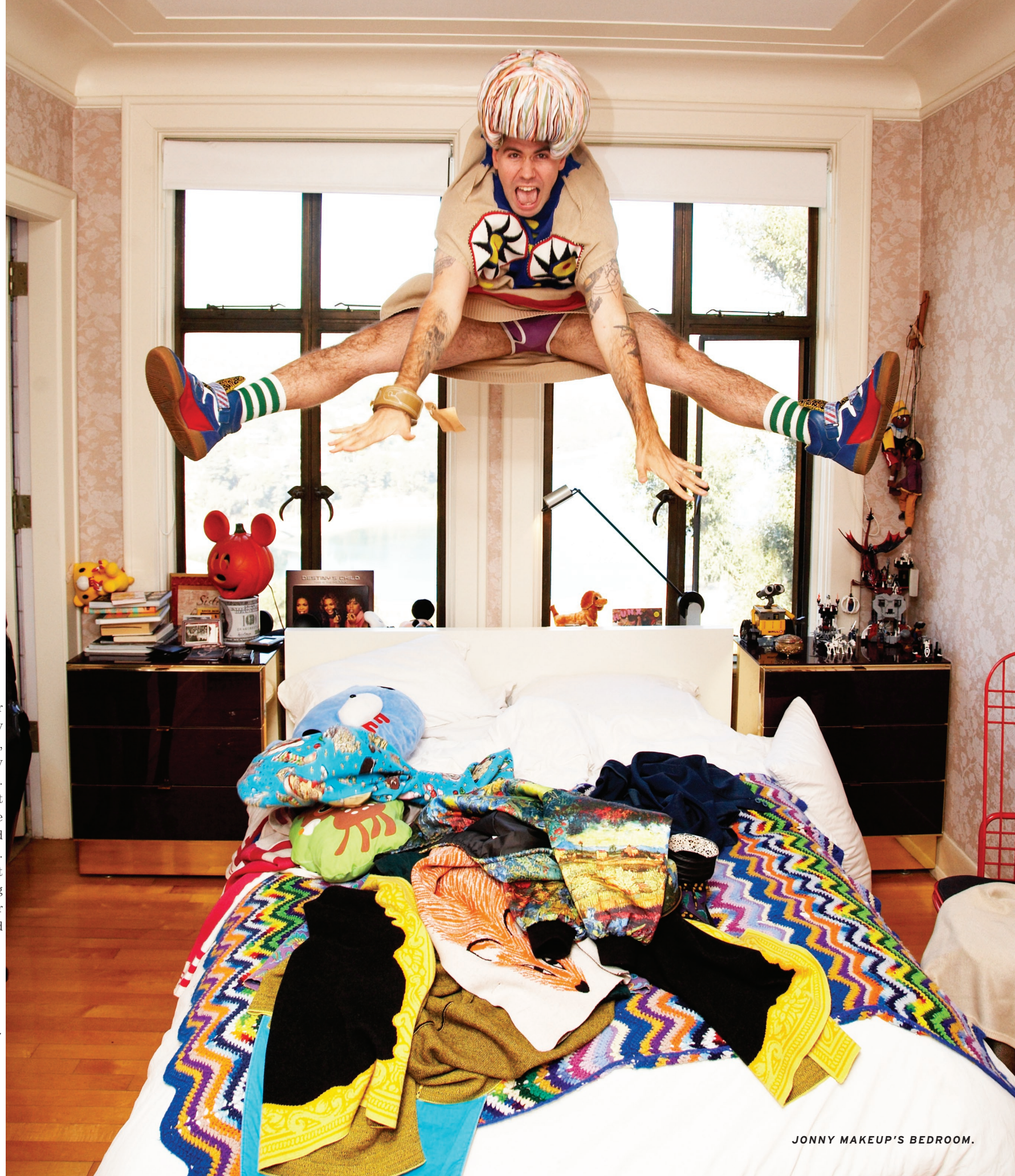
JONNY MAKEUP'S BEDROOM.