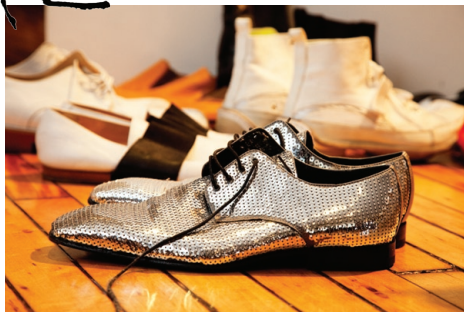
MICHAEL STIPE'S SPARKLY SHOES.