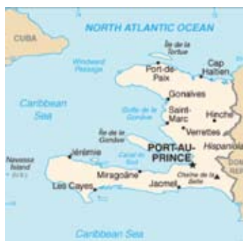
Port-au-Prince and surrounding areas in Haiti where Oxfam works.