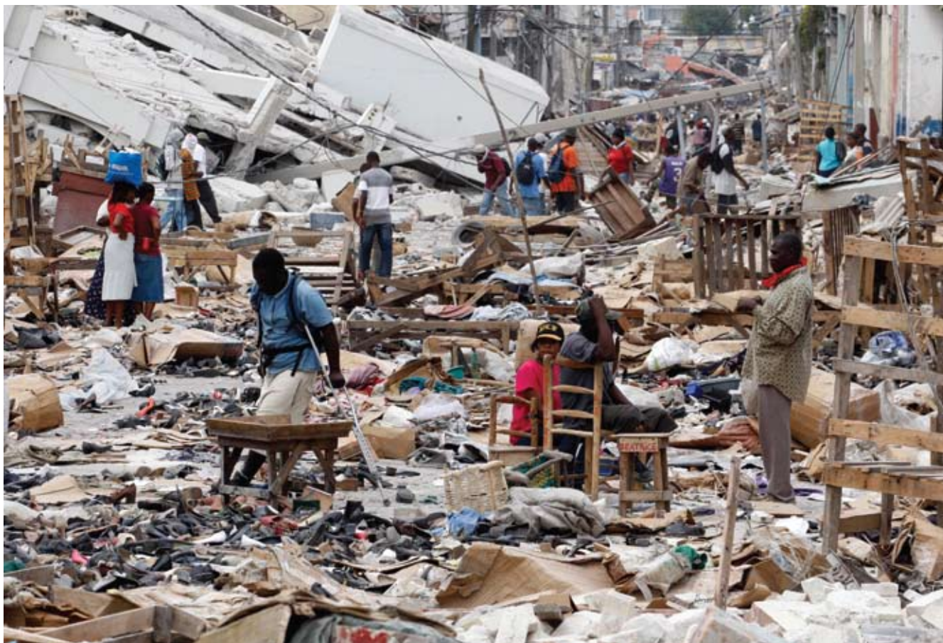
Residents of Port-au-Prince find a path through fallen buildings that used to be their city streets.

The Haiti earthquake will go down in history as one of the most devastating natural disasters of our time. The challenges of operating in the ruins of a cramped city, with accumulated rubble and massively damaged infrastructure have been almost insurmountable. But I am proud to say that Oxfam and other agencies have risen to this challenge. We have adapted tried-and-tested approaches in new areas and, together with our partner organizations and Haitian staff, have found strength in our ability to tackle obstacles and come up with creative solutions.