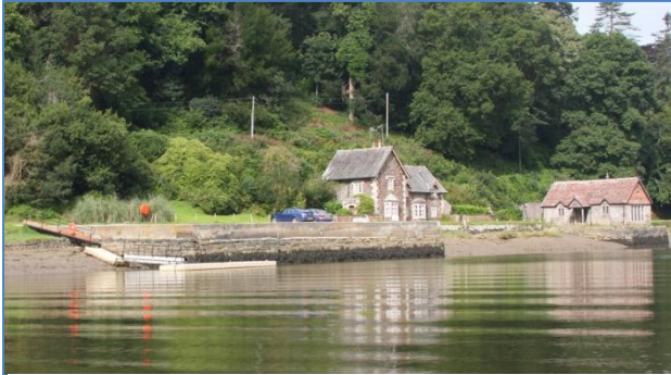
Picturesque Pentillie Quay with the bathing hut on the water's edge (Chart point 6)

Once past Weir Quay, hug the outside of the next two bends, which offer anchorages, and you'll be rewarded by Pentillie Quay which has a picturesque building on the water's edge known as Pentillie Castle's Bathing Hut.