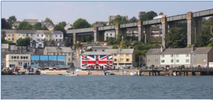
Saltash and the unmistakable 'Union Inn' nestling under the bridges on the Cornish side of the Tamar (Chart point 2)

Sir Francis Drake had strong connections with Saltash, his wife Mary Newman was a local girl and he used the port facilities to unload some of the Spanish treasure ships of their cargo.