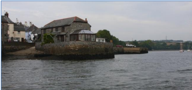
Cargreen to port (Chart point 4)

Trots of moorings mark the approach of Cargreen to port.