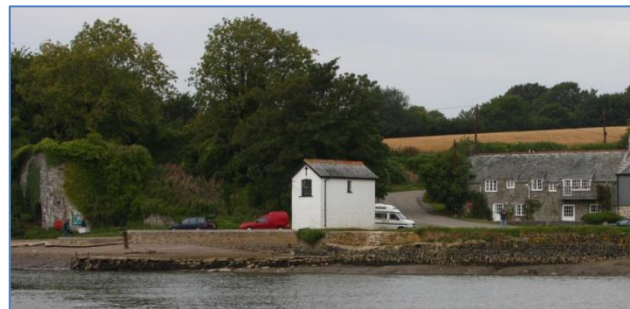
Halton Quay and the smallest chapel, with the remains of the lime kilns on the left. (Chart point 7)

Originally the chapel was the clerk's office during the lime trade era.