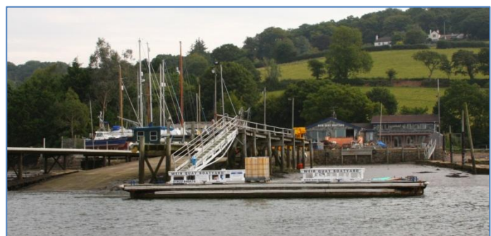
Weir Quay Boatyard (Chart point 5)

It offers visitor moorings and boatyard facilities including, launch and recovery, storage ashore, toilets and showers.