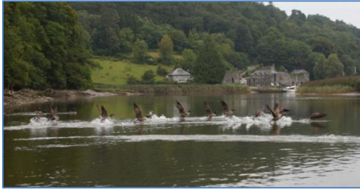
Ducks taking flight with Cotehele Quay ahead.

Continuing along the Tamar, wildlife can be seen in abundance and justifiably the Tamar Valley is designated as an Area of Outstanding Natural Beauty.