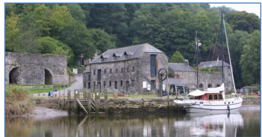
Cotehele Quay, owned by the National Trust. Visiting yacht alongside. (Chart point 8)

There are plenty of deep water holes for anchoring near the quay.