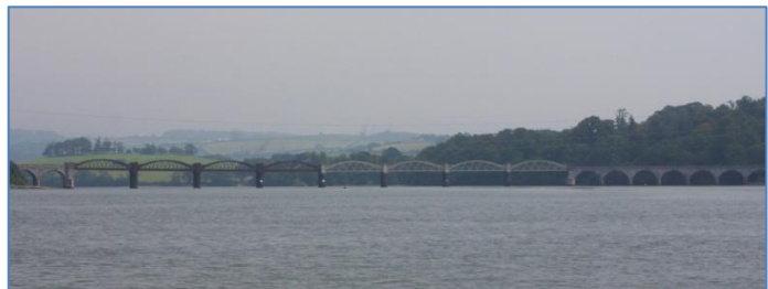
Off to starboard the River Tavy and Railway Bridge (7.2m clearance) (Chart point 3)

Heading north, green buoys mark the eastern bank. At low water, beware a small drying patch (drying 0.3) in the middle of the river near the 3 rd and 4 th green buoys (Warren Point and Neal Point).