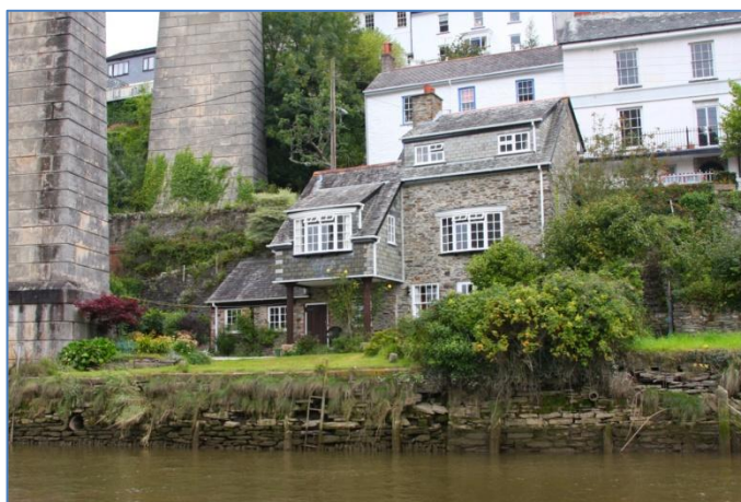
Houses in Calstock nestle against the vast viaduct.

The Calstock Festival is held in early June each year with lots of music, entertainment and stalls.