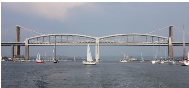
Royal Albert and Tamar Bridges joining Devon and Cornwall (Chart point 1)

Cruising past the Plymouth dockyards our journey starts at the Tamar Bridge, which connects Plymouth in Devon to Saltash in Cornwall.