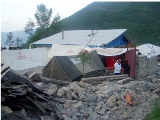
Shelter provided by IRCS in Firouzabad

Team's members have observed , well administrated relief operation and close monitoring of the operation by the government . IRCS is the most active organization in terms of operational capacity. Responsible government authorities were observed to have adequate knowledge and experience to co-ordinate relief and rescue operations. The coping mechanisms of the Government seem to be sufficient to manage the situation.