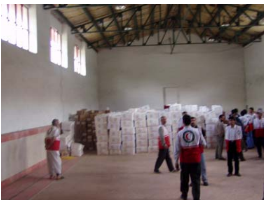
IRCS warehouse in Baladey

IRCS had transported the adequate amount of food items packed in the different size of rations equal to the number of household members.