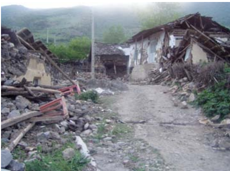
Destruction in Firooz Abad

The traditional buildings constructed of stones, mud and wood were severely damaged. Other buildings such as masonry and concrete buildings were much less or remained not affected. Traditional Roofs were mostly made of wood and iron sheets based on wooden pillars which were not strong enough to stand pressure of earthquake and after shocks.