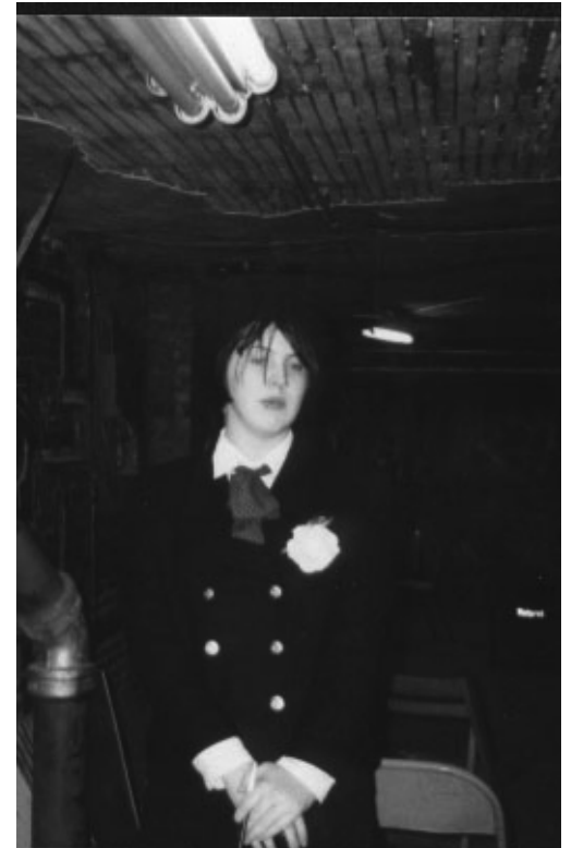
Halloween Party at The A-Zone, October 2002

go into detail about the party, but suffice it to say it was a wild night. Most of the attendees were anarchists or queers or both, and - anarchists know how to party (at least, the "If I can't dance it's not my revolution" types do), queer people hella know how to party, and queer anarchists throw just the best parties. But the most important thing that happened that night was that I joined a chapter of Food Not Bombs, and I found out about the Autonomous Zone. The Autonomous Zone, during the time I spent there, was housed in a dingy storefront on Milwaukee Avenue, wedged between a hair salon and an empty shop that once sold storm windows. It was home to one of the most vibrant communities I've ever been part of. It was the place we mobilized before protests, and the place we met afterward, to figure out who was in jail, who needed bail money, who needed their medication taken to them. It was