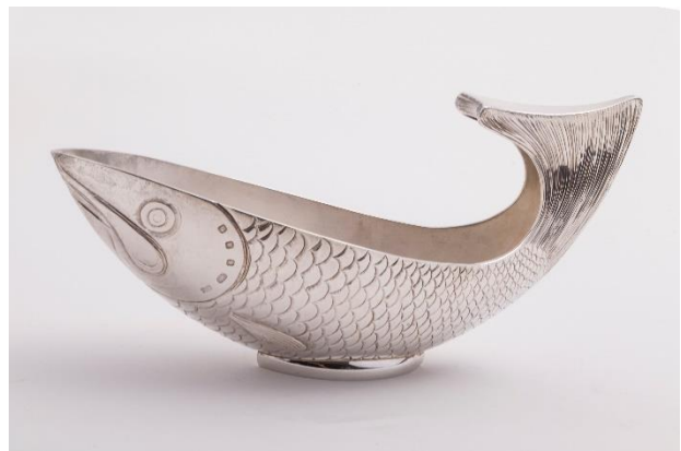
"Transatlantic Salmon" by Graham Stewart, 2003 Smithsonian Folklife Festival.