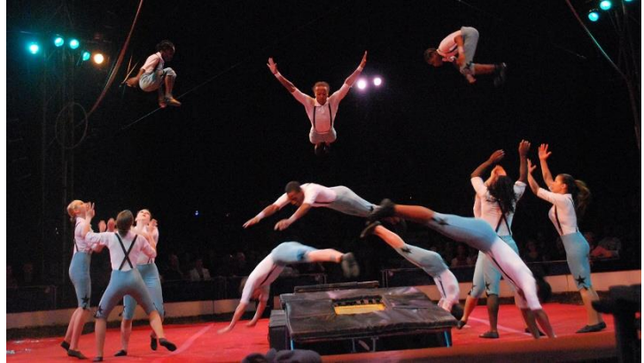
Circus Harmony's St. Louis Arches.