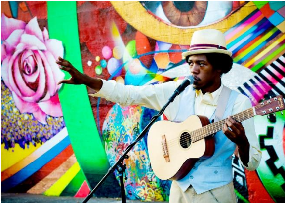
Musician Christylez Bacon.