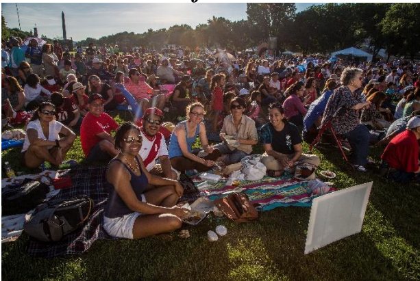
Visitors at the 2015 Smithsonian Folklife Festival; Photo by Francisco Guerra; Ralph Rinzler Folklife Archives and Collections; Center for Folklife and Cultural Heritage; Smithsonian Institution