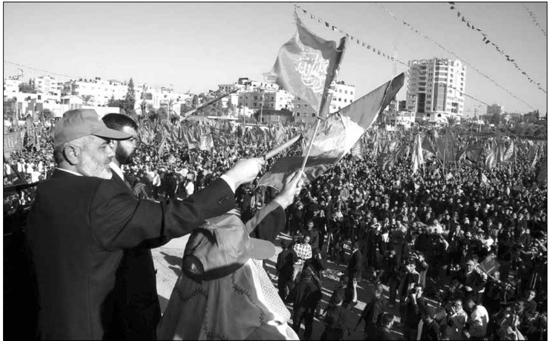
Above: A rally of Hamas supporters in Gaza in 2007

In 2006 Hamas defeated the PLO in a democratic election to control the PA in both the West Bank and Gaza. Hamas was ousted from the West Bank by a coup led by the PLO (with