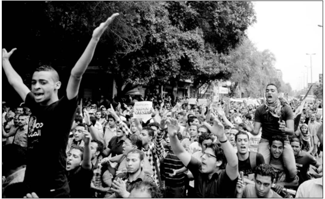
Above: A march following the Egyptian revolution in 2012

The 1960s and 1970s saw a worldwide wave of radicalisation that