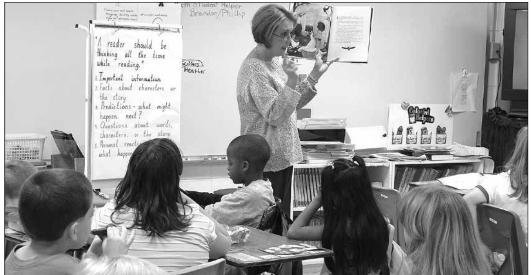
Above: Teaching children to read has become a political battleground

Related to this is the staffing crisis, exacerbated by below-inflation wage rises, with the Victorian government predicting a shortfall of more than 5000 teachers over the next four years. Areas