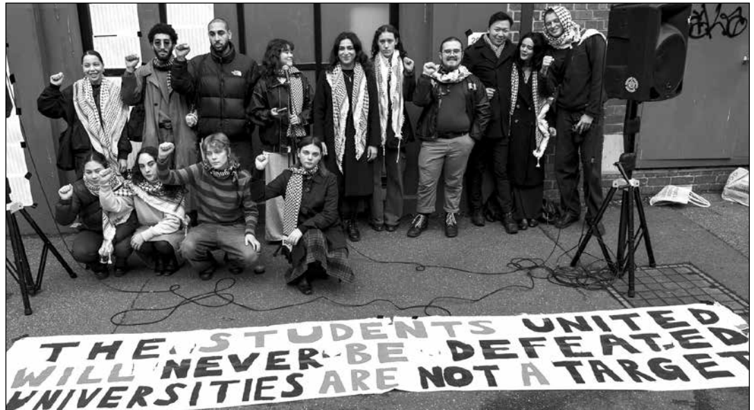
Above: Some of the 21 students at Melbourne Uni facing disciplinary charges for their role in the sit-in for Gaza on campus

We commend SUMSA for eking out these further concessions from