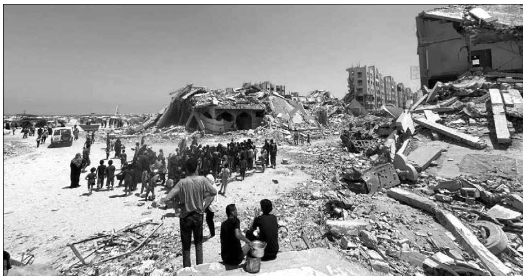
Above: Families in Khan Younis fleeing after the latest evacuation orders

Mass murder but no victory Netanyahu has repeatedly pledged to achieve "total victory" over Hamas. In the face of intense pressure to secure the release of Israeli hostages, he used