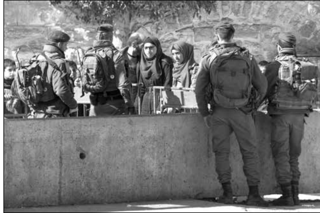
An Israeli checkpoint in the West Bank

ISRAEL HAS taken a major step towards outright annexation of the occupied West Bank, transferring far-reaching legal powers there from the military to civilian officials.