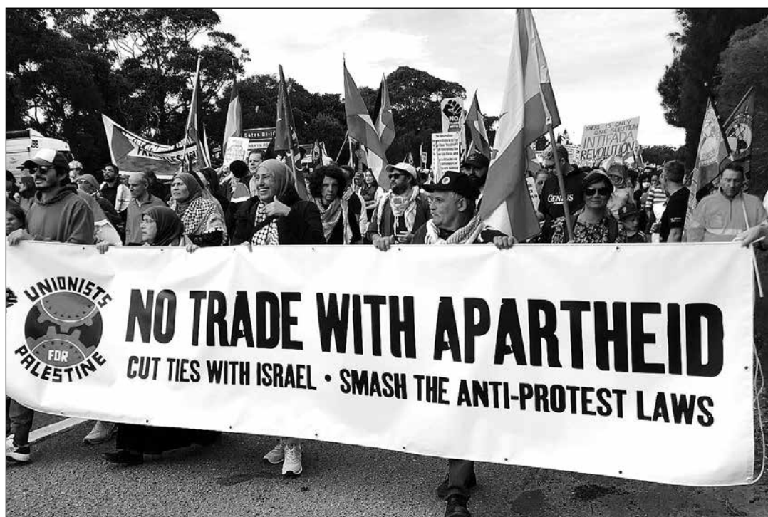
Above: Rank-and-file union members march at Port Botany in Sydney to demand sanctions against Israel

NSWTF officials organised well publicised public forums about the Voice in most teachers' associations but haven't done so about Gaza. The Voice, a symbolic move designed to avoid real change, was pushing