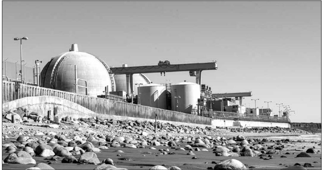
Above: A decommissioned nuclear power plant where nuclear waste still sits in California on the Pacific coast

Labor's commitment to AUKUS has legitimised the nuclear industry generally, and includes agreement to store nuclear waste from US and British vessels here, making it more difficult for Labor to argue that nuclear power is unsafe.