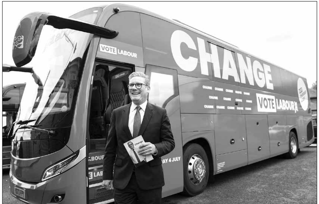
Above: Labour leader Sir Keir Starmer has set out a right-wing agenda

Labour also lost votes on its left due to its backing for Israel's genocide in Gaza.