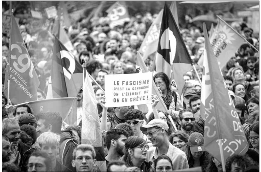
A rally in Lyons, France against the fascists in June

Behind the success in the second round is an agreement between the NPF, including its most left-wing section the France Unbowed party led by Jean-Luc Melenchon, and Macron's party, where the party