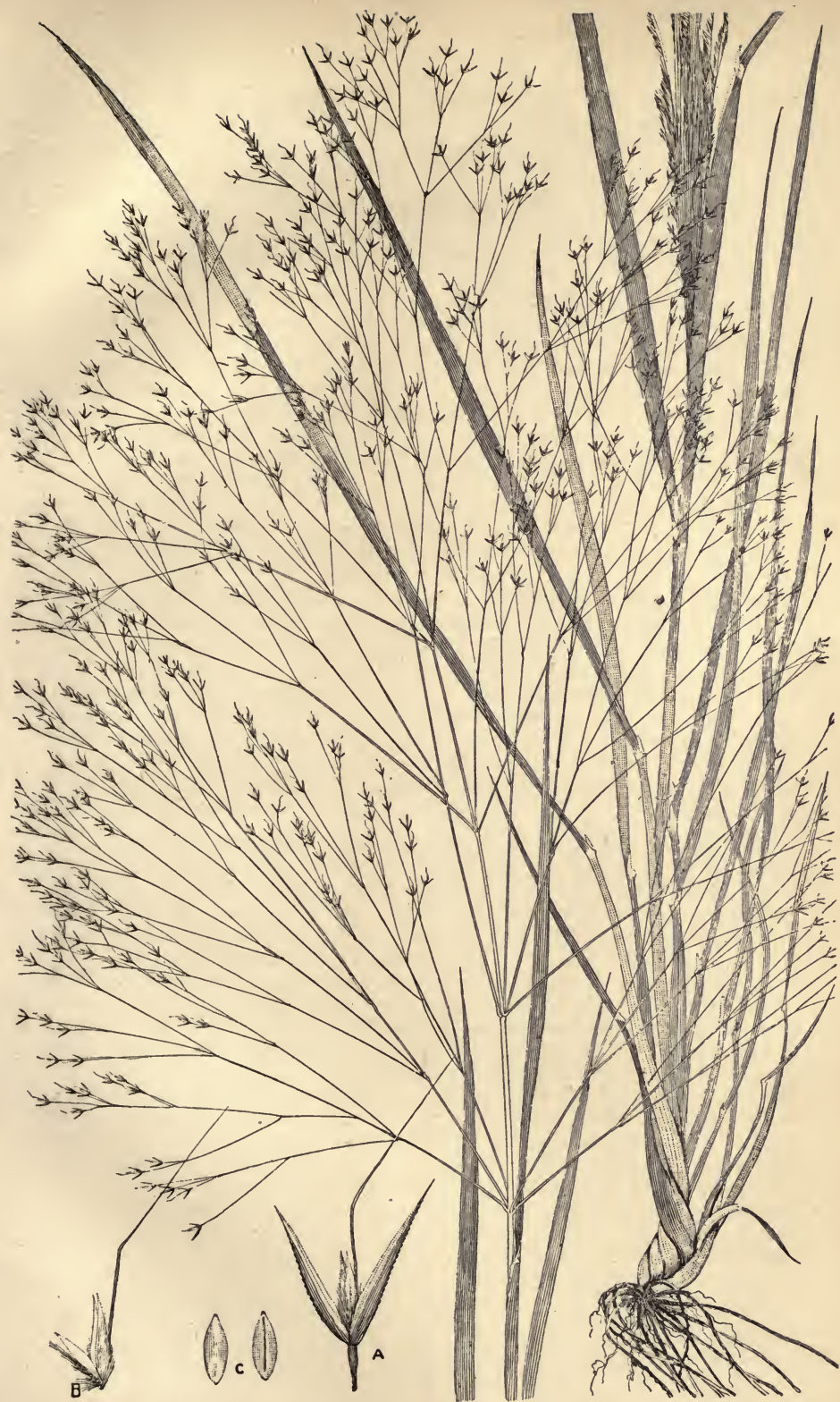
Deyeuxia billardieri , Kunth . "Bent Grass."