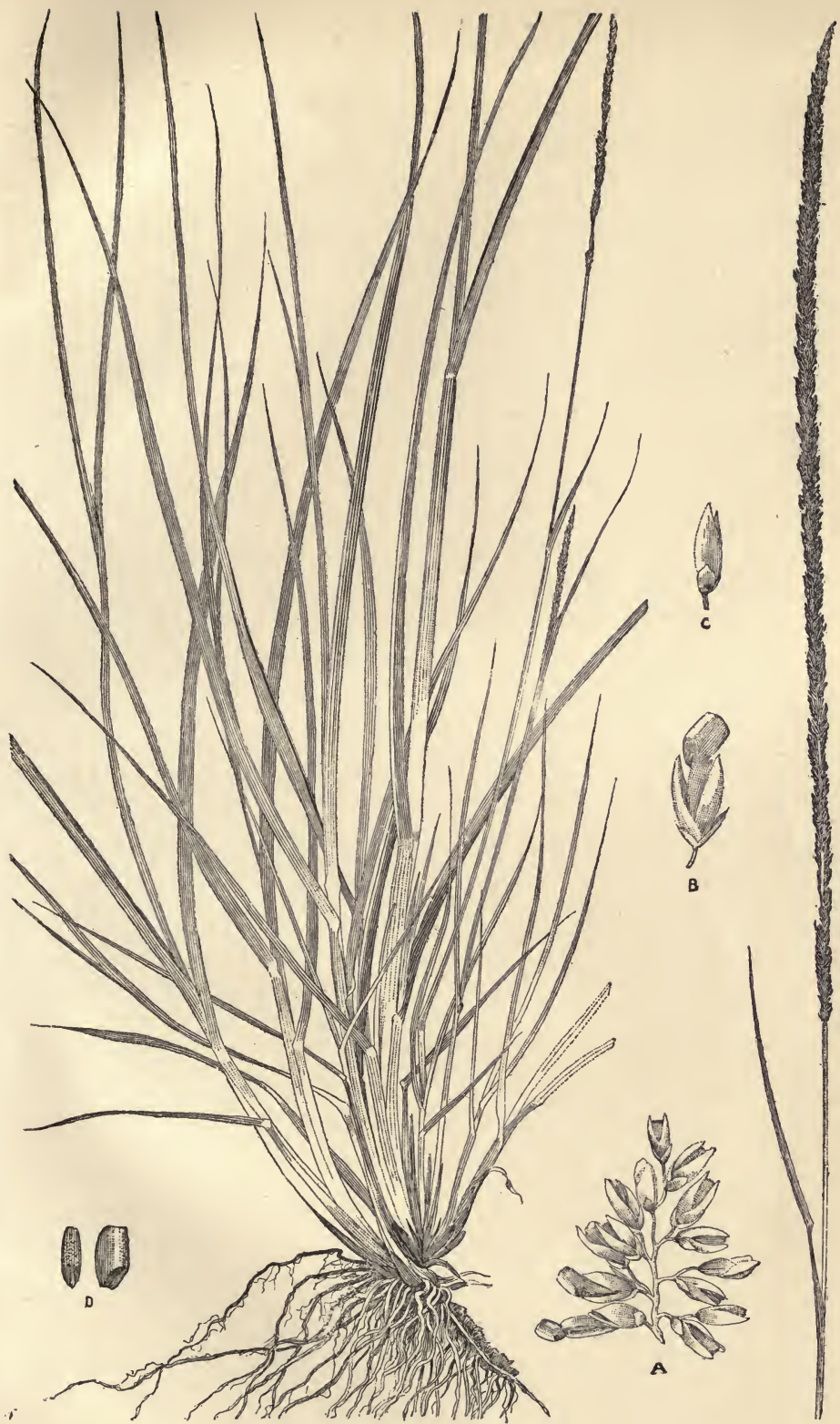
Sporobolus indicus , R. Br. "Parramatta," or "Tussock Grass."