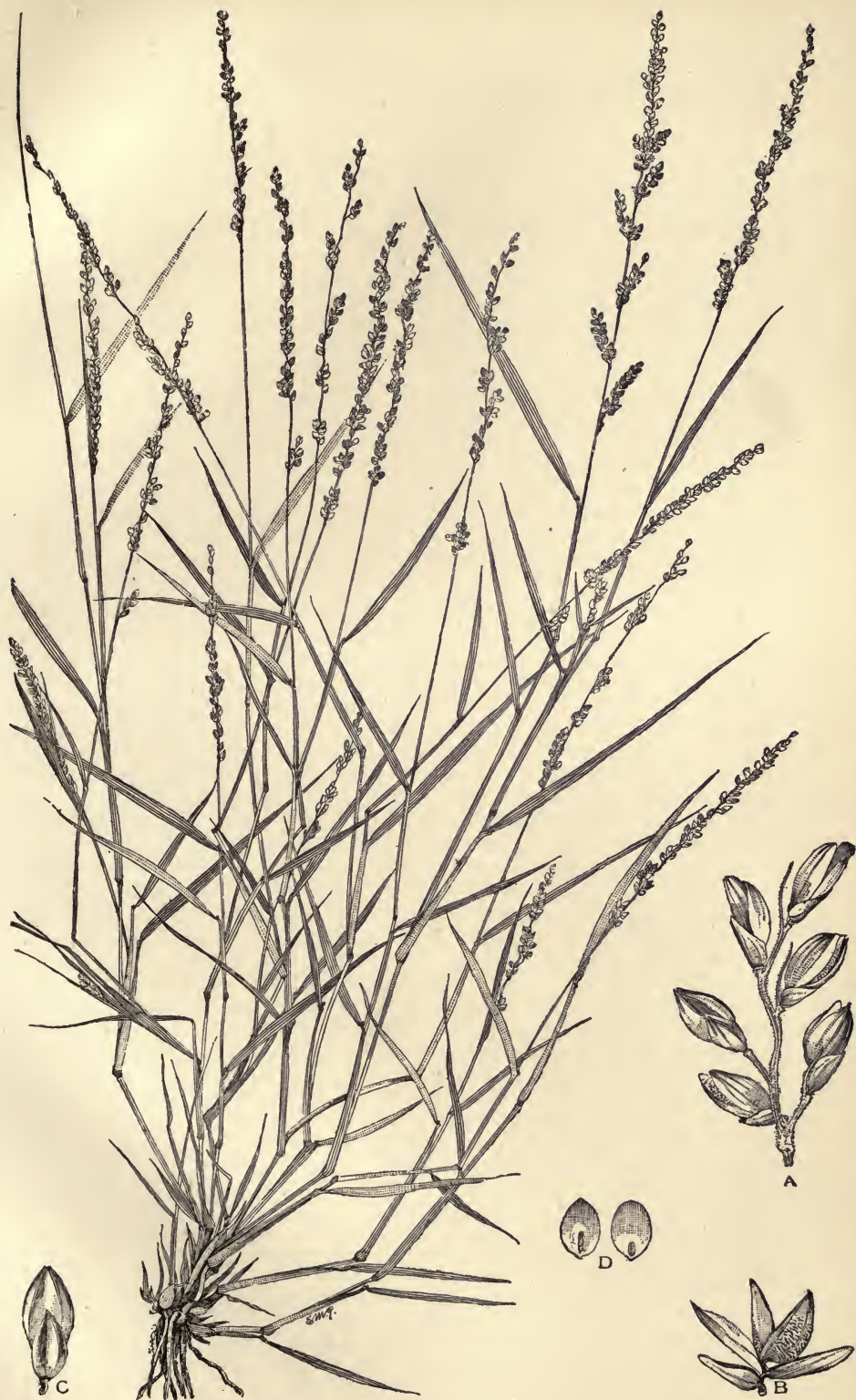
Panicum gracile , R. Br. "Slender Panick Grass."