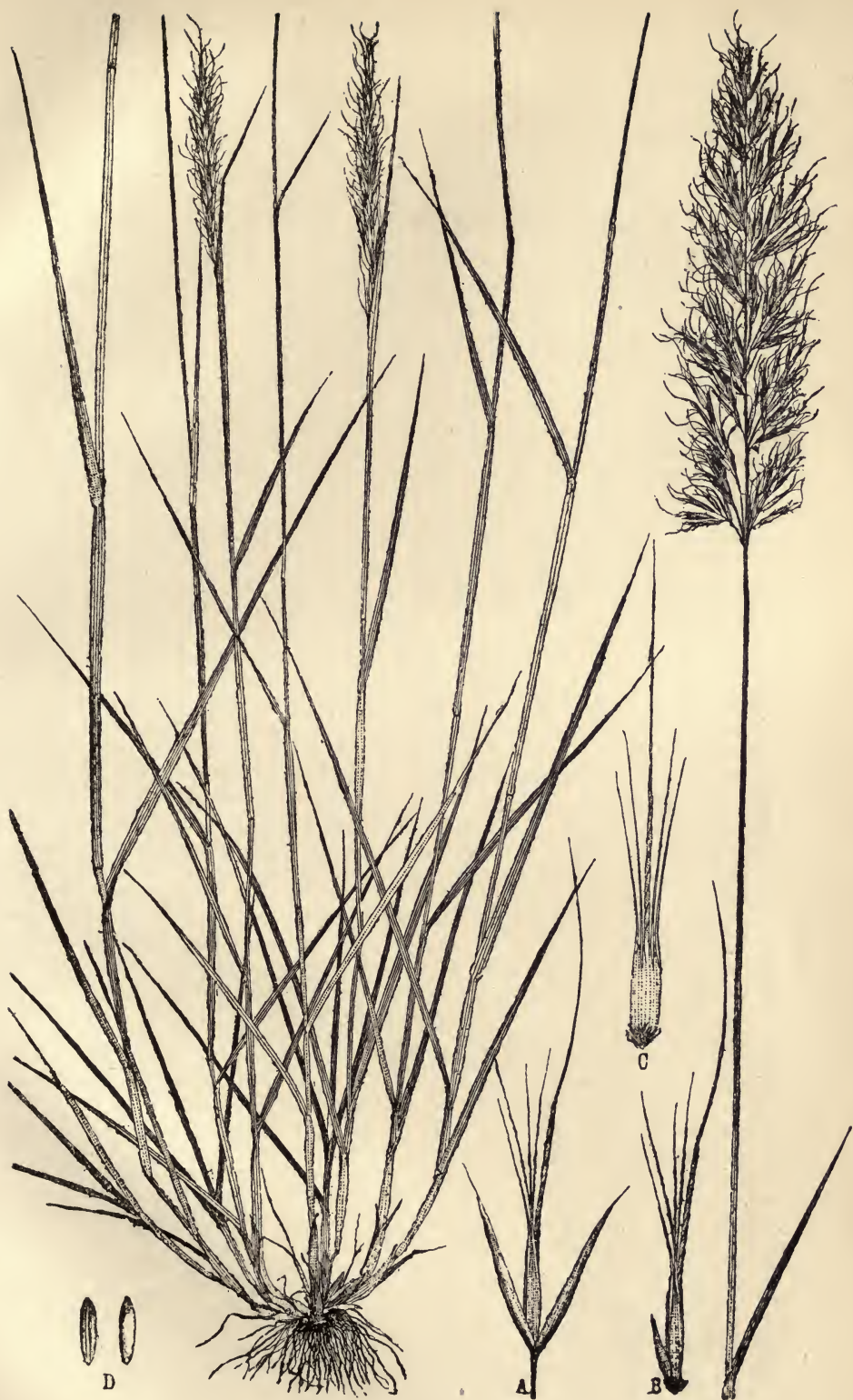
Pentapogon billardieri , R. Br. "Five-awned Grass."