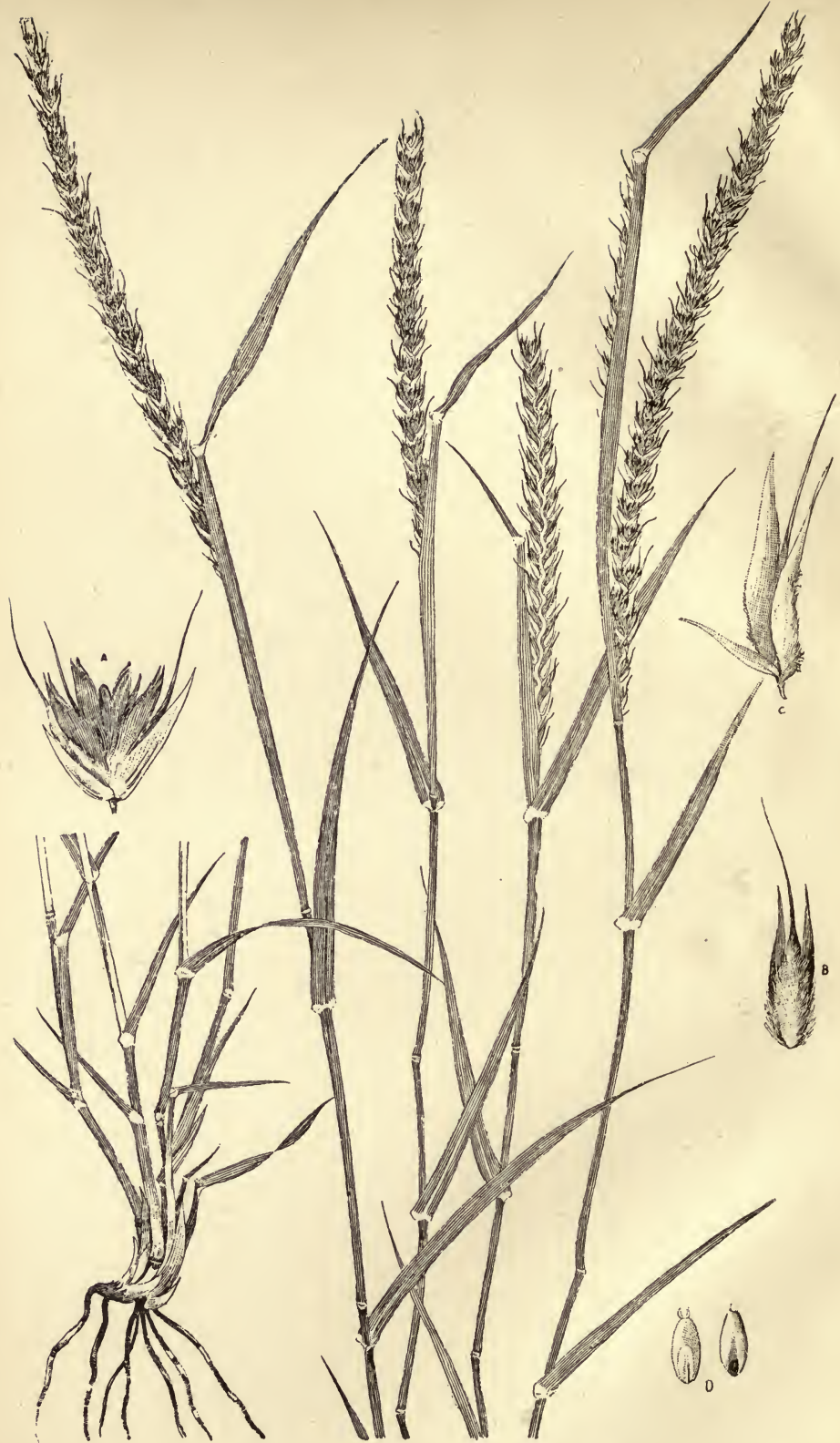
Astrebla triticoides , F. v. M. "Mitchell Grass."