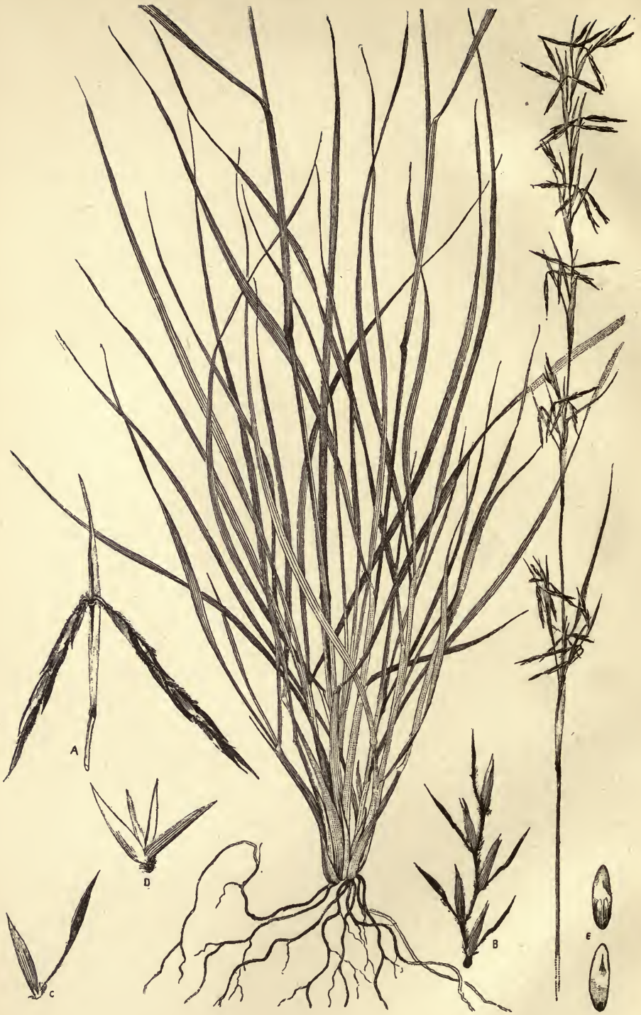
Andropogon refractus , R. Br. A "Kangaroo Grass."