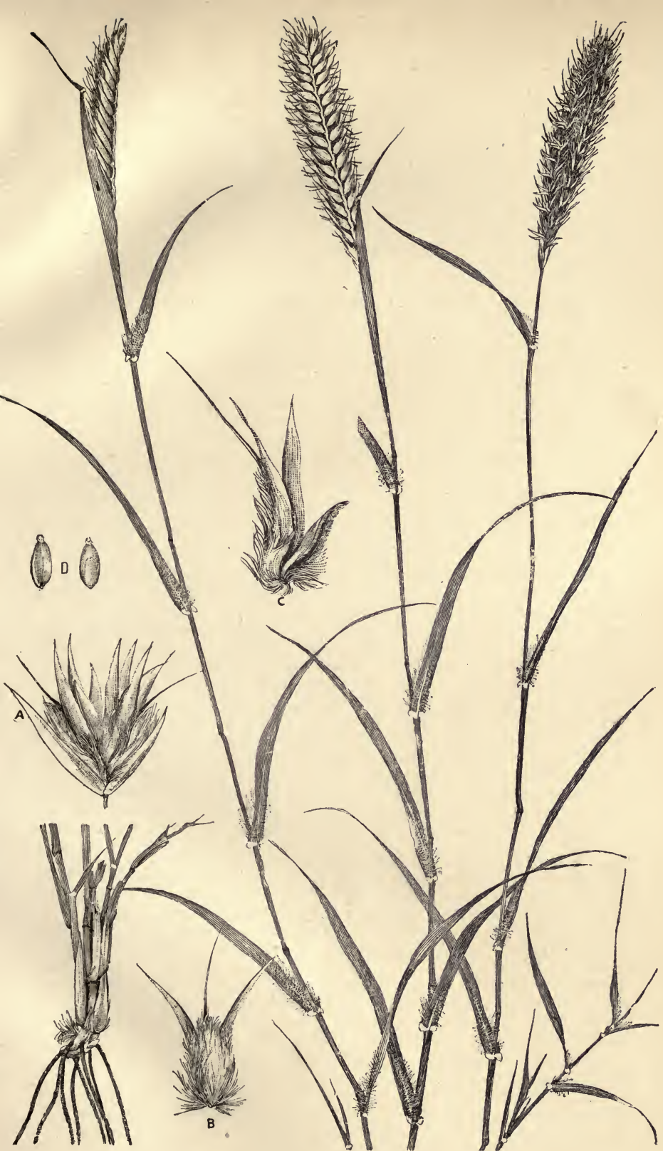
Astrebla pectinata , F. v. M. "Mitchell Grass."