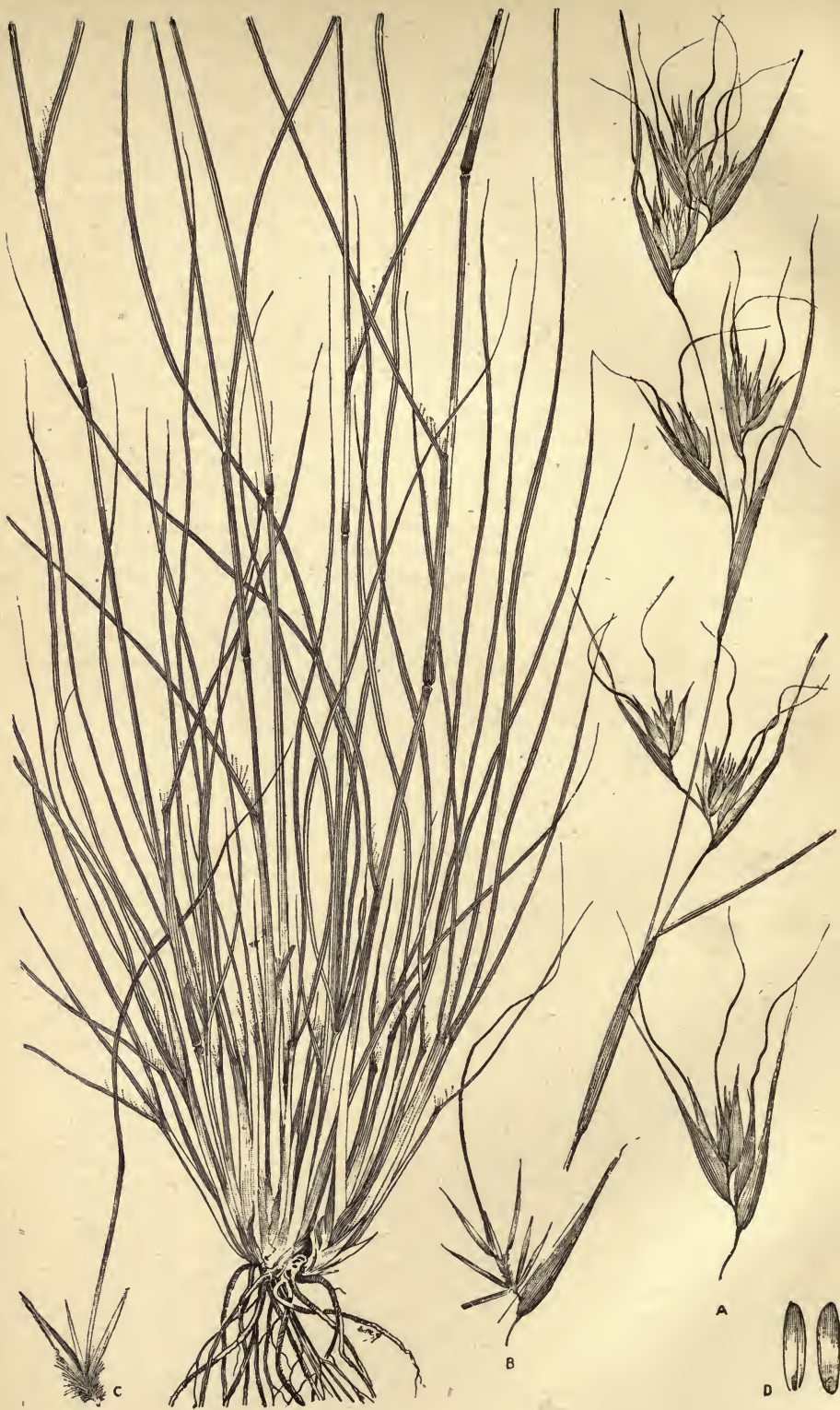
Anthistiria ciliata , Linn. "Kangaroo Grass."