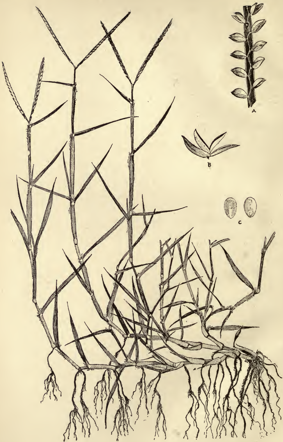
Paspalum distichum , Linn. "Water Couch."