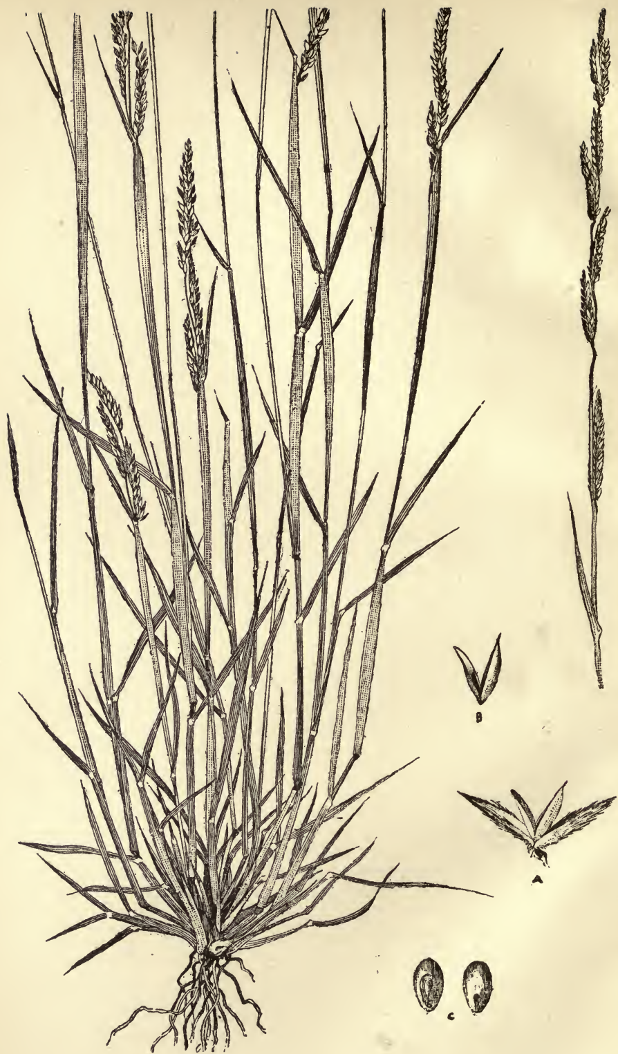
Eriochloa punctata , Hamilt. "Early Spring Grass."