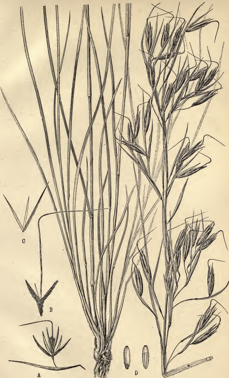
Anthistiria avenacea , F. v. M. "Tall Oat Grass."