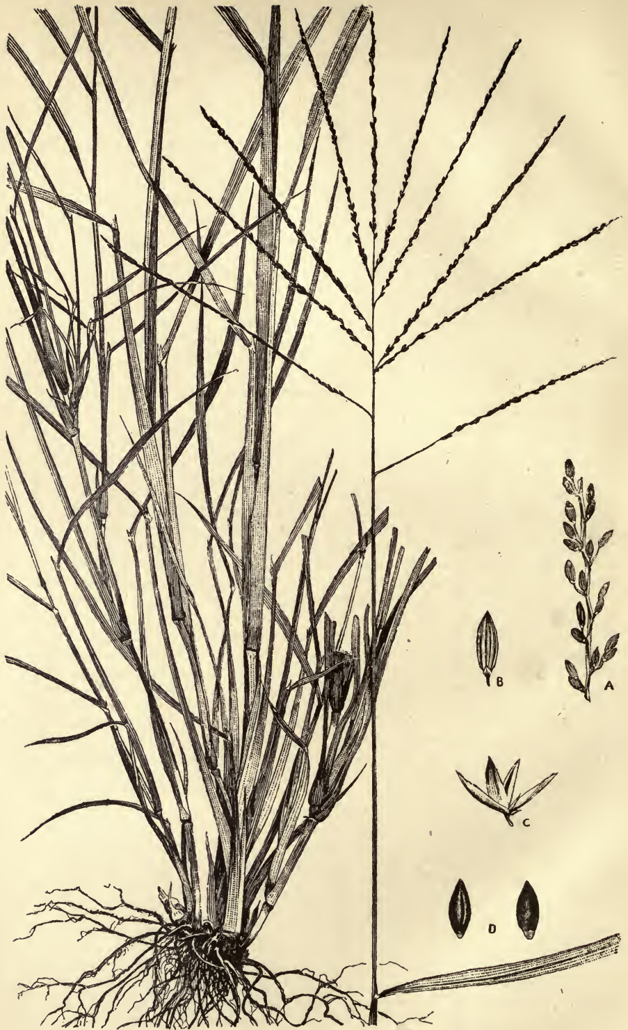
Panicum parviflorum , R. Br. "Small-flowered Panick Grass."