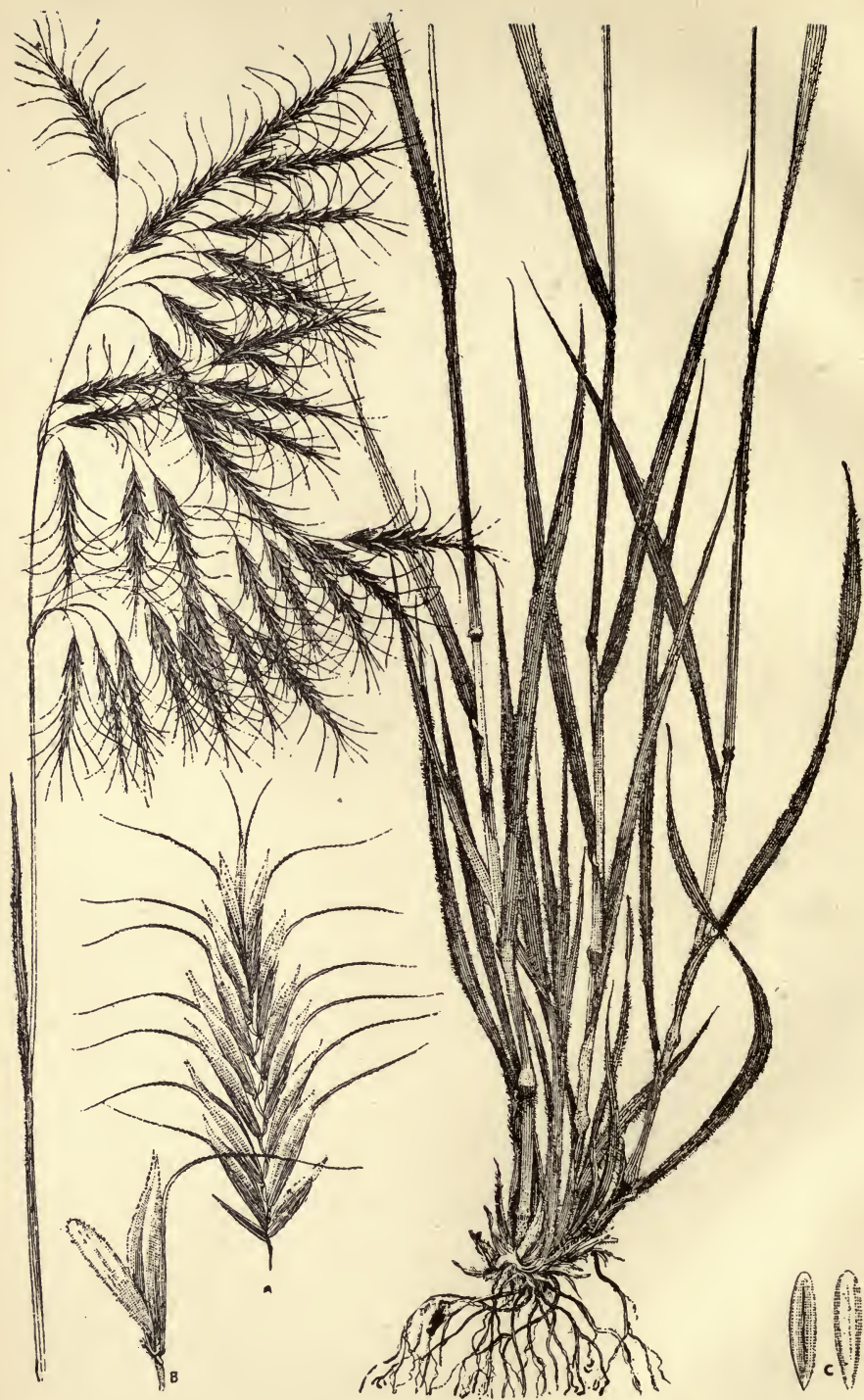
Bromus arenarius , Labill. Var. macrostachya . "Brome," "Oat," or "Barley Grass."