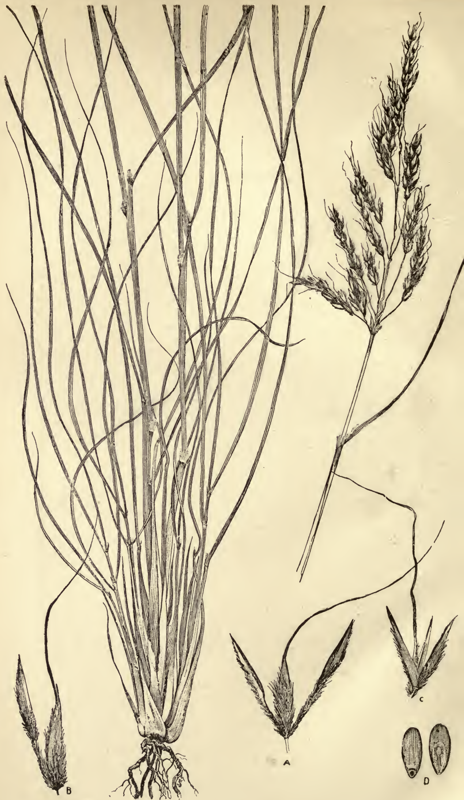
Sorghum plumosum , Beauv.