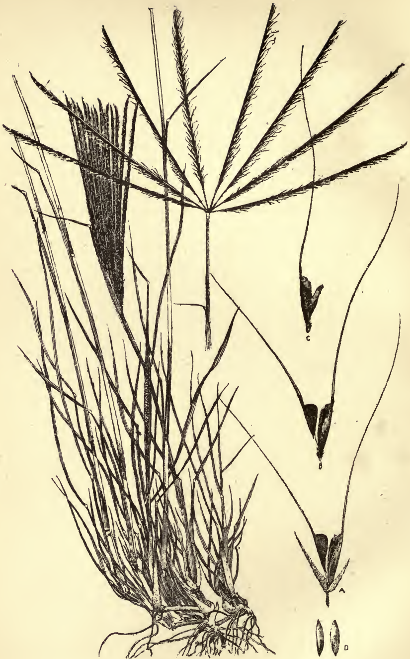
Chloris truncata , R. Br. "Star," or "Windmill Grass."