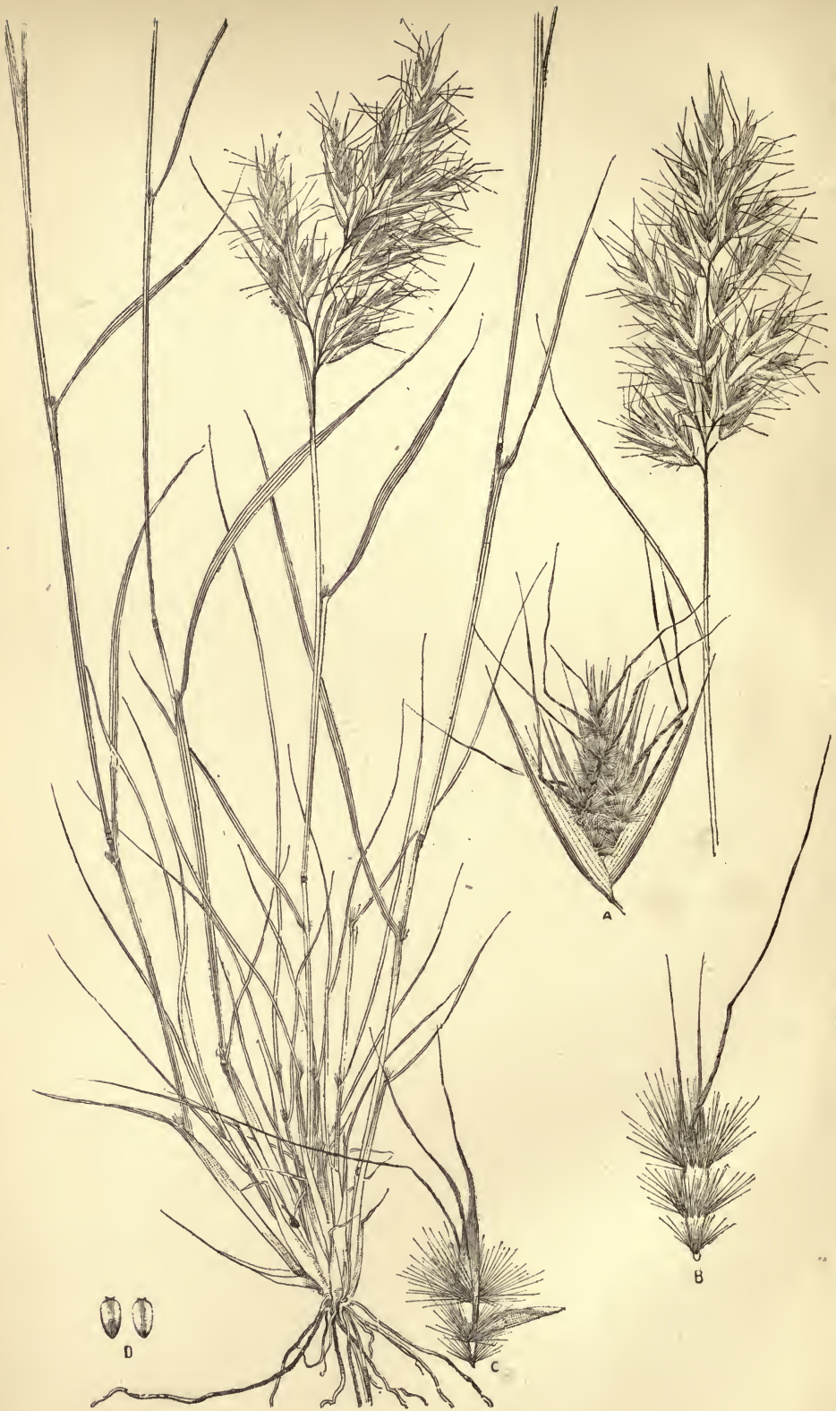
Danthonia semiannularis , R. Br. "Wallaby Grass."