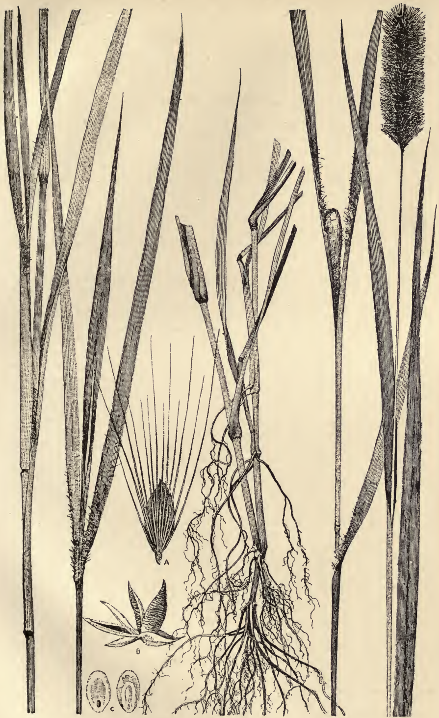
Setaria glauca , Beauv. "Pigeon Grass."