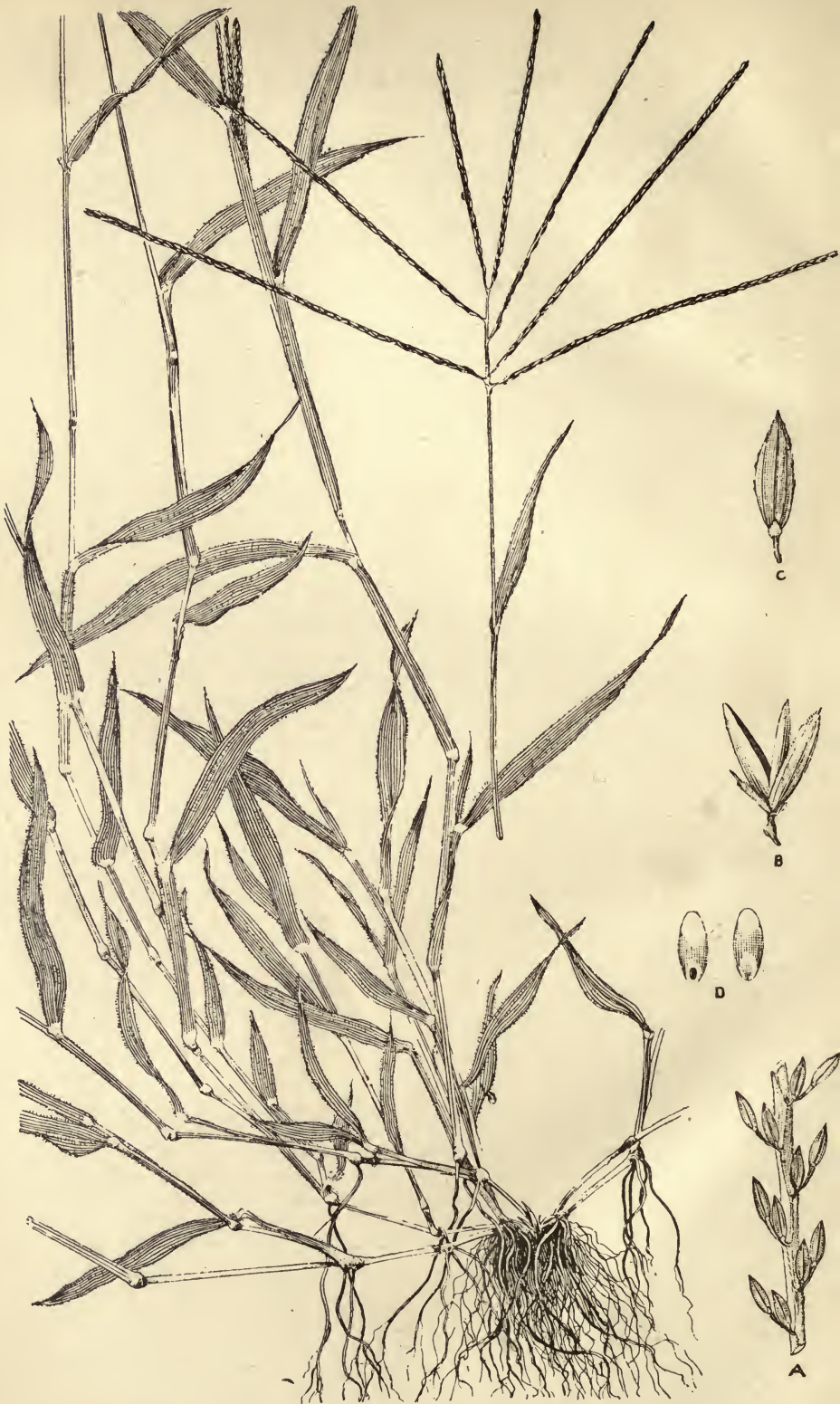
Panicum sanguinale , Linn.