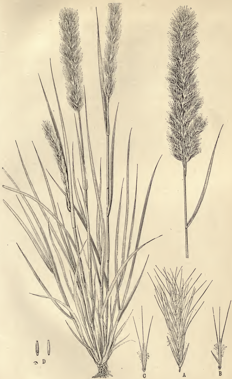
Triraphis mollis , R. Br. "Purple Heads."