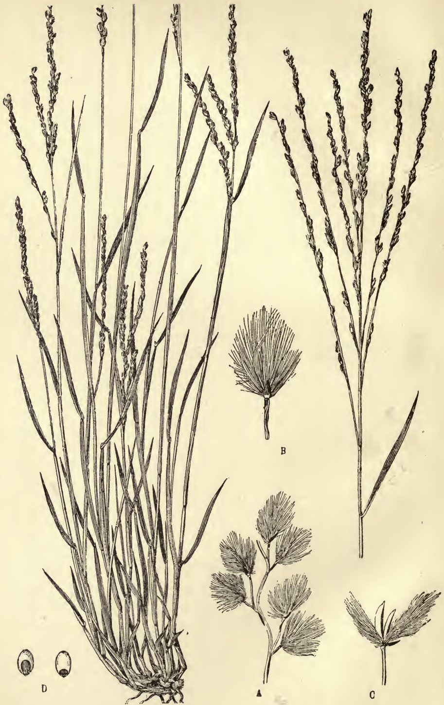
Panicum leucophœum , H. B. et K. "Cotton Grass."