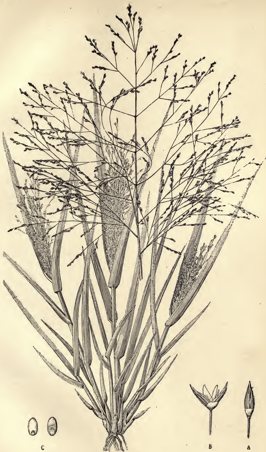
Panicum decompositum , R. Br. "Australian Millet."