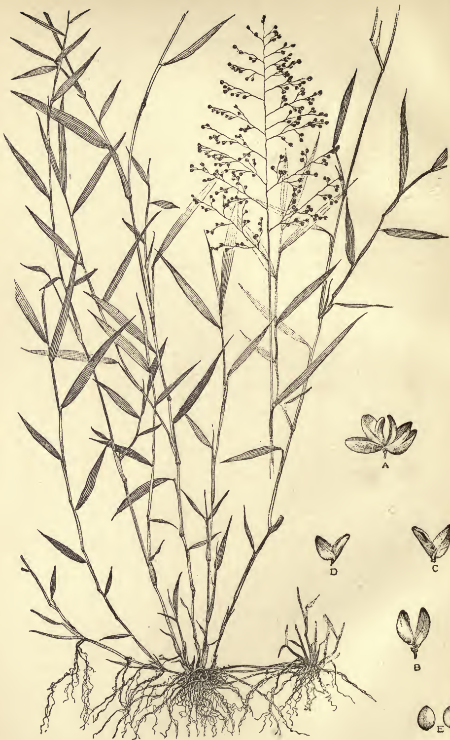
Isachne australis , R. Br. "Swamp Millet."