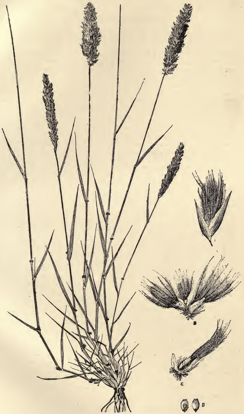
Pappophorum nigricans , R. Br. "Black Heads."