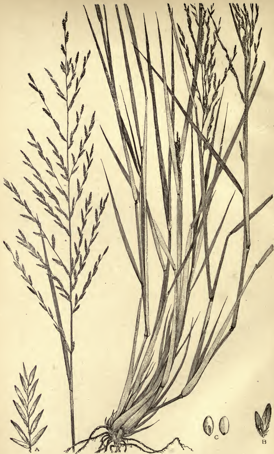
Diplachne fusca , Beauv. "Brown-flowered Swamp Grass."