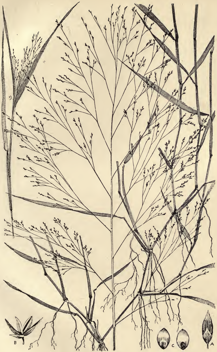
Panicum melananthum , F. v. M. "Black-seeded Panick Grass."