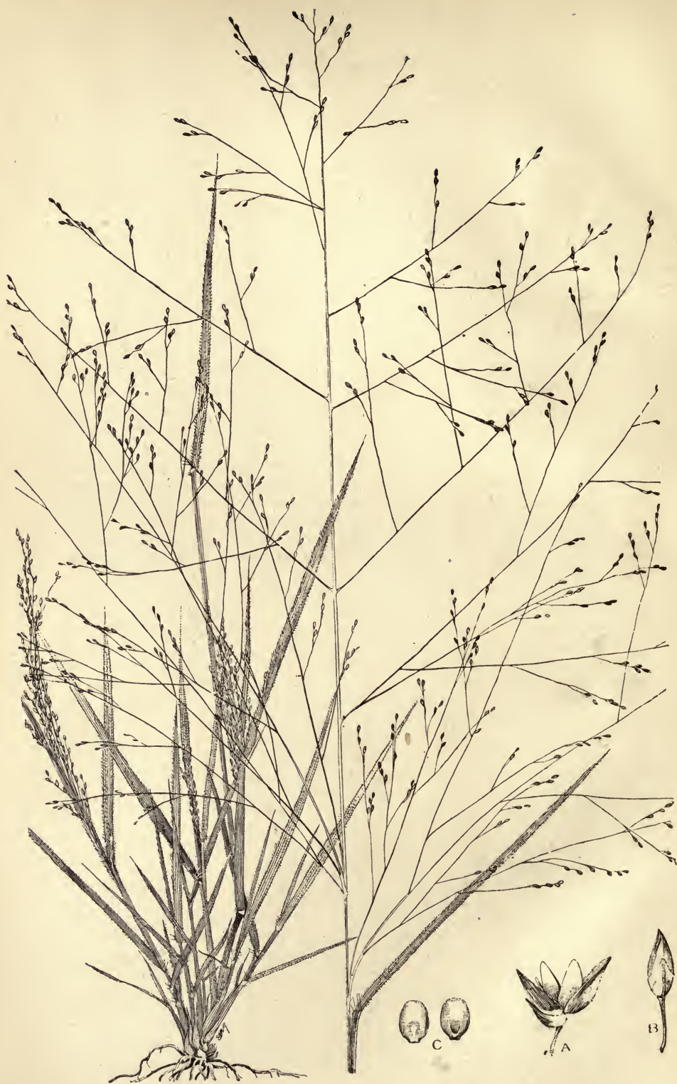
Panicum effusum , R. Br. "Branched Panick Grass."