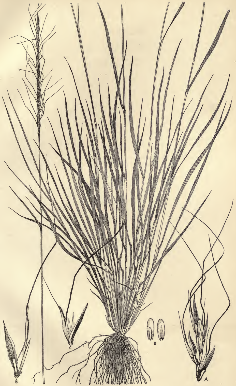
Ischaemum laxum , R. Br. "Rat-tail Grass."