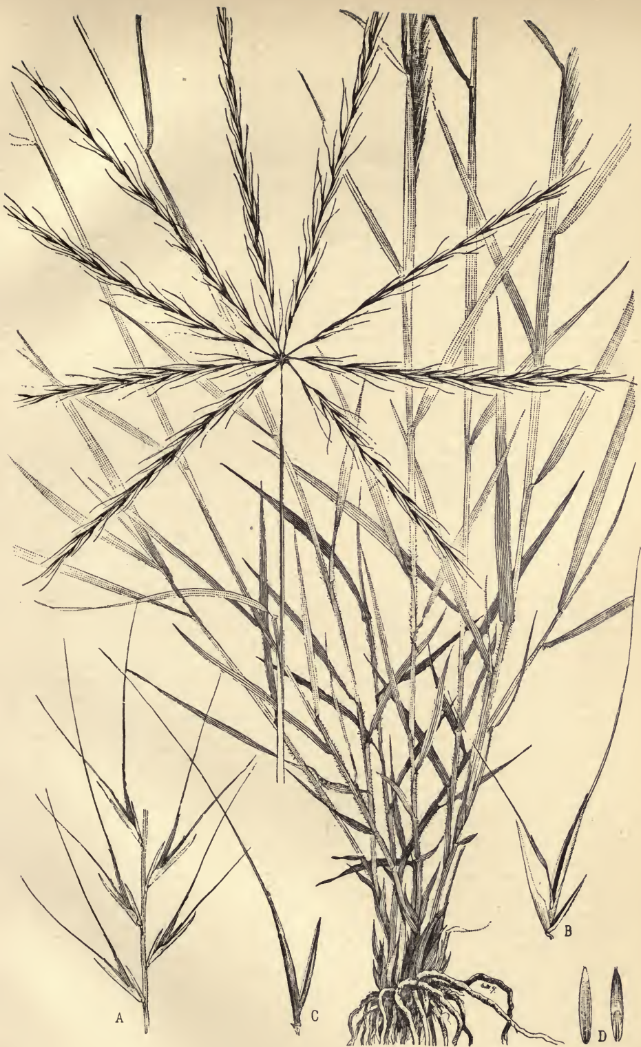
Chloris acicularis , Lindl. "Umbrella," or "Spider Grass,"