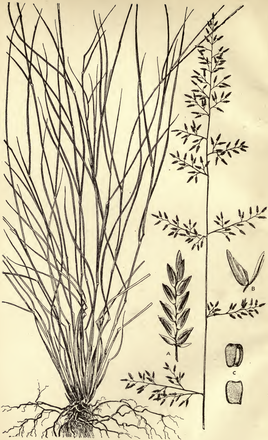
Eragrostis leptostachya , Steud.