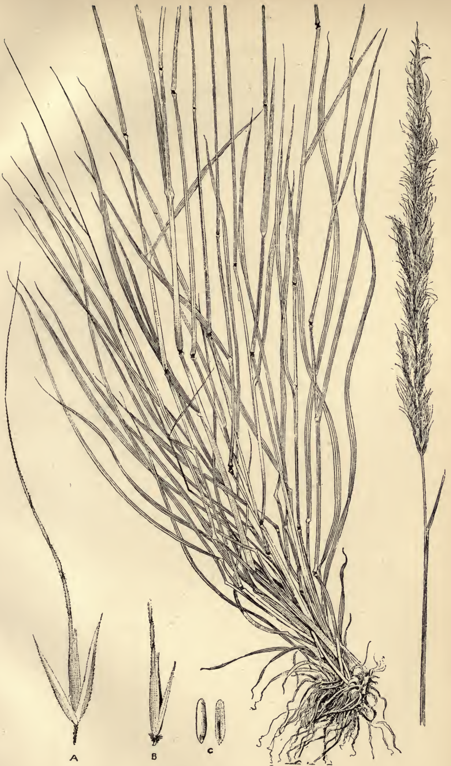
Dichelachne sciurea , Hook. "Short-hair Plume Grass."