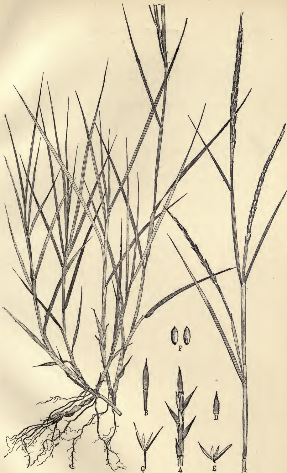
Hemarthria compressa , R. Br. "Mat Grass."