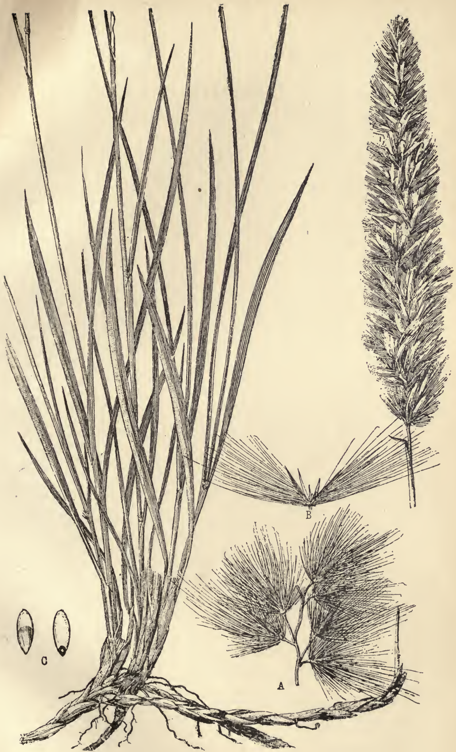
Imperata arundinacea , Cyr. "Blady Grass."