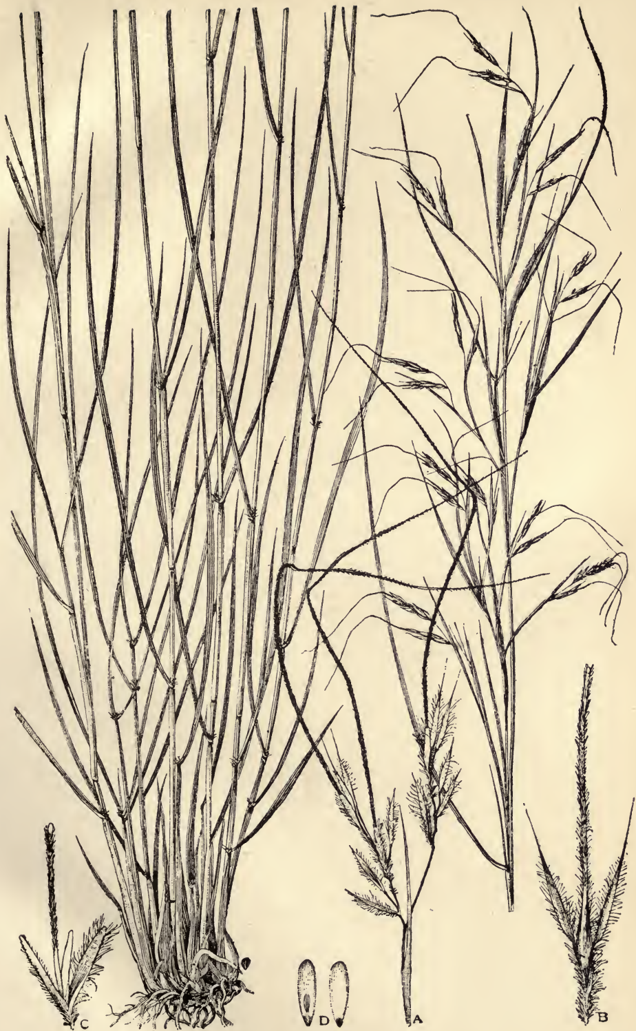
Andropogon lachnatherus , Benth. "Hairy Blue Grass."