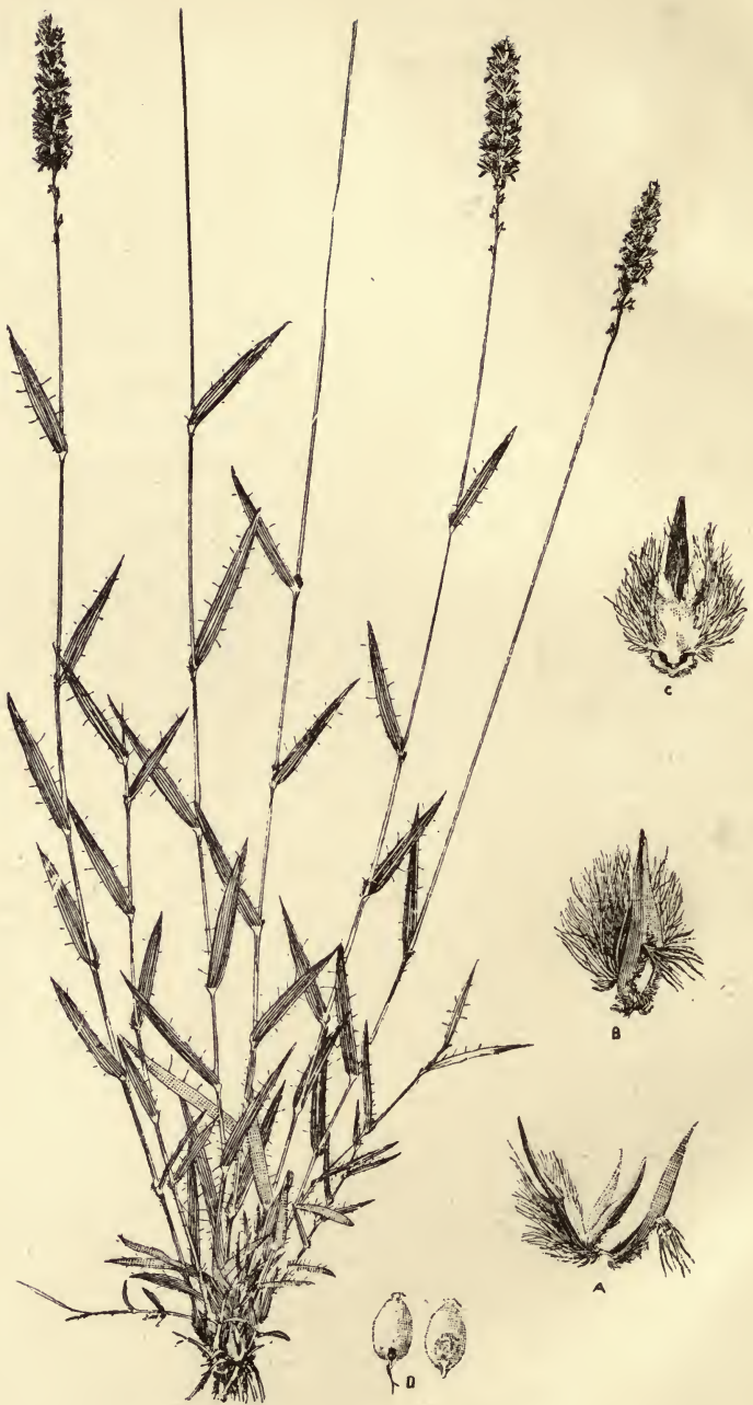
Neurachne mitchelliana , Nees. "Mulga Grass."