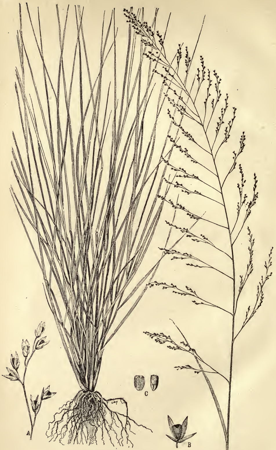
Sporobolus diander, Beauv. "Tussock Grass."