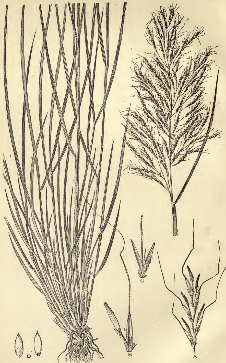
Andropogon intermedius , R. Br.