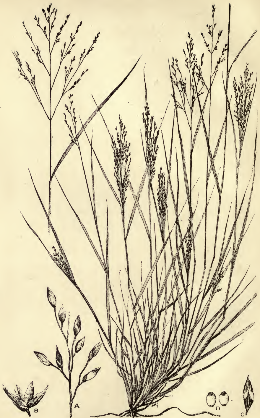
Panicum bicolor , R. Br. "Two-coloured Panick Grass."