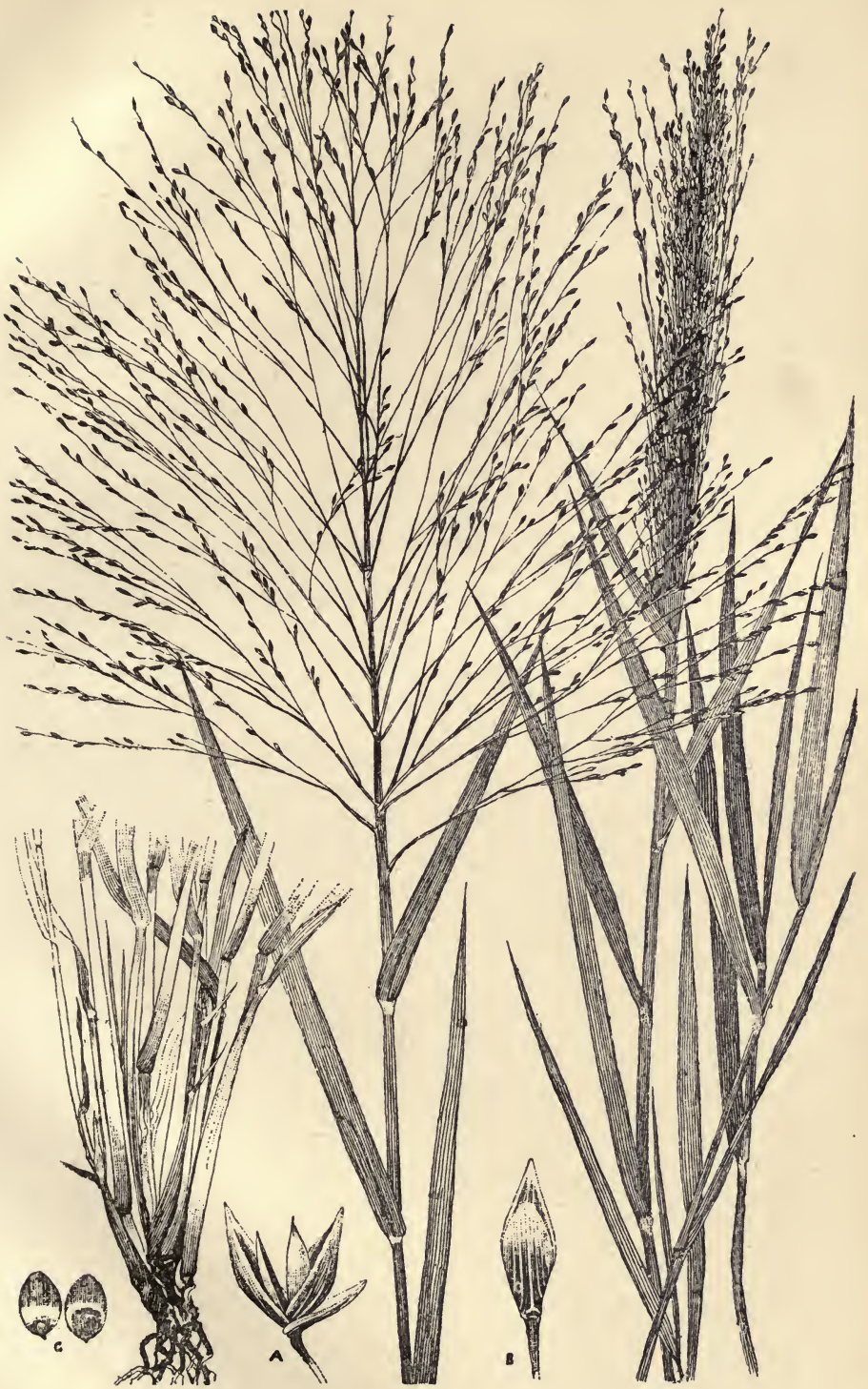
Panicum prolatum , F. v. M. "Rigid Panick Grass."