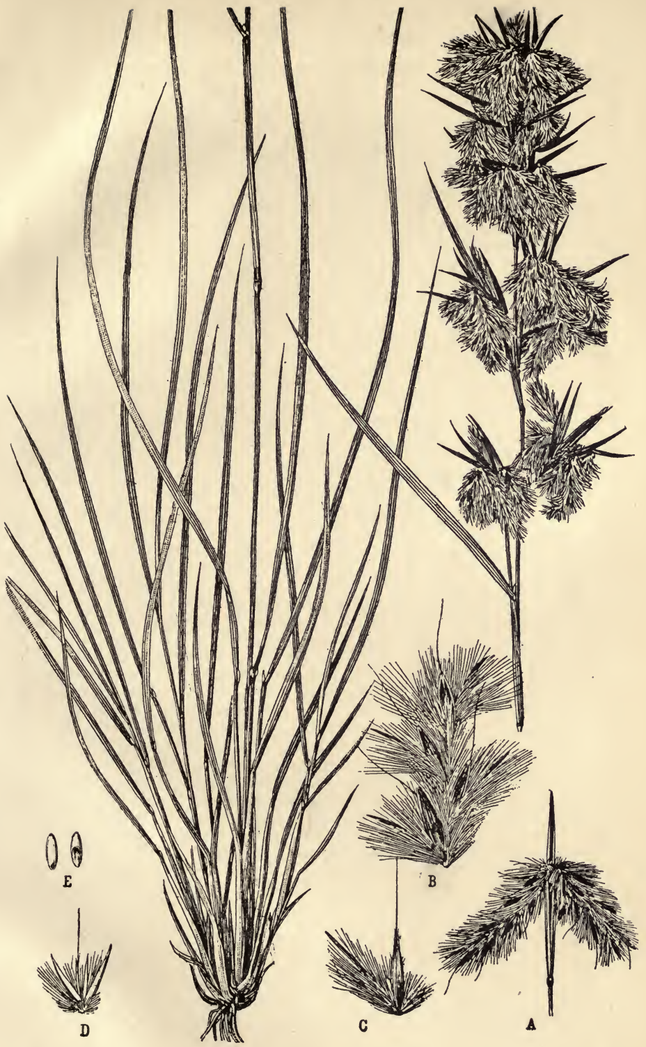
Andropogon bombycinus , R. Br. "Silky Heads."