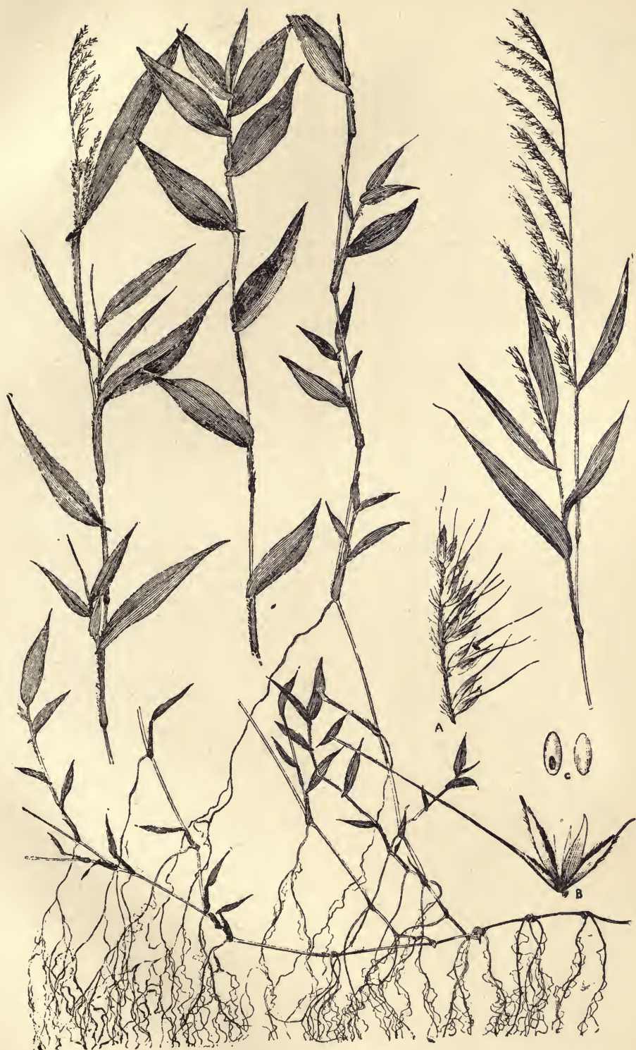
Oplismenus compositus , Beauv.