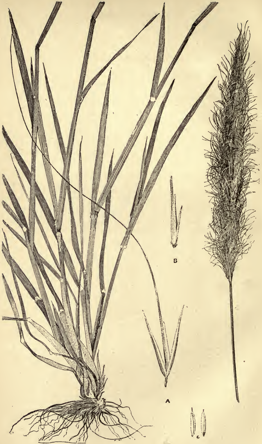
Dichelachne crinita , Hook. "Long-hair Plume Grass."