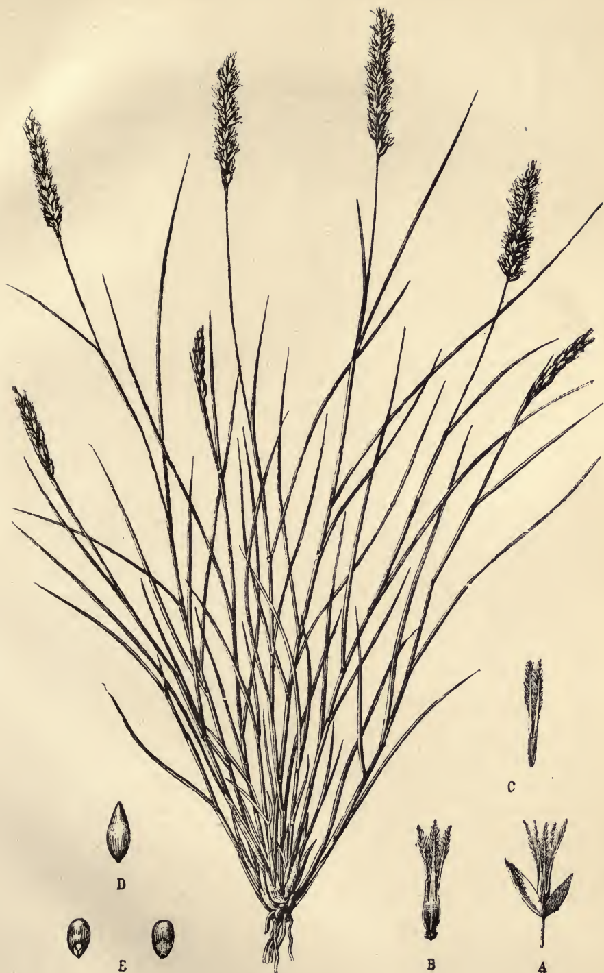
Amphipogon strictus , R. Br. "Bearded Heads."