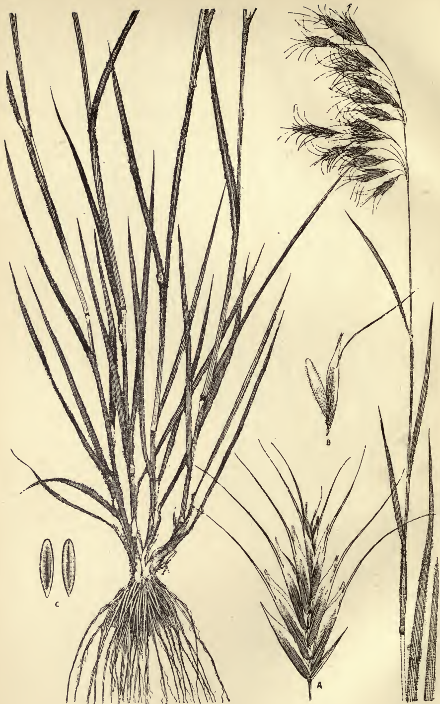
Bromus arenarius , Labill. "Brome," "Oat," or "Barley Grass."