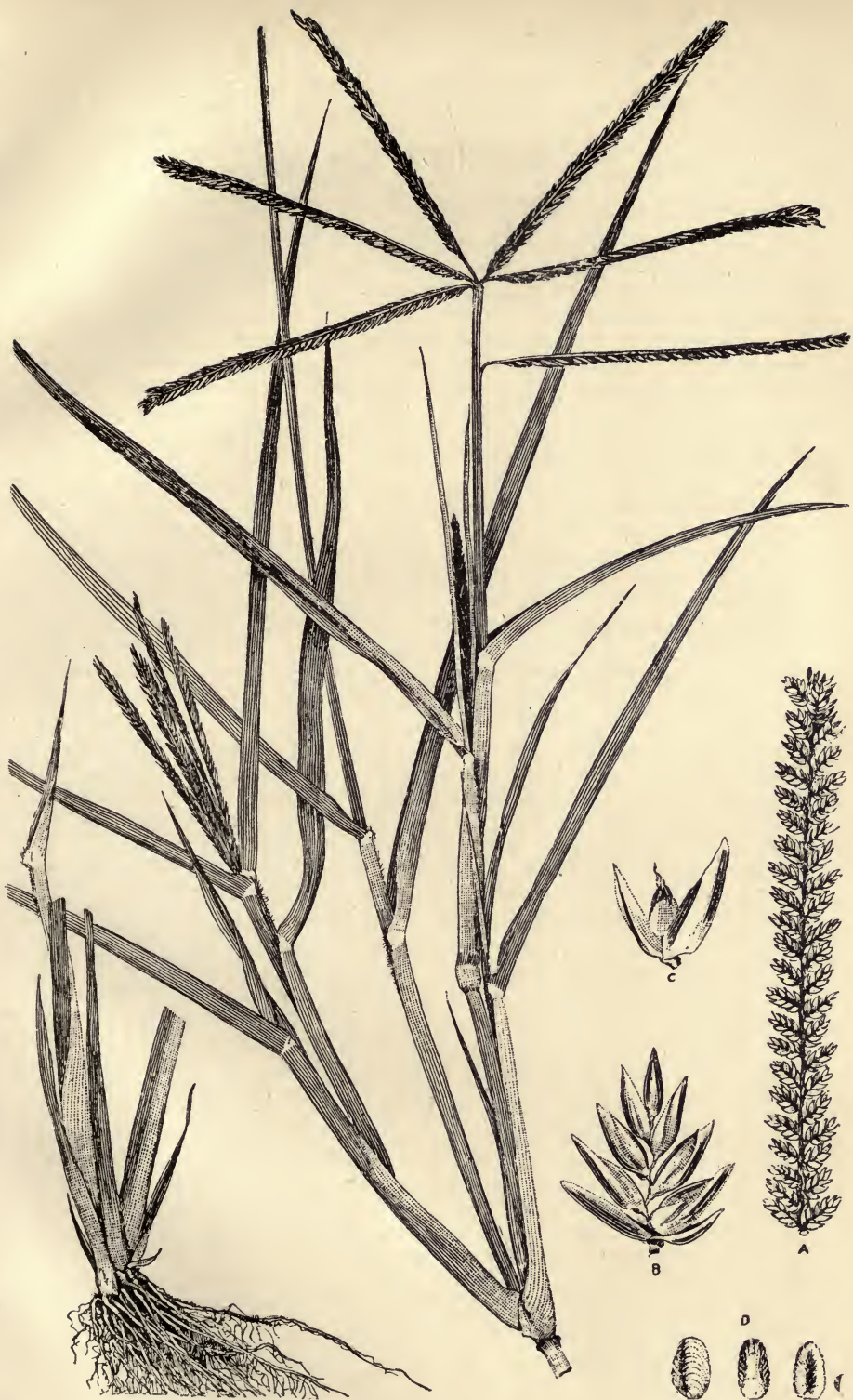
Eleusine indica , Gartn. "Crowfoot," or "Crab Grass."