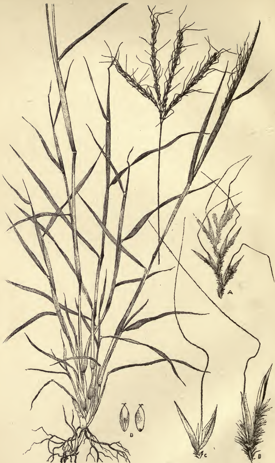
Andropogon affinis , R. Br. "Blue Grass."