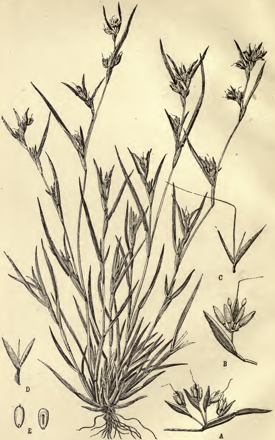
Anthistiria membranacea , Lindl. "Landsborough Grass."