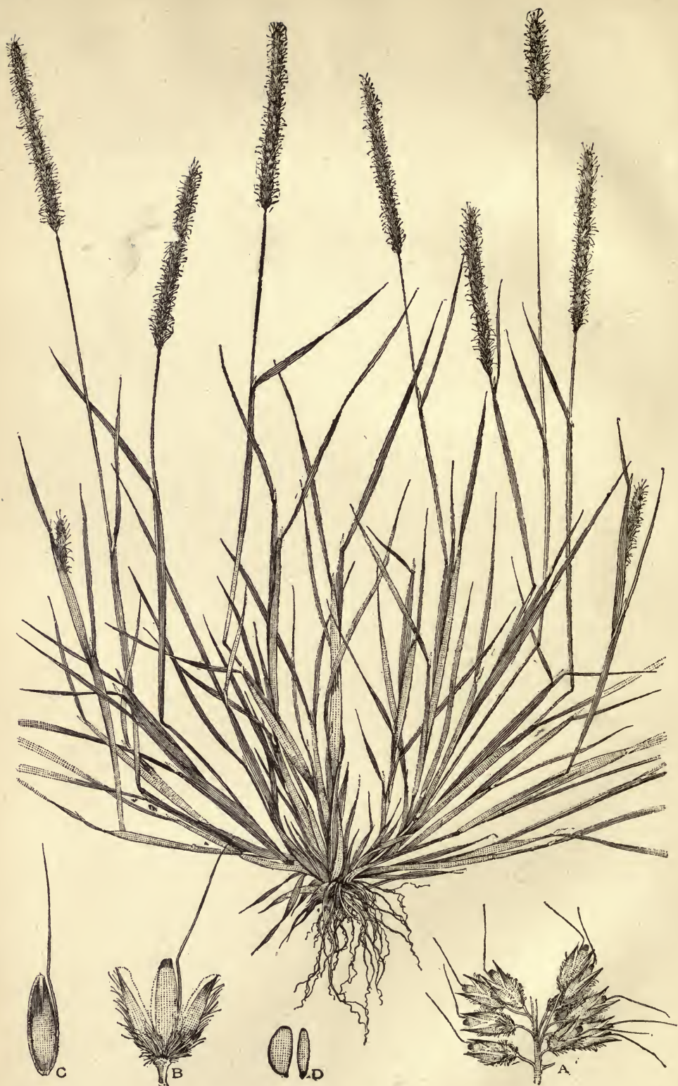
Alopecurus geniculatus , Linn. "Knee-jointed Foxtail," "Water Foxtail Grass."