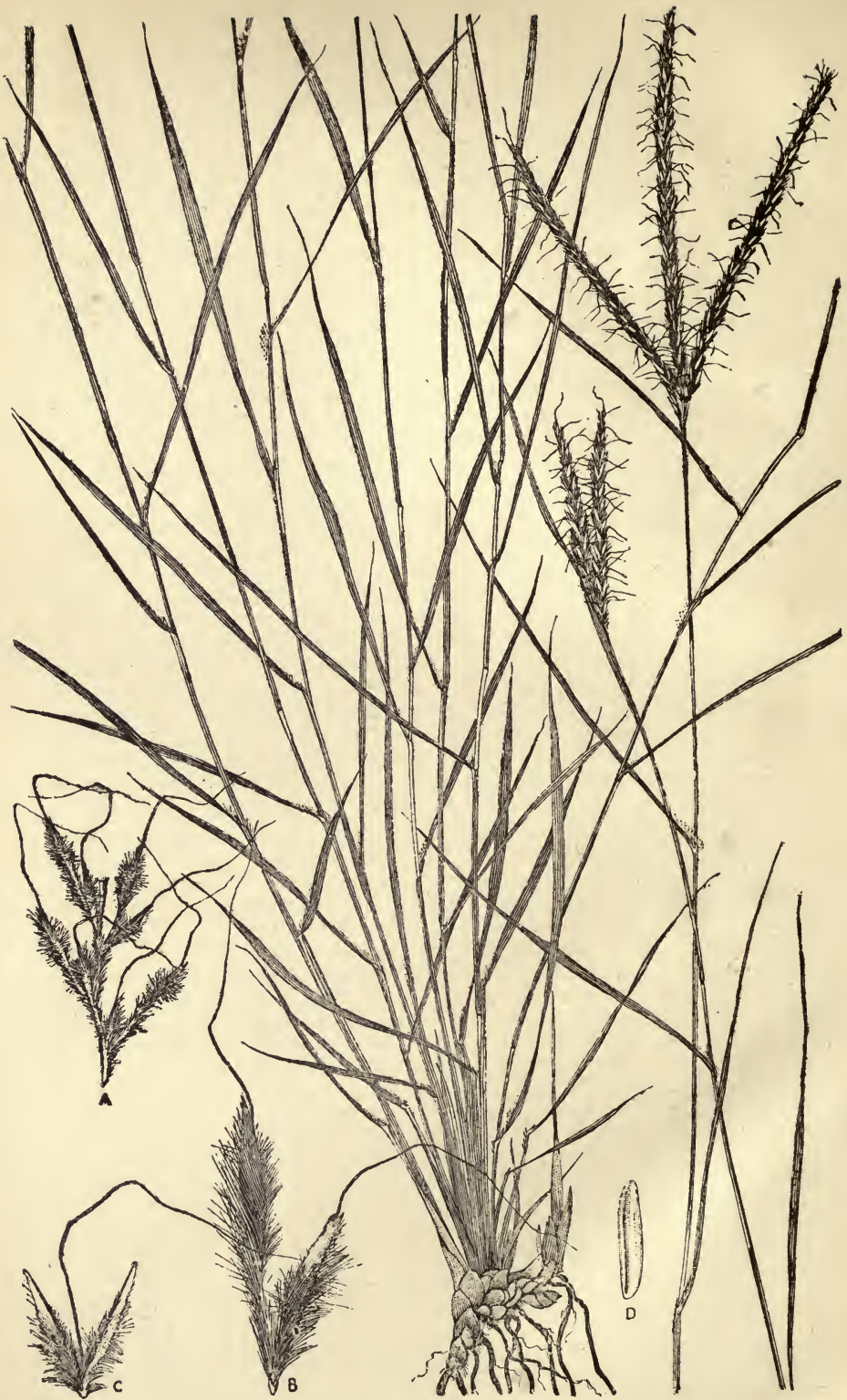
Pollinia fulva , Benth. "Sugar Grass."