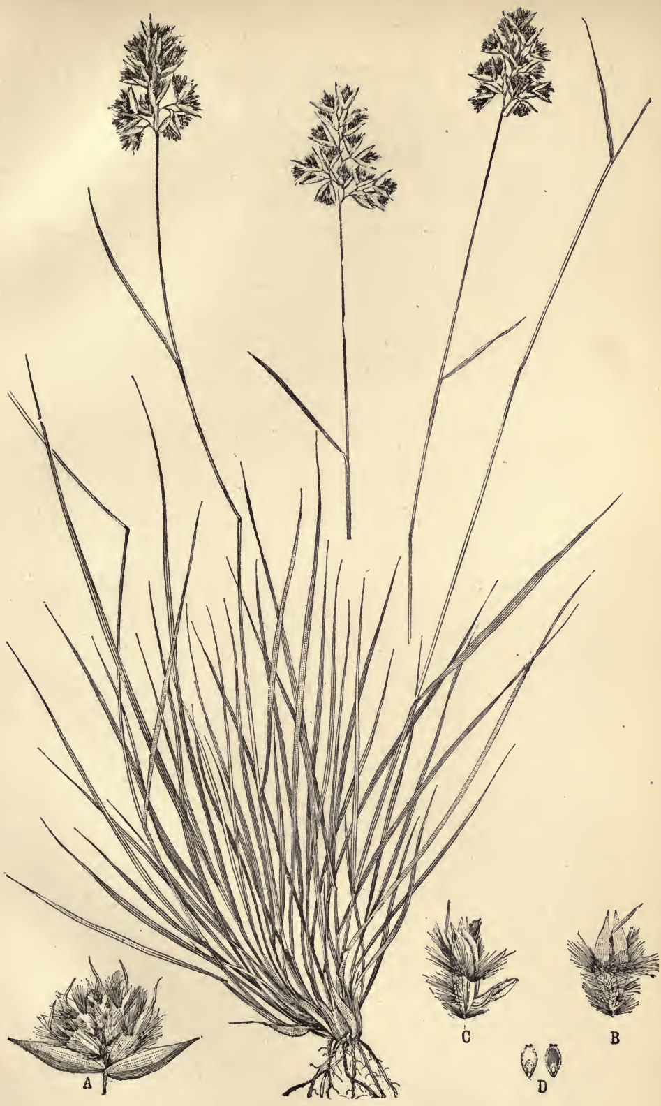
Danthonia carphoides , F. v. M. "Oat Grass."