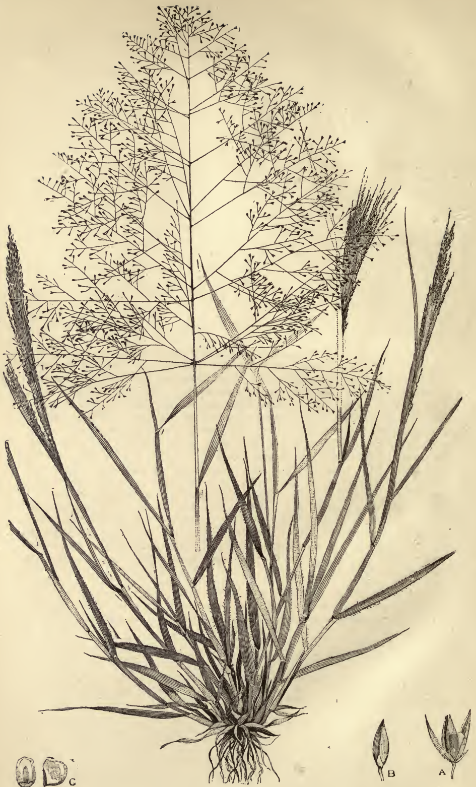
Sporobolus lindleyi , Benth. "Pretty Sporobolus."